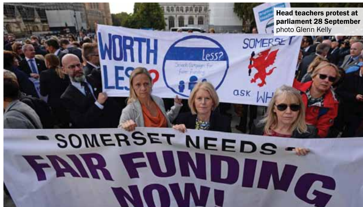
Head teachers protest at parliament 28 September