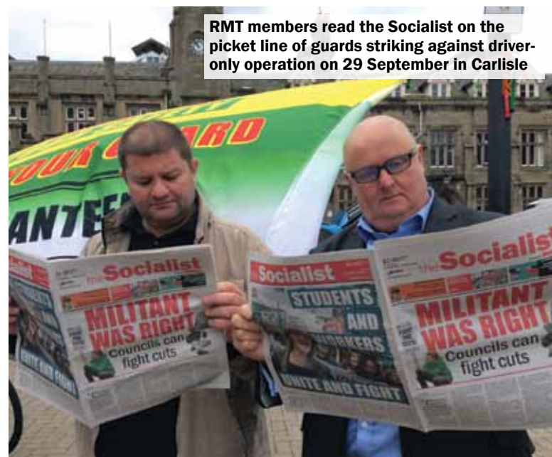
RMT members read the Socialist on the picket line of guards striking against driver-only operation on 29 September in Carlisle

Yes, and it's primarily led by the members. We're telling the leadership that we're not prepared to put up with the conditions that bosses are trying to impose on us and we're in it for the long haul - as the long-running strike on Southern Rail shows. If bosses want a battle on London Underground they will have one.