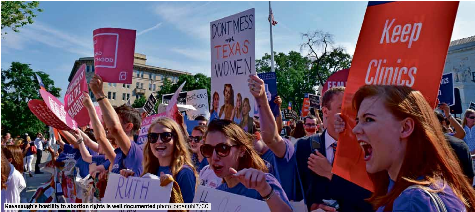
Kavanaugh's hostility to abortion rights is well documented