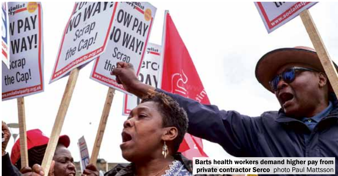
Barts health workers demand higher pay from private contractor Serco