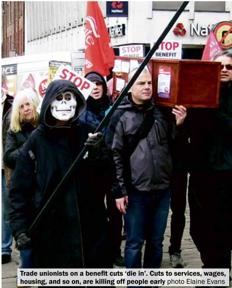
Trade unionists on a benefit cuts 'die in'. Cuts to services, wages, housing, and so on, are killing off people early

The bedroom tax, severe benefit sanctions and flawed fit for work assessments, the discriminatory 'two-child' benefits policy, and the disastrous introduction of universal credit, among other welfare cut-backs, have combined to produce a population struggling to cope and paying the price.