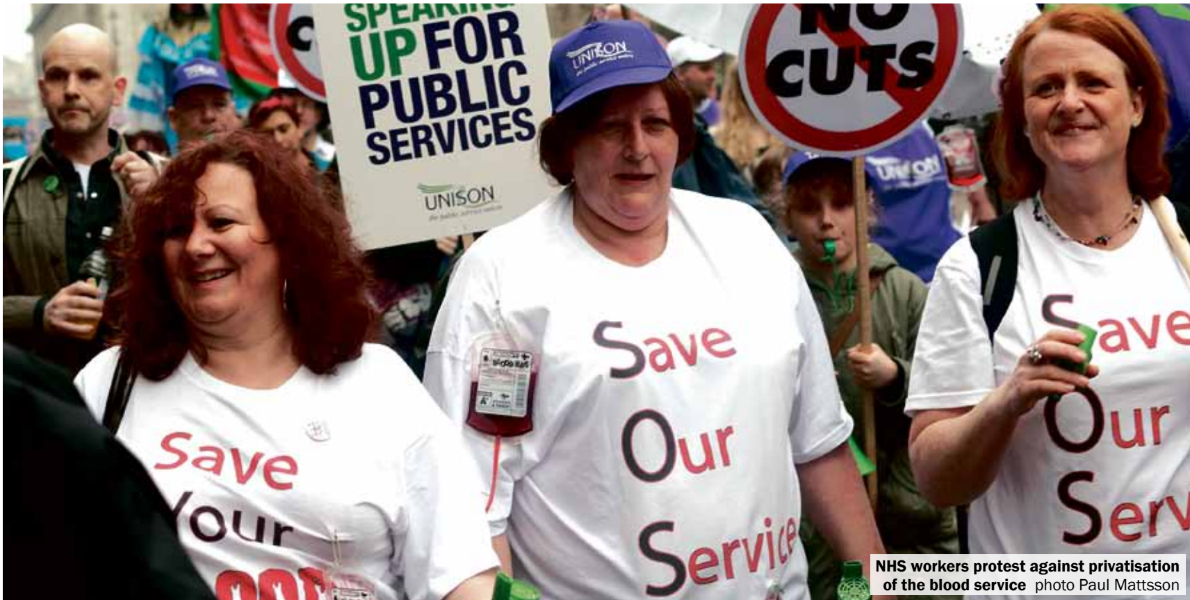
NHS workers protest against privatisation of the blood service

Apparently government papers from the time have been 'lost'. But it has emerged that in 1987 secretary of state John Moore issued a memo to the Tory cabinet on how to get the Thatcher government off the hook. He proposed a £10 million "once-and-for-all payment" to victims, to be administered by the Haemophilia Society. "(This) is particularly attractive," he wrote, "as it minimises government intervention; and it would be consistent with the policy of not accepting any direct responsibility for damage caused in this way."