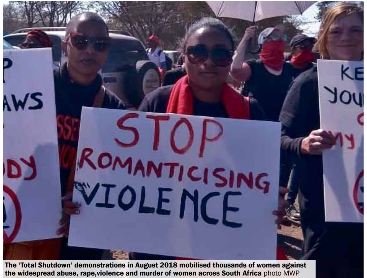
The 'Total Shutdown' demonstrations in August 2018 mobilised thousands of women against the widespread abuse, rape, violence and murder of women across South Africa

At this stage it is the middle class, especially the NGOs, which are setting the ideological tone of the movement against gender-based violence.