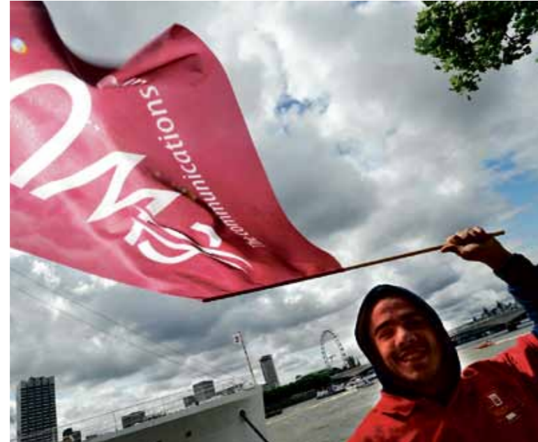
Postal workers are angry over management bullying and the reneging on agreements with their union