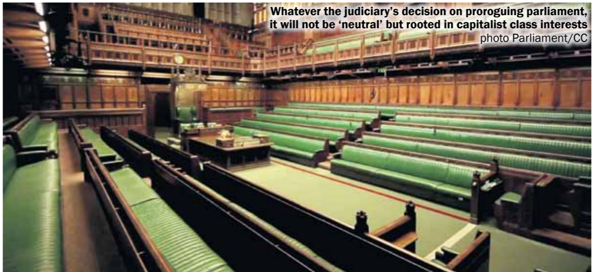
Whatever the judiciary's decision on proroguing parliament, it will not be 'neutral' but rooted in capitalist class interests

Corbyn made a serious mistake in retreating before the pressure of the Blairites in 2016 and going against