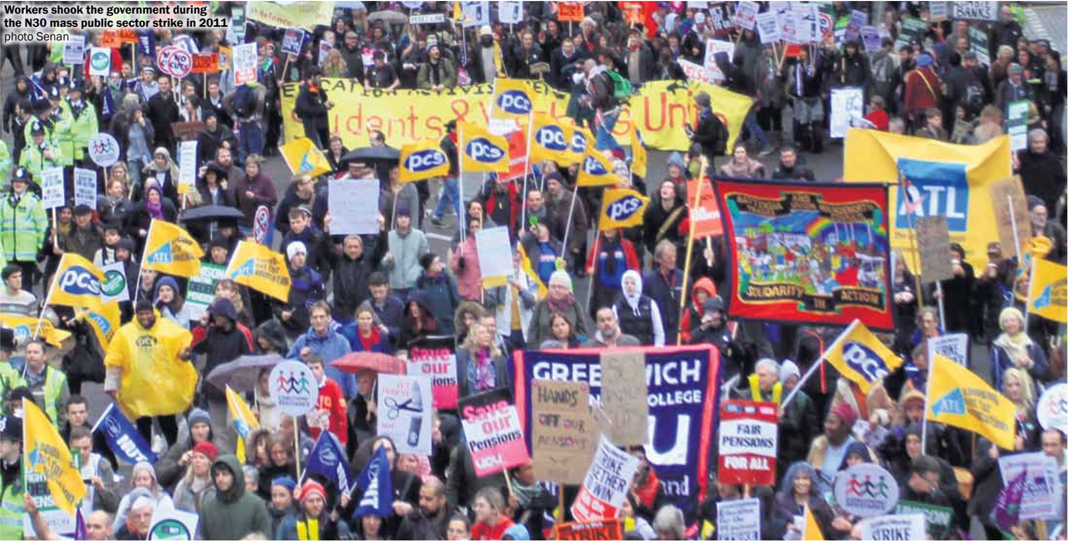
Workers shook the government during the N30 mass public sector strike in 2011

Based on the strength of workers in the 1970s, with nearly 13 million organised in unions compared to 6.2 million today, the gap between rich and poor was its narrowest in modern times. But with the end of the post-war boom, and declining profit rates, the British bosses turned towards Thatcher and her counter-