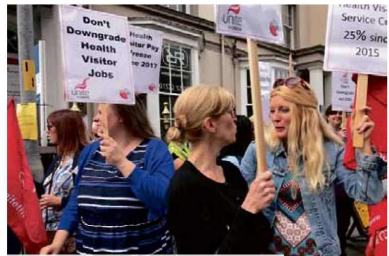
Lincolnshire health visitors in Unite protest against a council imposed pay freeze