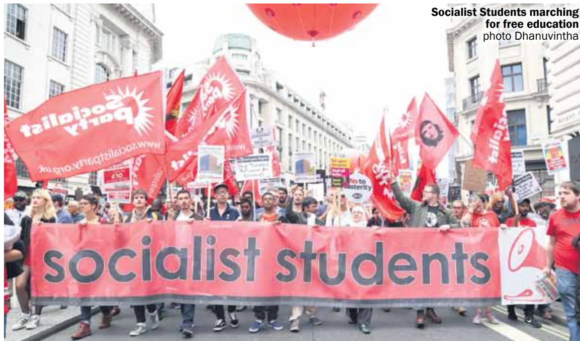
Socialist Students marching for free education

Socialist Students has a proud record of campaigning on the issue of