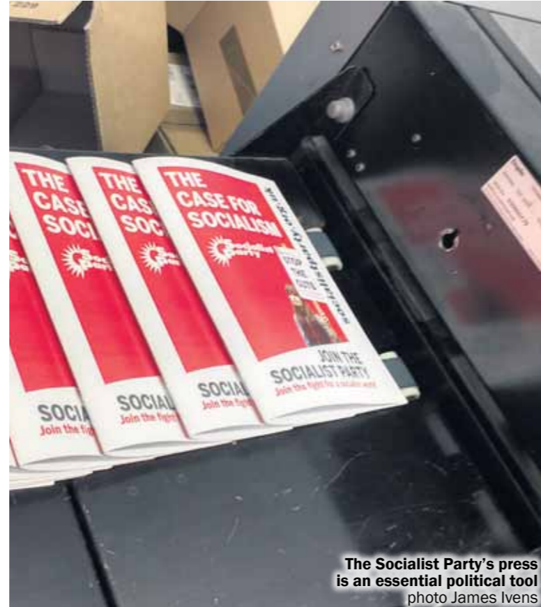
The Socialist Party's press is an essential political tool