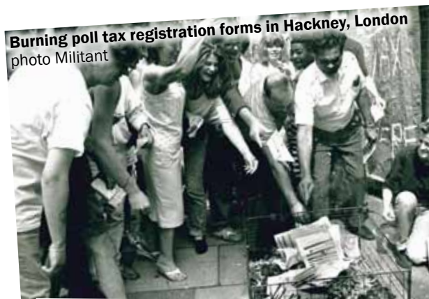
Burning poll tax registration forms in Hackney, London

Available for £5 from leftbooks.co.uk | 020 8988 8789 | PO Box 1398 Enfield EN1 9GT