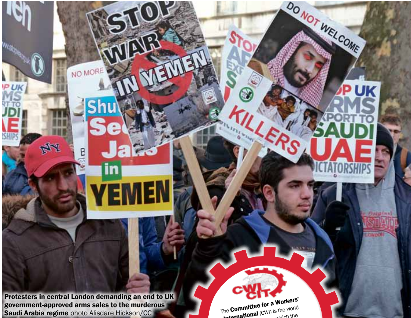
Protesters in central London demanding an end to UK government-approved arms sales to the murderous Saudi Arabia regime

million people, more than half the population, were already living in poverty, it was estimated that the decision to cut fuel subsidies pushed a further 500,000 below the headline.