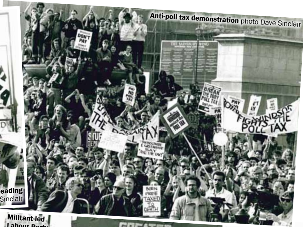
Anti-poll tax demonstration