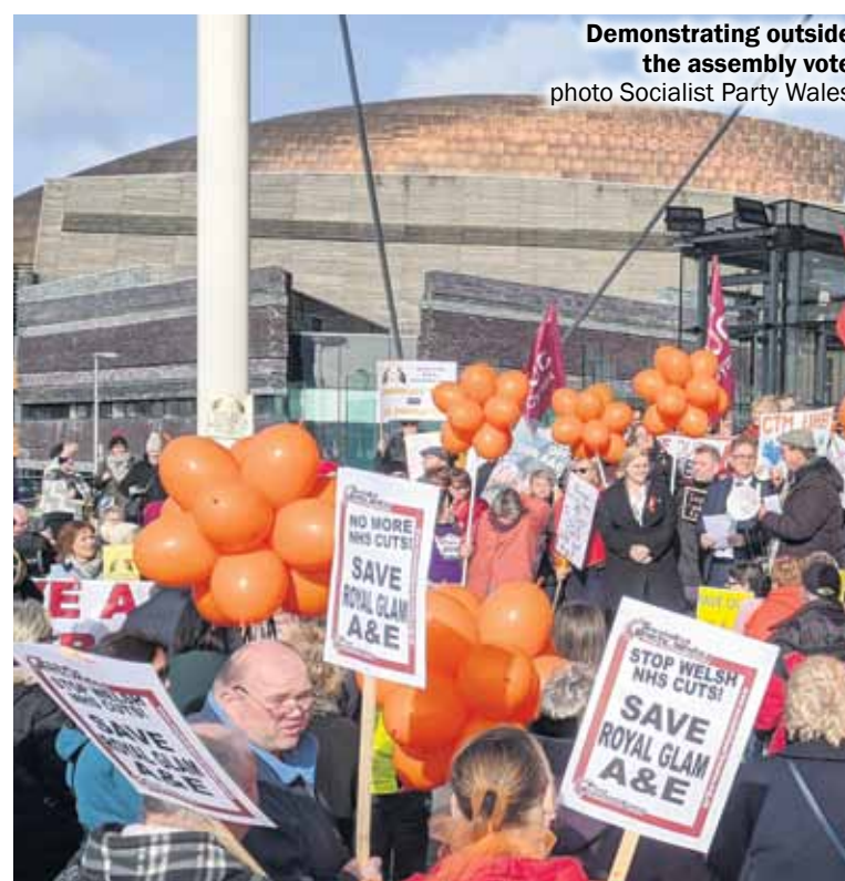
Demonstrating outside the assembly vote photo Socialist Party Wales

The Assembly motion is only advisory and has no binding effect on the health board. But it heaps even greater pressure on the health board executives, who have claimed that there is no option but to close the unit because the sole permanent consultant is retiring in March. A new ad for the post has suddenly appeared.