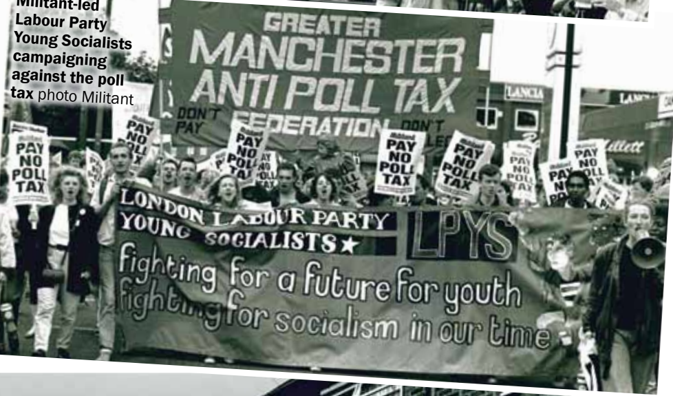
Militant-led Labour Party Young Socialists campaigning against the poll tax