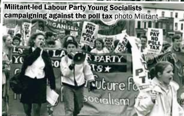
Militant-led Labour Party Young Socialists campaigning against the poll tax