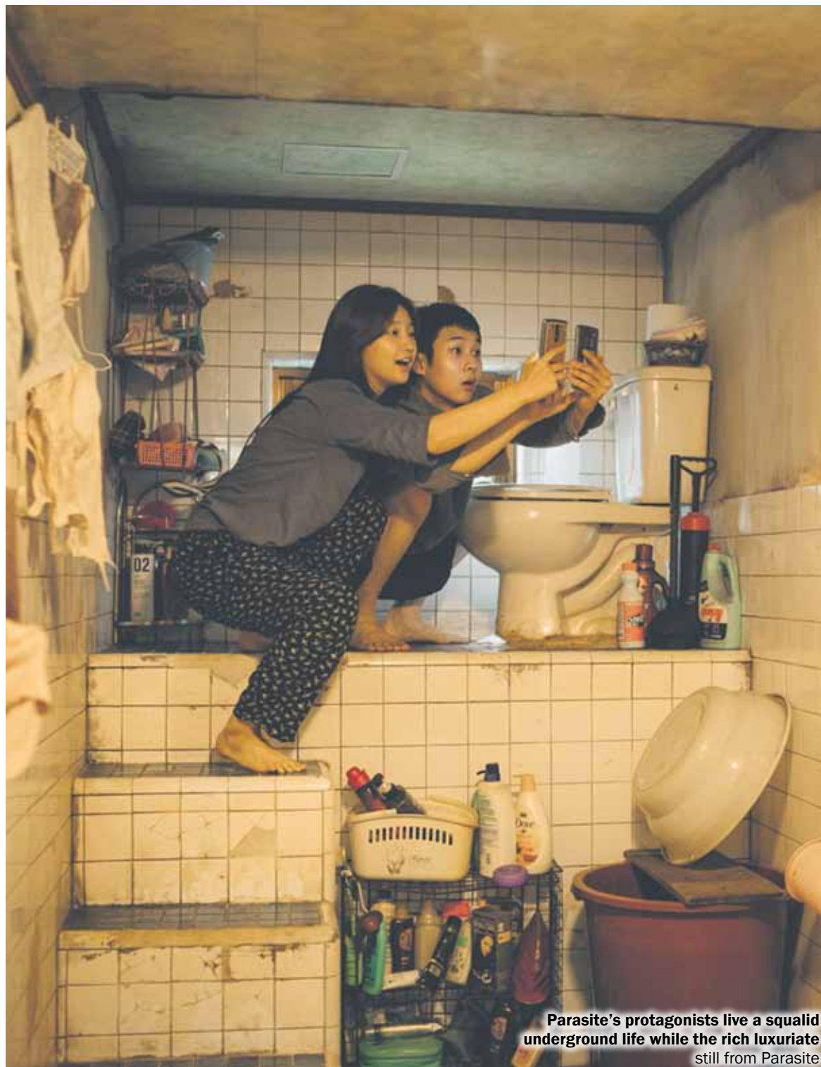
Parasite's protagonists live a squalid underground life while the rich luxuriate still from Parasite

As the black clouds gather, the Parks start noticing that the Kims smell the same - like a "damp rag" - and this becomes a symbol of the class difference between them.