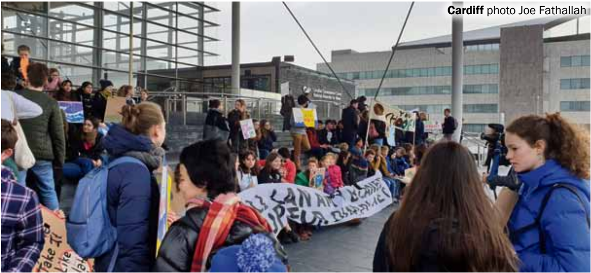
Cardiff