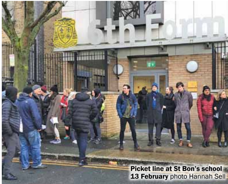
Picket line at St Bon's school 13 February

Education workers in Newham have escalated their strike action. Workers at St Michael's and St Bon's Catholic schools want to halt plans for academy privatisation. National Education Union members from both schools went to picket St Bon's on 13 February.