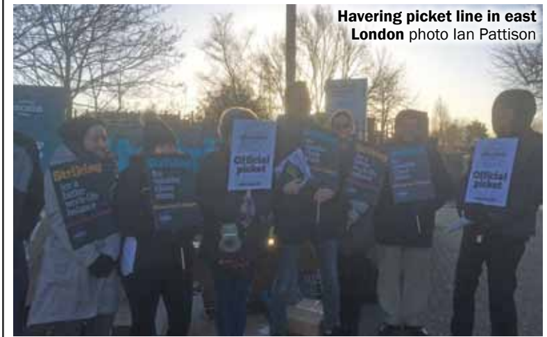
Havering picket line in east London

Ian Pattison East London Socialist Party