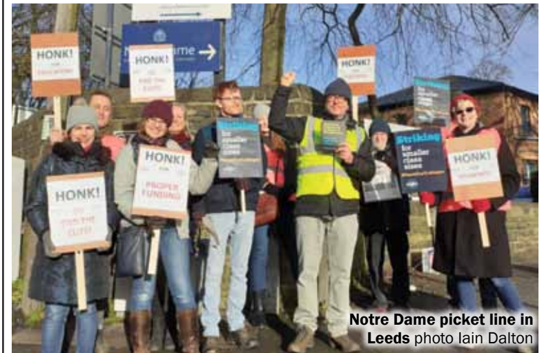
Notre Dame picket line in Leeds