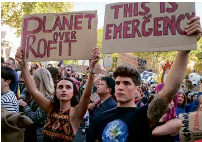
Student climate change strike 2019

The billionaire-owned UK newspapers, along with Prime Minister Boris Johnson, decried the blockade by Extinction Rebellion (XR) environmental activists outside a number of printing presses last weekend. The action delayed printing and distribution of the climate-change-sceptic Telegraph, the Murdoch-owned