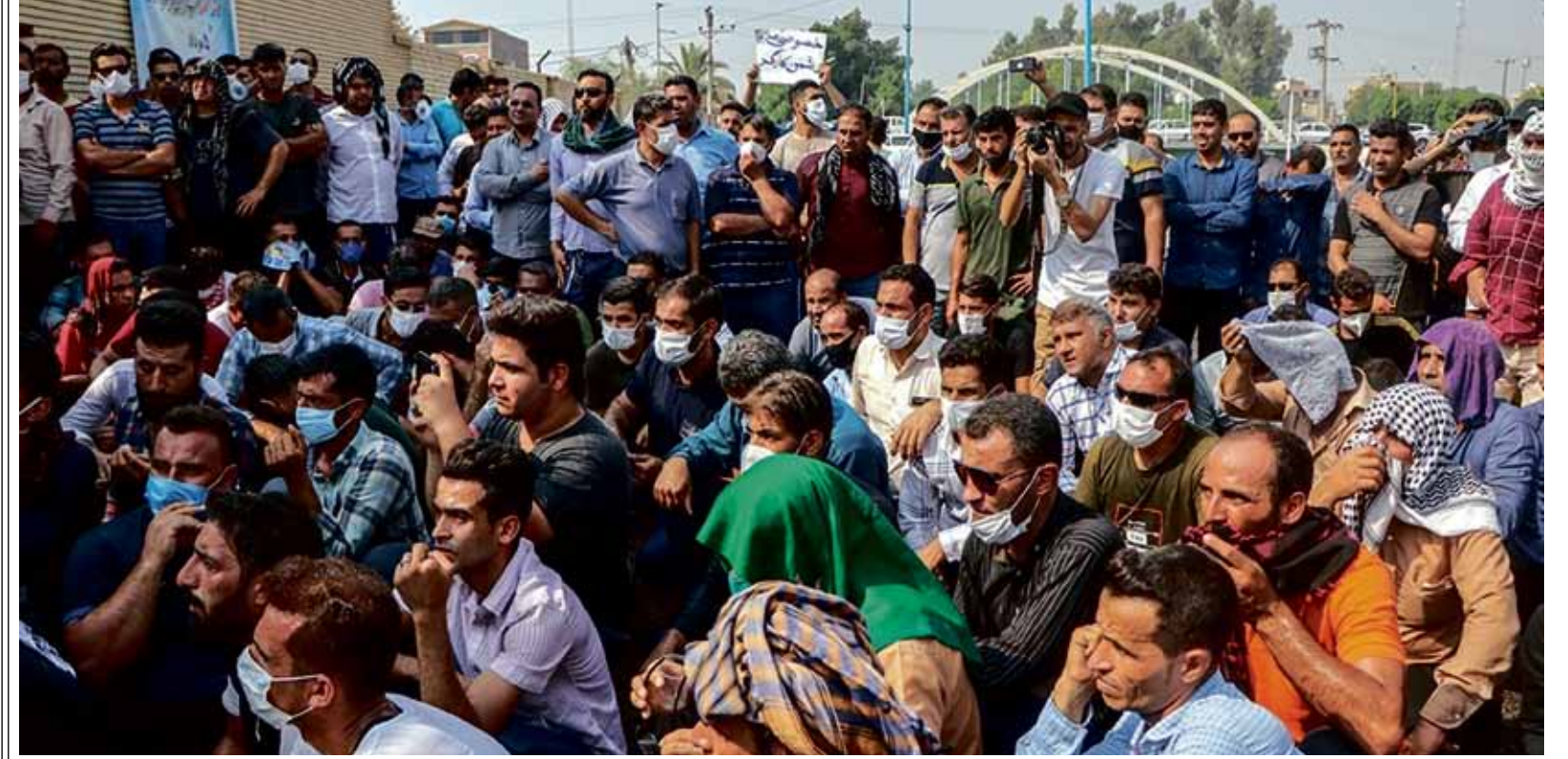
Striking Haft Tappeh sugar cane workers on 2 August