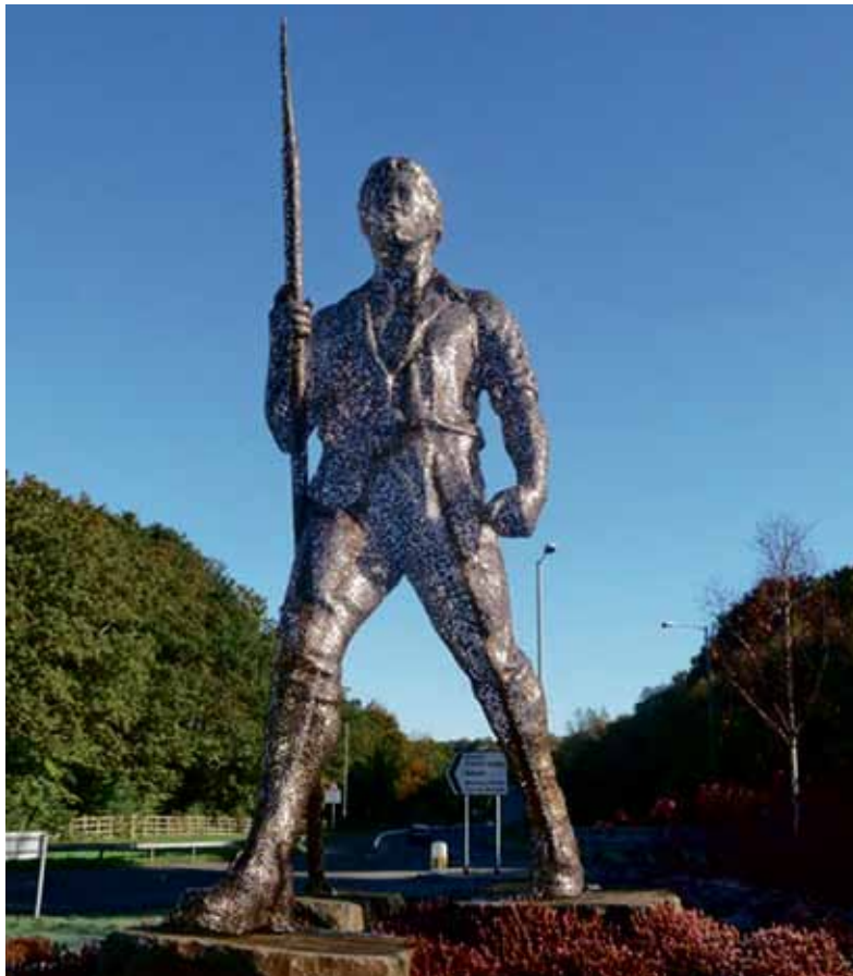
Chartist statue, Blackwood, Caerphilly

Campaign group 'Parents For Safety First' had called for Welsh education minister Kirsty Williams to pause the schools reopening as cases were increasing, but the schools