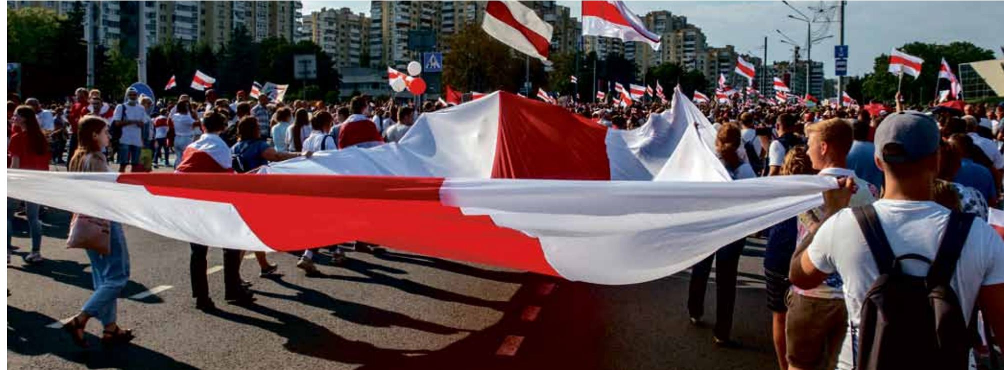
Anti-Lukashenko protesters marching in the capital Minsk to denounce the fraudulent 9 August election

CLARE DOYLE COMMITTEE FOR A WORKERS' INTERNATIONAL (CWI)