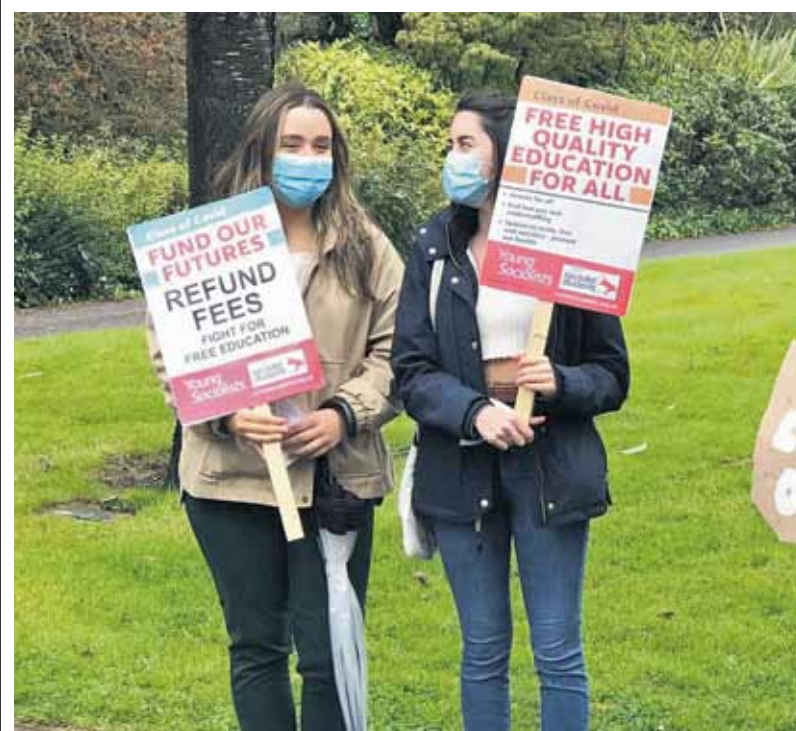
Protesting in Cardiff 4 October