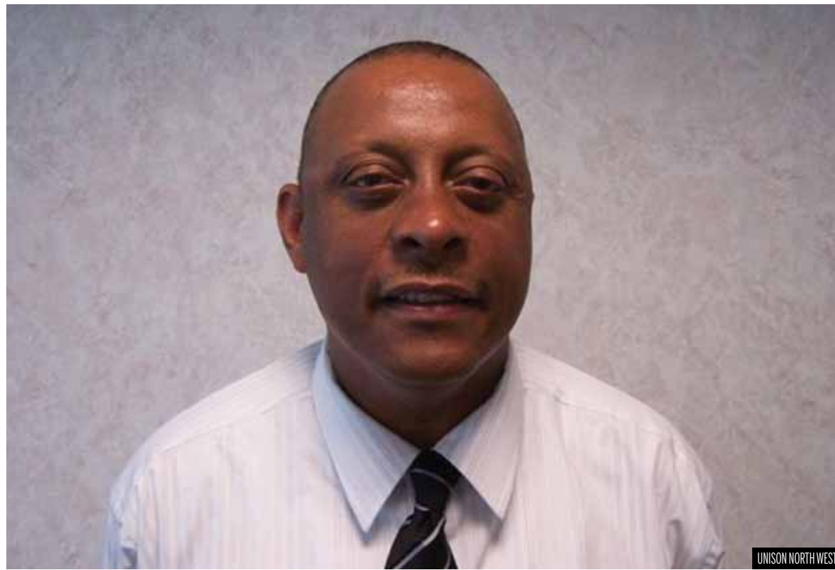
UNISON NORTH WEST