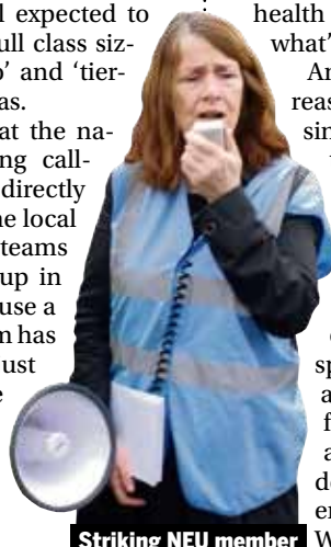
Striking NEU member

School staff and parents fear the worst. Public Health England figures show that the highest test-positivity rates are now in the 10-19 age group, but schools are still expected to remain open with full class sizes, even in 'tier-two' and 'tier-three' lockdown areas. Now we learn that the national contact-tracing callers are no longer directly reporting cases to the local health protection teams who do the follow-up in schools.