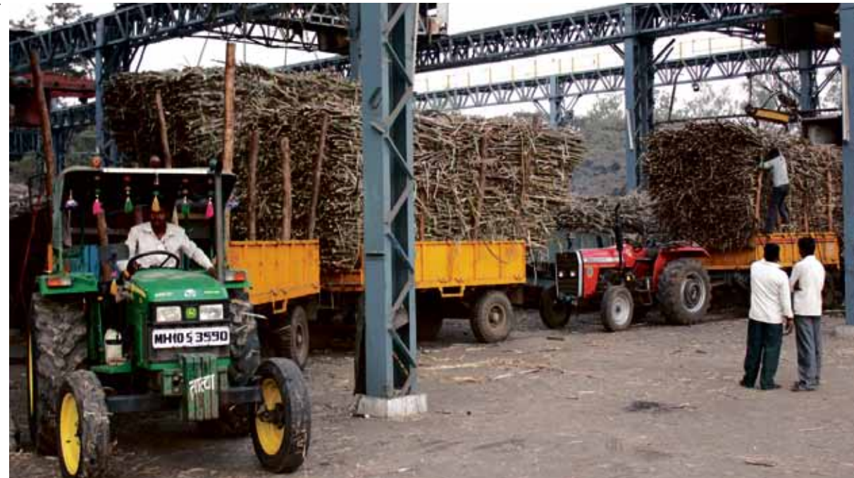
Co-op sugar mill at Maharashtra, India

Thompson argued for democratically organised and run communities, suited to the limited resources of the largely working-class cooperative movement, and for workers eventually