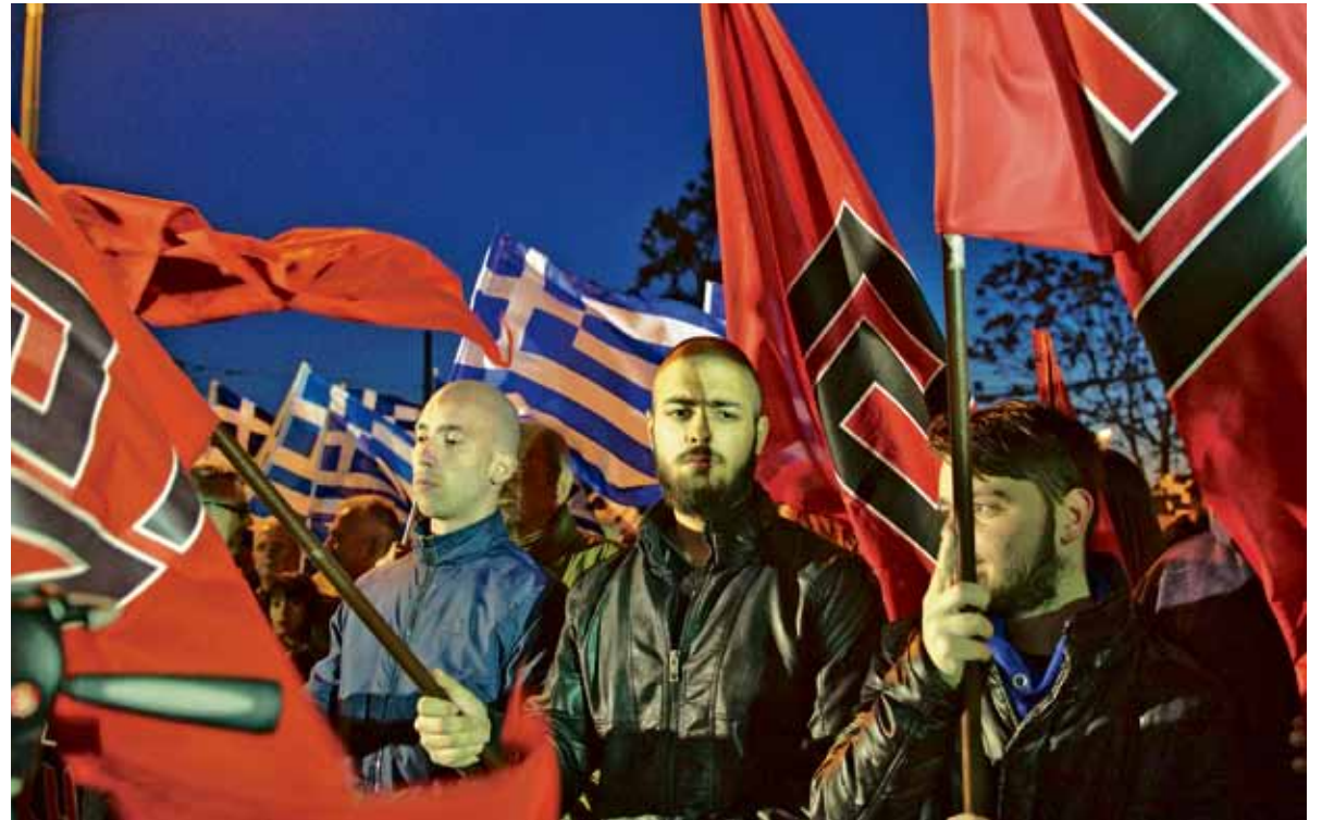
Golden Dawn fascists displaying swastika-like flags

Scandalously, Syriza ignored the results of the referendum and entered an agreement with even harsher austerity than had been previously discussed! This represented another betrayal of the working class, and