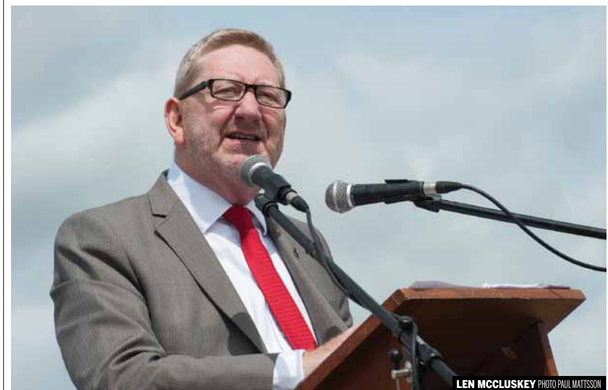
LEN MCCLUSKEY

Unite the union's executive council has voted to cut its affiliation fee to the Starmer-led Labour Party by 10% - the equivalent of 55,000 affiliated members. It is reported that the BFAWU bakers' union is also considering such a move. This represents an important step in how Unite and the wider trade union movement is reacting to the defeat of Corbynism in Labour. But it should also be the starting point of a necessary broader debate about how workers are politically represented in this crisis-torn period, when Starmer's victory is more and more blocking off political channels.