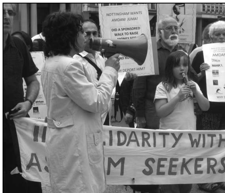
Campaigning in Nottingham.

Failed asylum seekers are generally eligible for Section 4 support if they are destitute. However parliament's Joint Committee on