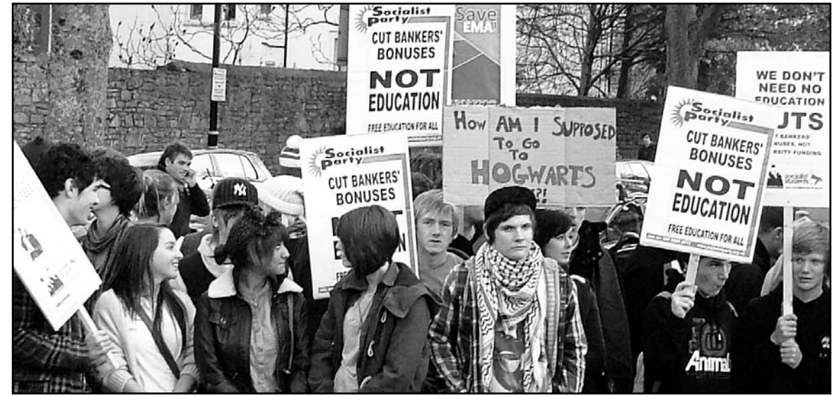
A recent demonstration against education cuts in Cardiff.