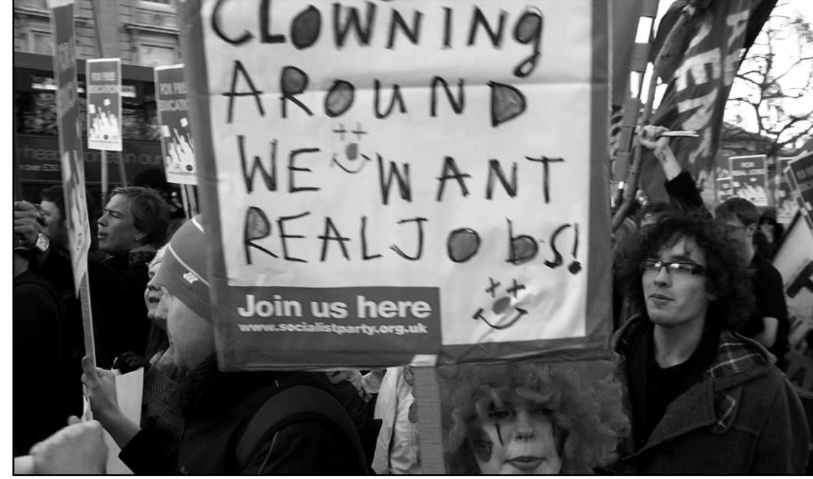
YFJ demands the right to a decent job with decent conditions for all.

See page 12 for more details on 29 January.