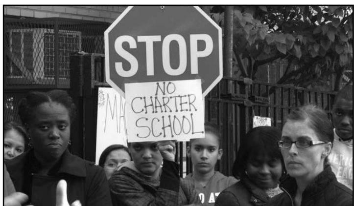
Charter schools are being opposed in many areas.