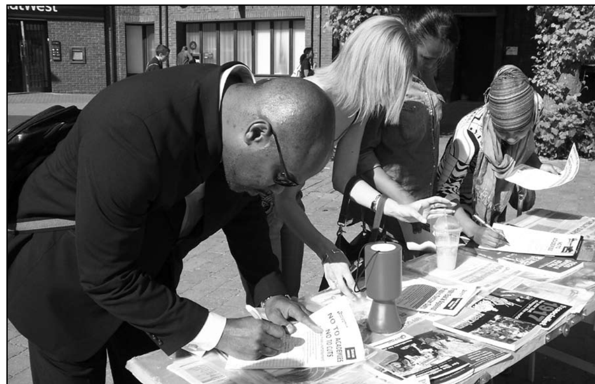
Workers can see how academies undermine education.