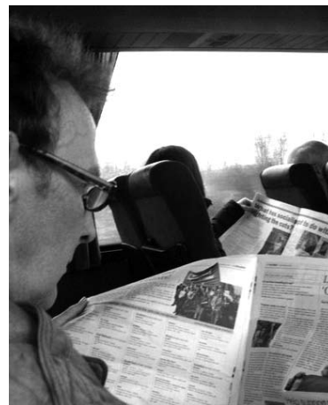
What a good read!

get in touch to check their branch targets, request extra collector's cards or a copy of the Socialist's pamphlet, It's Your Paper - Getting the Socialist's Message Across, which includes lots of ideas to help increase sales.