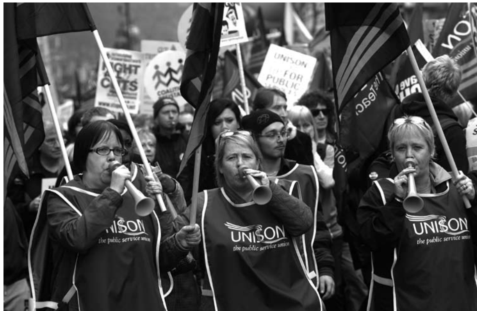
Over 500,000 people took part in the 26 March anti-cuts demo

A South East anti-cuts day school, hosted by Brighton Stop the Cuts Coalition, took place on 9 April. Workshops were on council and education cuts, the economics of the crisis,