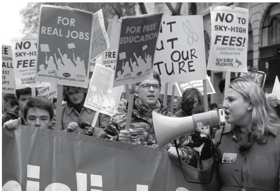
The report shows contempt for the unemployed, even though there are almost no jobs available

So for the remaining 960,000 unemployed youth, the government is proposing they work for free. This is a huge attack, primarily on those who are unemployed, but