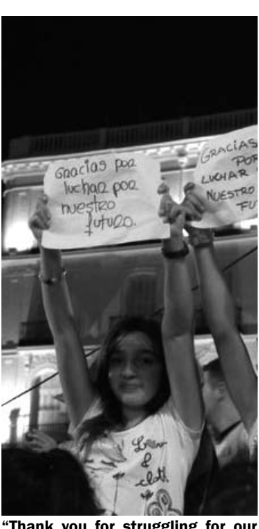
"Thank you for struggling for our

While most seem to think that there is no way to have a party that represents the masses, a few protesters correctly pointed out that one step forward would be for the movement to stand its own candidates in the elections next time.