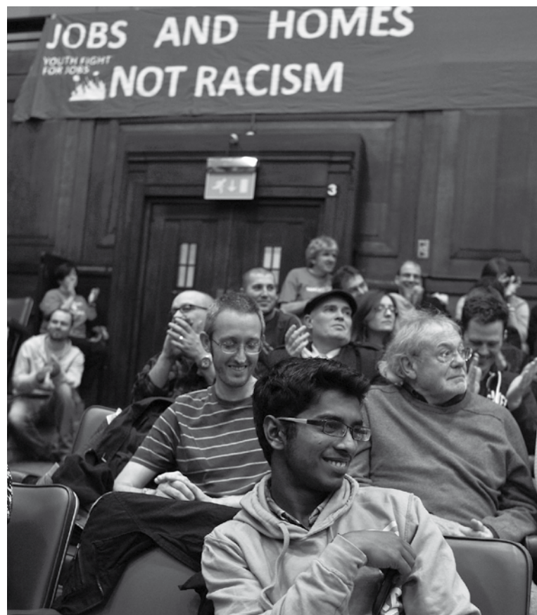
At Socialism 2010

We have just sold a ticket to someone who has been travelling the world for three years. Now he's back and commencing a teacher training course. He came to Socialism in 2005 and thought it was brilliant. When he received a letter about the event he wrote back immediately and said he was up for it and could think of no better way of becoming involved again. He'll be one of hundreds.