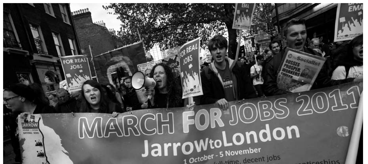
Youth Fight for Jobs on the march

Jarrow marchers and Socialist Students members to stop the demonstration and demand the release of the kettled workers were taken up.