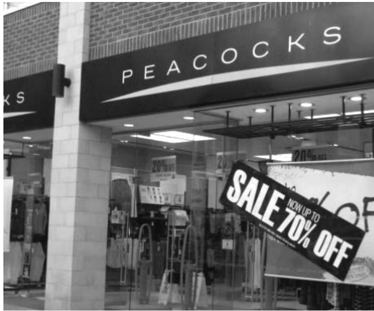
249 workers have been sacked from Peacocks' Cardiff head office

"Yet the details are difficult to confirm, partly because a holding