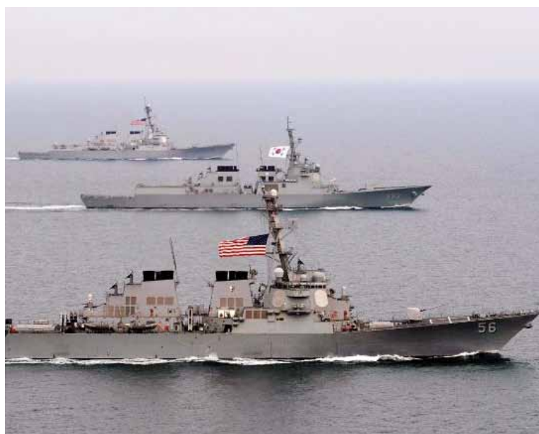
US-South Korea war games adding to the tensions