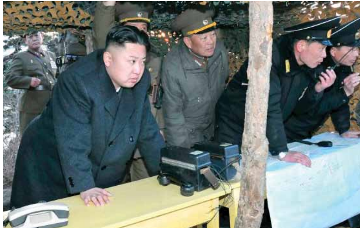
North Korea's leader Kim Jong-un at a military command post