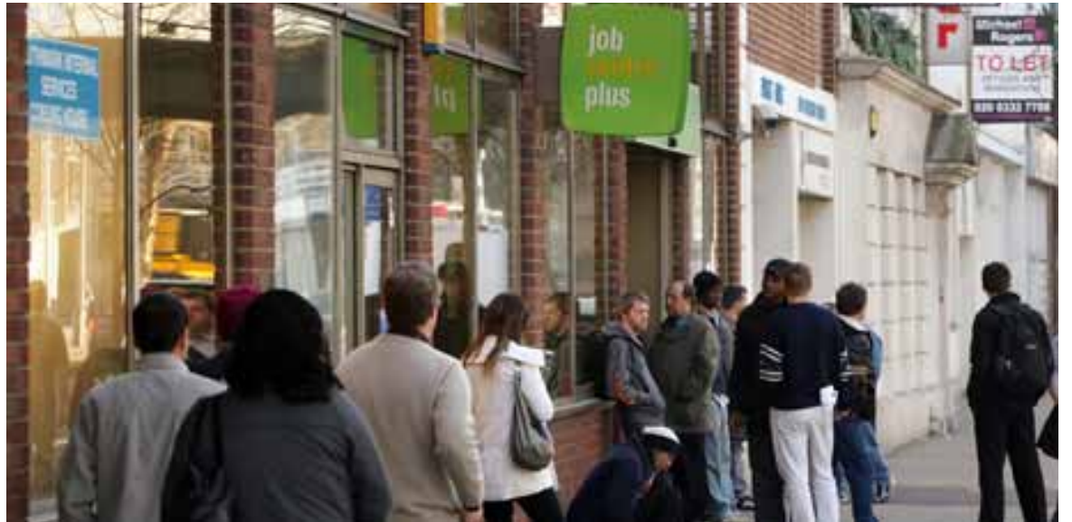
Many people seek advice after being thrown off Employment Support Allowance and Jobseeker's Allowance

Overwhelmingly, the problems faced by the people coming to the agency where I work are those of being thrown off Employment Sup-