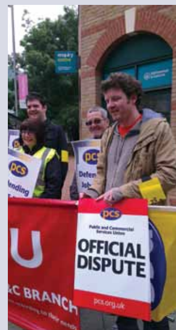
An HMRC picket line

This is the fourth strike that has taken place in Leeds in just over a week. This and the discussions at the TUC general council on 24 April about examining the possibility of calling a general strike were discussed. All the pickets we spoke to expressed their wish that such strike action should be coordinated if possible, as the National Shop Stewards Network has argued.