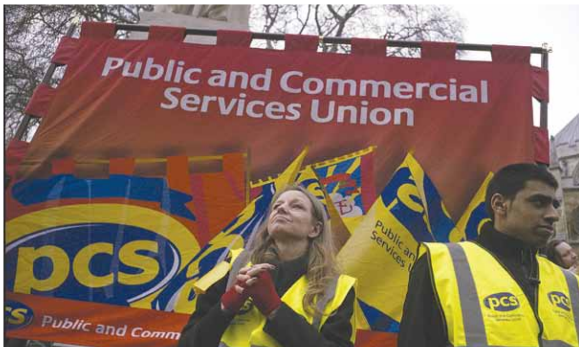
At the 20 March rally in London