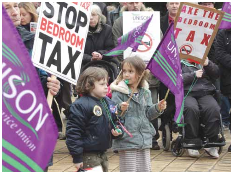
40% of affected households include children. 63% include disabled people

Come to a local meeting where we can discuss how to stop the bedroom tax: www.socialistparty.org.uk/whatson 020 8988 8777