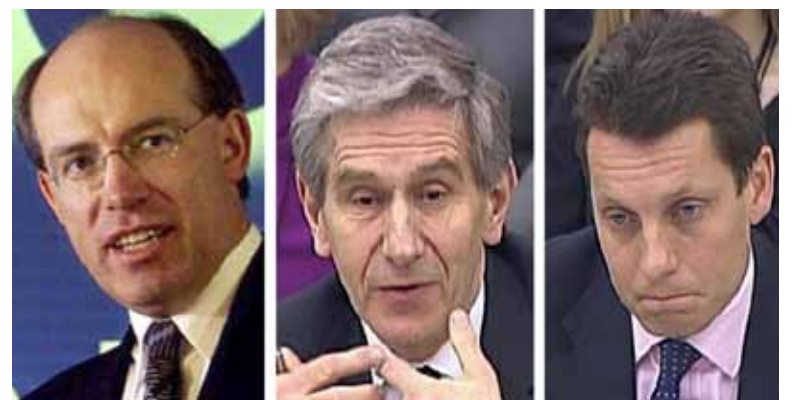
The HBOS three were criticised for "sowing the seeds of destruction"