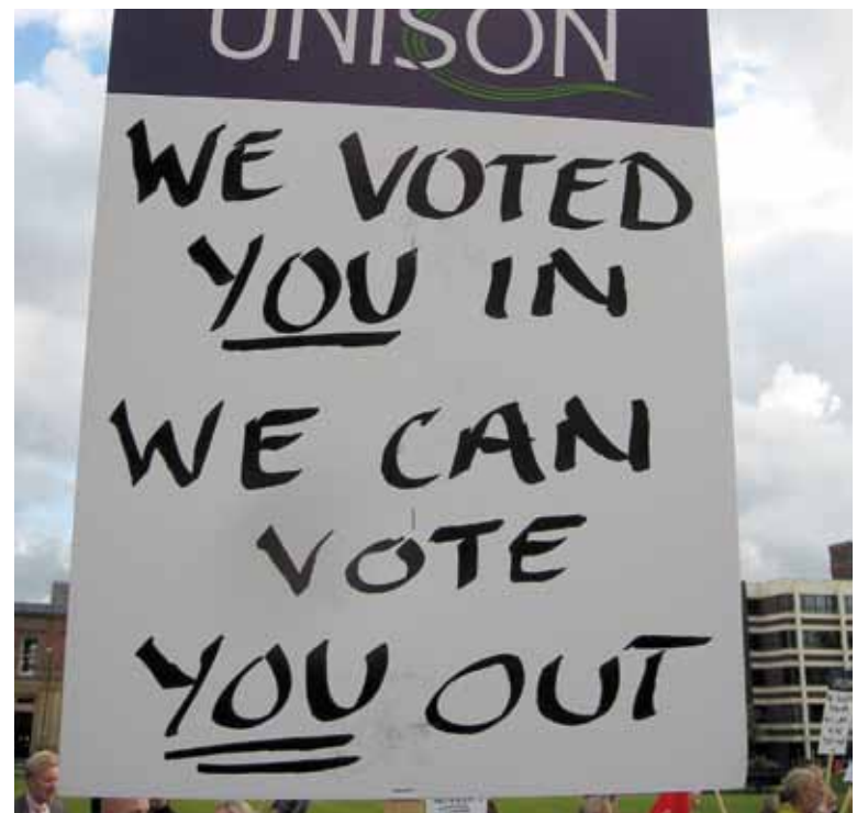
Making an important point to Warrington councillors

However, by knocking back the attempts to worsen terms and conditions, the workforce has made itself less attractive to would-be private contractors who are circling round the authority like vultures.