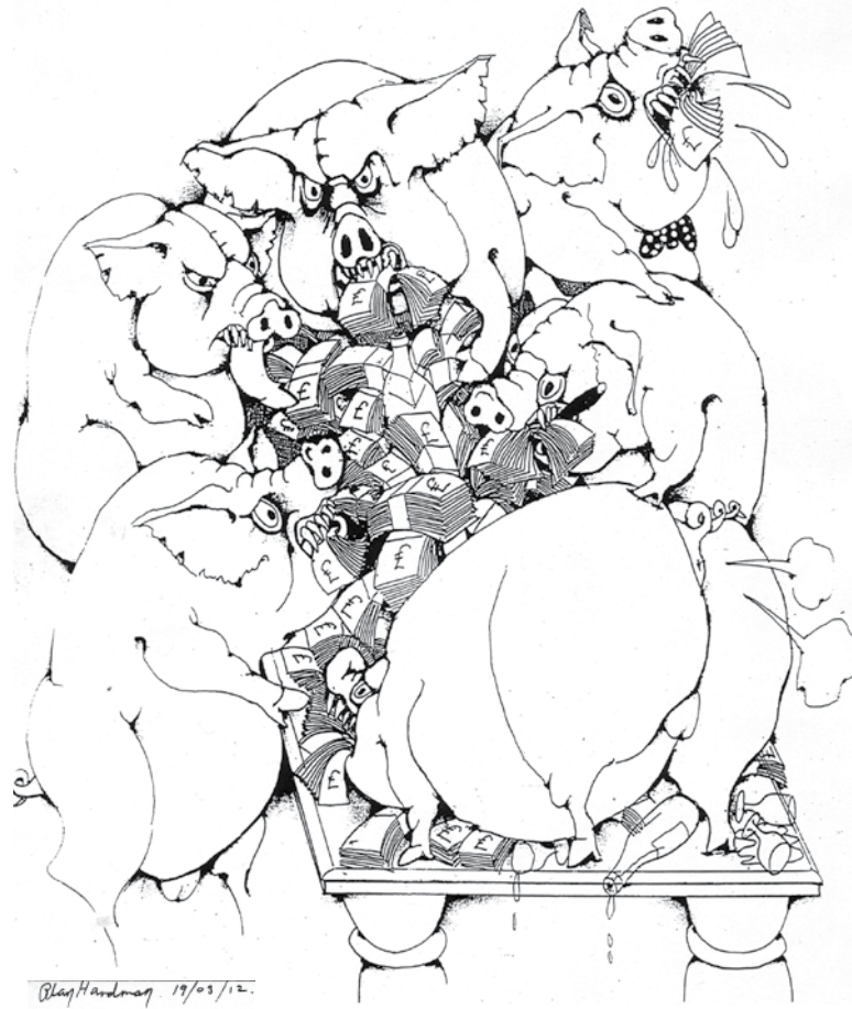
Olaf Handberg 19/03/12

All the main parties have members' slathering spouses and kids with £25 to £50 grand. Many are