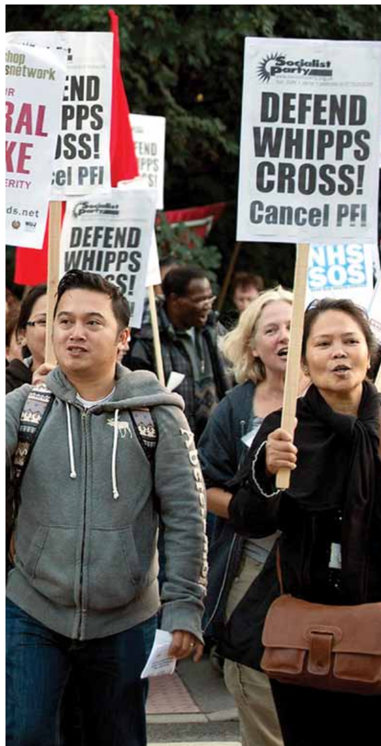
Fighting the cuts at Whipps Cross Hospital

If you want to save the NHS then join us on these protests (see demo details below).