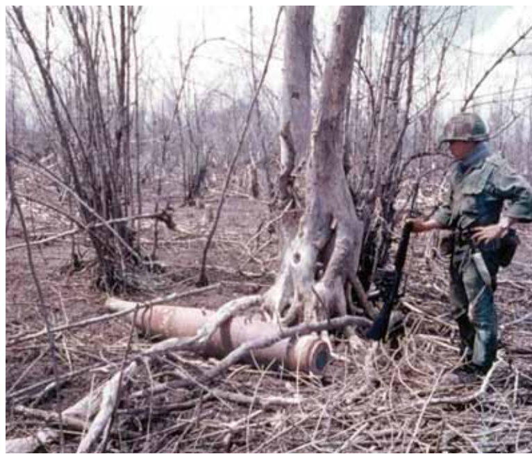
A defoliated area in Vietnam

And how did so many children get to be like this? According to the Vietnamese authorities there are still around 150,000 children in this predicament - and all due to Agent Orange. This was the chemical weapon dioxin - one of the most deadly chemicals known to science - dropped from aeroplanes by US troops 40 years ago over Vietnam's countryside.