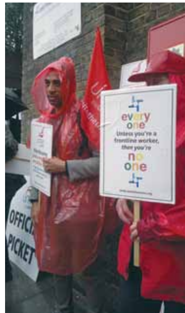
On the picket line during the last strike photo the Socialist

The group continues to make some of the healthiest surpluses in the sector and the chief executive