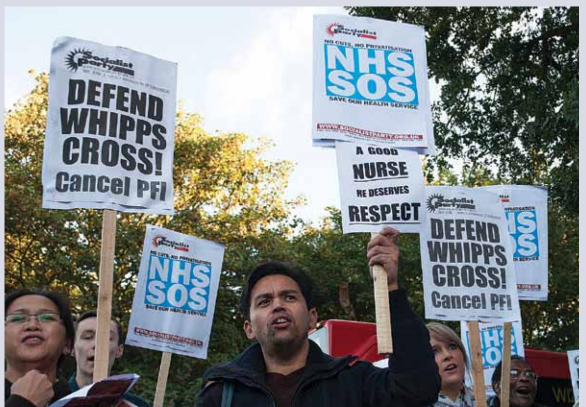
The hospital workforce has a central role to play in the fight to defend the NHS

On 21 September there is a demonstration through the borough. Workers have been taking leaflets for the last few weeks to help build this demo, and went away yesterday armed with the last batch, determined to make it a great success.