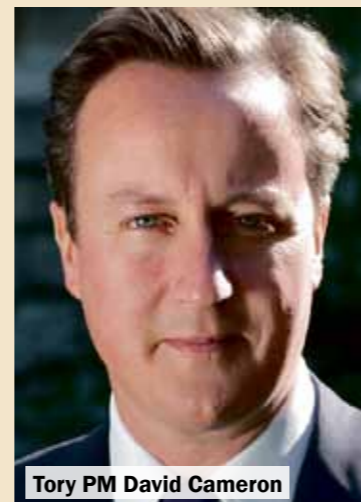
Tory PM David Cameron

Cameron would certainly like to forget having to repay the £680 claimed to remove wisteria from his Oxfordshire mansion (but not repaying the £20,000 a year claimed to pay the mortgage on