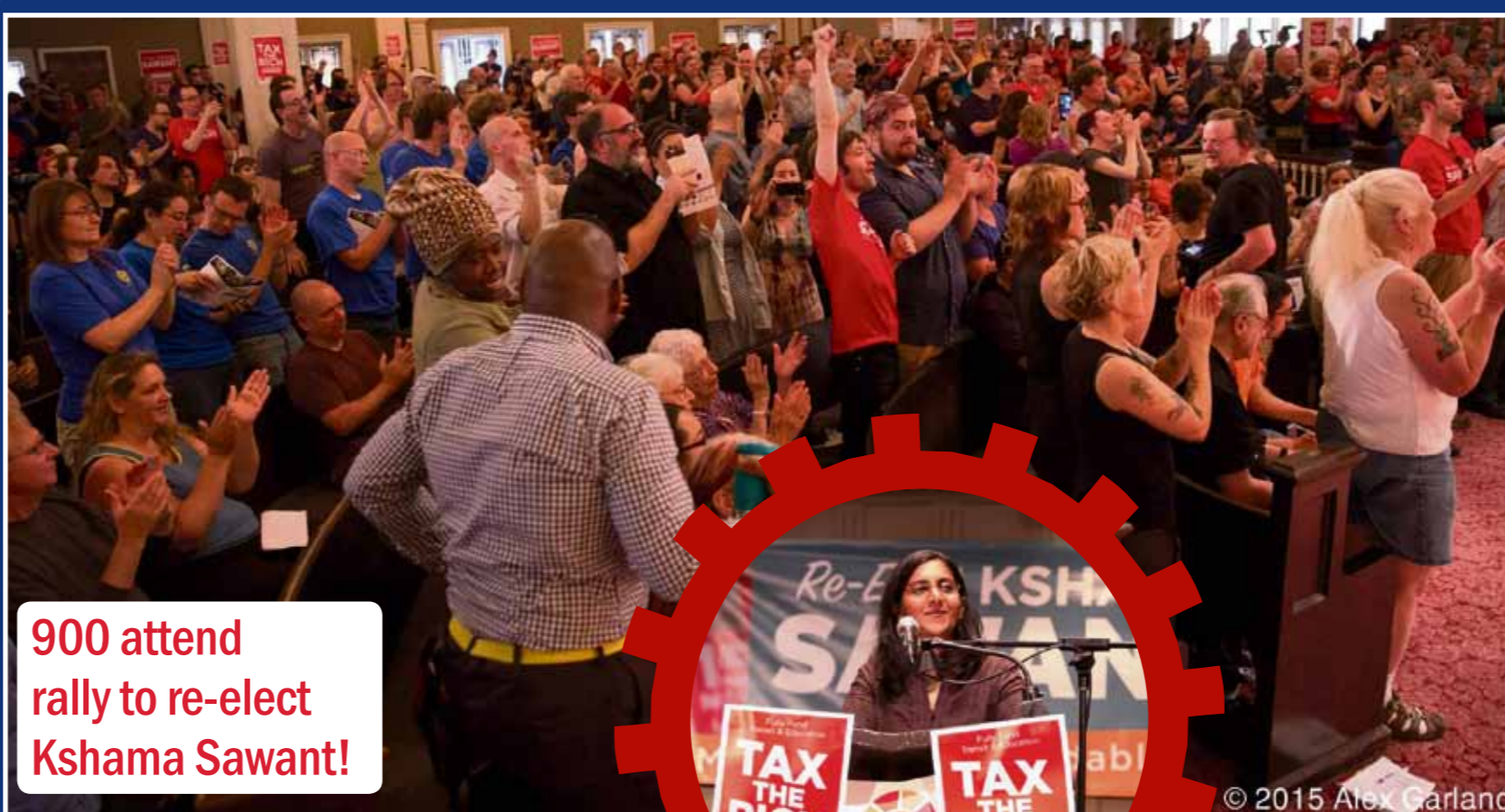
900 attend rally to re-elect Kshama Sawant!

Grexit would see an end to externally-imposed austerity and allow the Greek government to devalue and write off a large chunk of its debt. Exports would be cheaper. But imports would cost more, and this would have a negative effect on personal savings and living conditions.