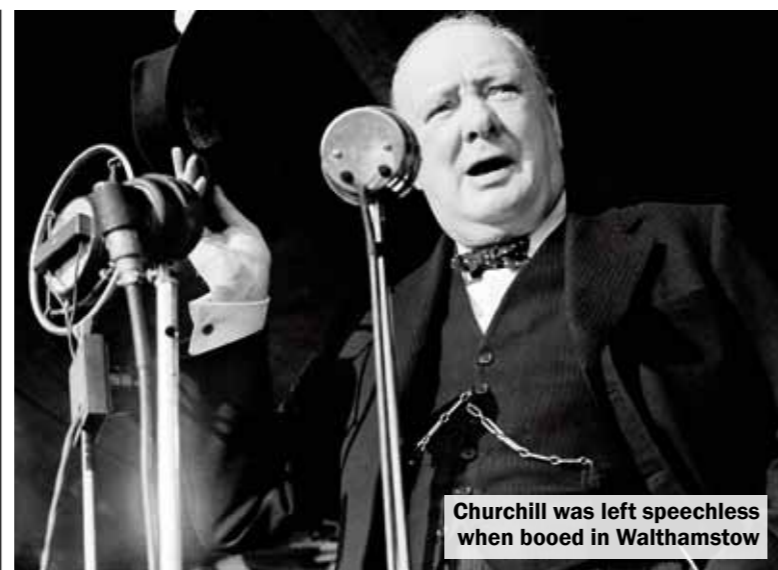
Churchill was left speechless when booed in Walthamstow

How did Churchill become 'the great war leader'? By doing all the 'right things,' for all the wrong reasons