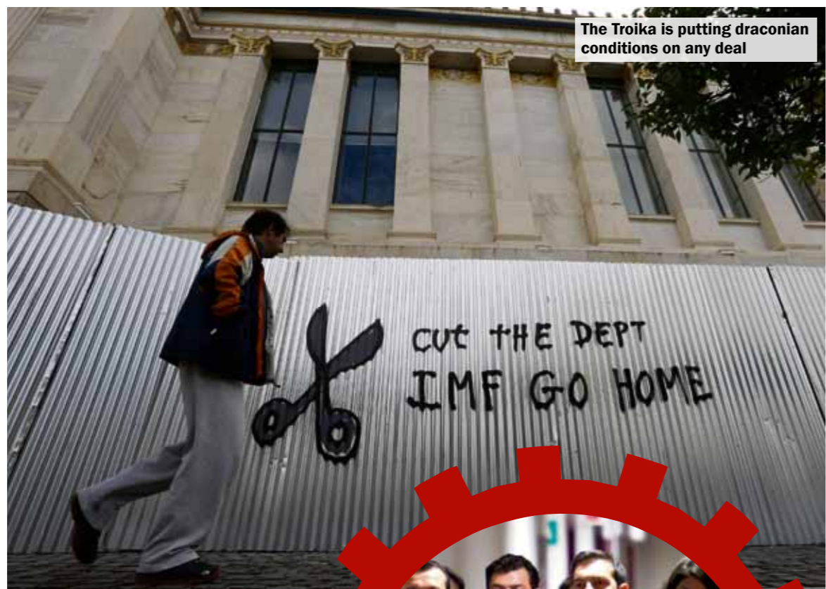
The Troika is putting draconian conditions on any deal

Yet the deluded neo-liberal ideologues at the EU institutions insist the Greek economy can grow by almost 3.5% on average in each of the next five years, bringing the debt ra-