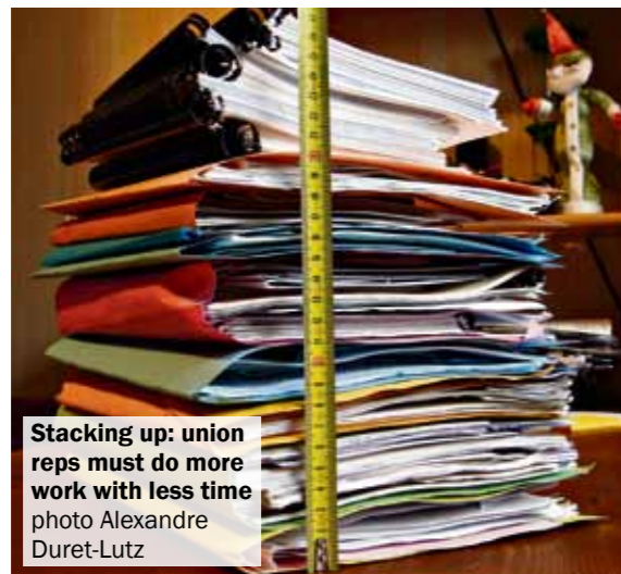
Stacking up: union reps must do more work with less time

A Tory council in south London has withdrawn vital time for staff representatives to do trade union work. Meanwhile, it is preparing to demolish council services. The timing is no coincidence.