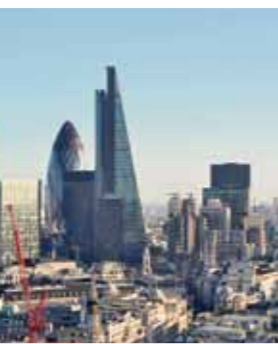
The financial power of the City of London is one of the severe roadblocks faced by Cameron

Only the working class can really unify Europe through democratic socialism