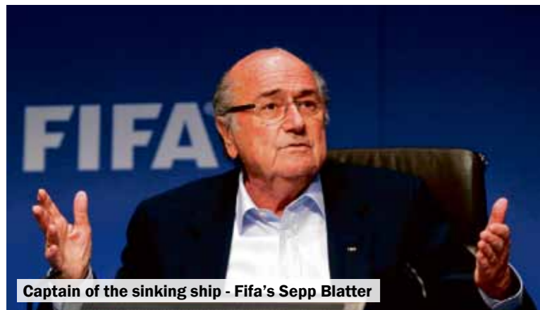
Captain of the sinking ship - Fifa's Sepp Blatter