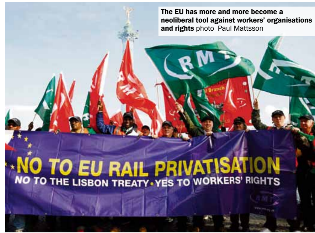
The EU has more and more become a neoliberal tool against workers' organisations and rights

“The brutal oppression of the Greek, Spanish, Irish, Italian and Portuguese workers, through the 'Troika' and the EU in general, is entirely lost on the tops of the trade unions”