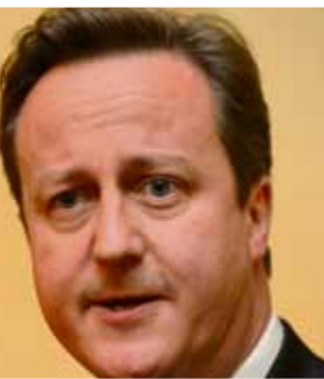
Cameron's attempts to negotiate special treatment within the EU have met a lukewarm reception

At the same time, if the workers' movement was taking on and defeat-