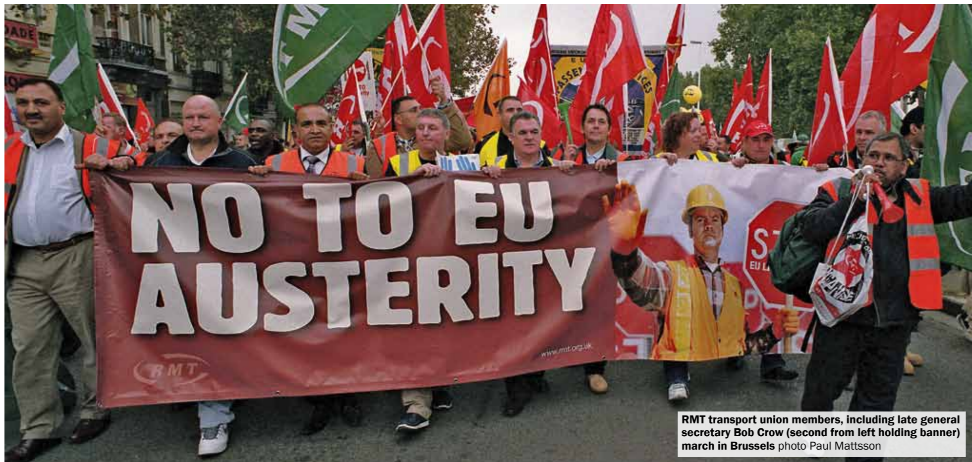
RMT transport union members, including late general secretary Bob Crow (second from left holding banner) march in Brussels