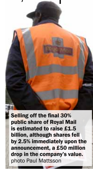
Selling off the final 30% public share of Royal Mail is estimated to raise £1.5 billion, although shares fell by 2.5% immediately upon the announcement, a £50 million drop in the company's value.

Ironically, during his recent sell-off announcement Osborne said: