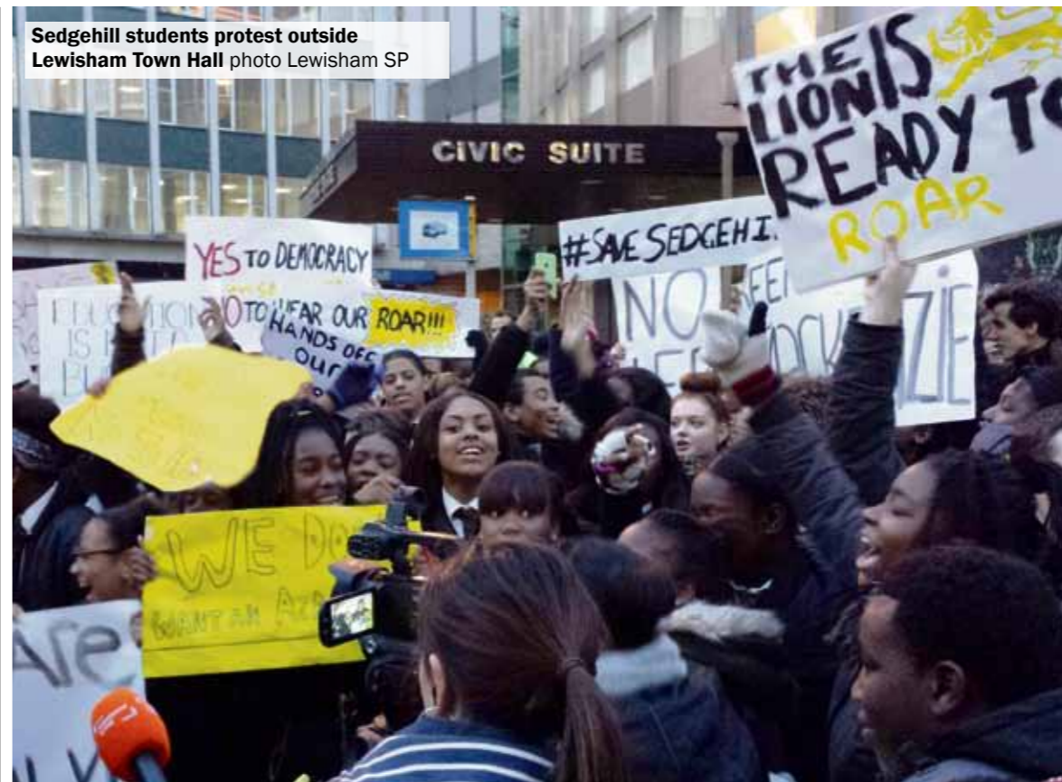
Sedgehill students protest outside Lewisham Town Hall

We approached the NUT nationally to seek support for a strike ballot. The NUT's National Action Officers were supportive, seeing the threat of a change in employer to an academy trust as constituting a legal trade dispute. Until and unless that threat was lifted, we would take action to oppose it.