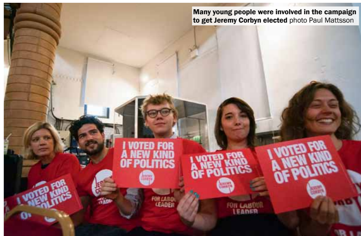
Many young people were involved in the campaign to get Jeremy Corbyn elected