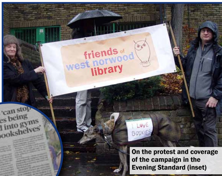
On the protest and coverage of the campaign in the Evening Standard (inset)

There was a real understanding among protestors that councillors have other options, particularly given that they are spending £50 million on an unnecessary new town hall and tens of millions a year on agency staff.