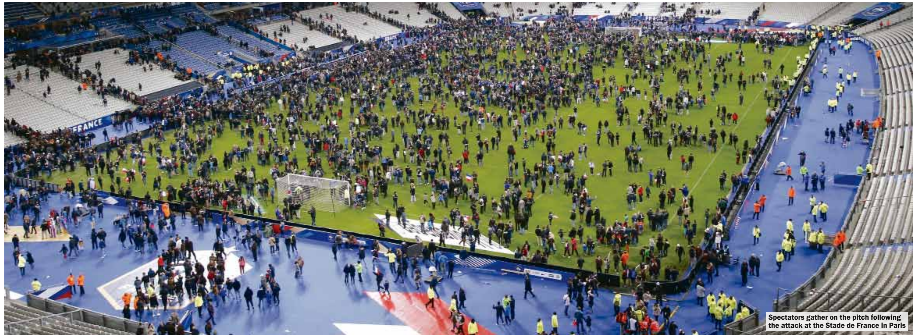
Spectators gather on the pitch following the attack at the Stade de France in Paris

However, he authorised assassination by drone in September of two British jihadists in Syria and now the Paris attacks could be used to try to whip up support for further incursions.