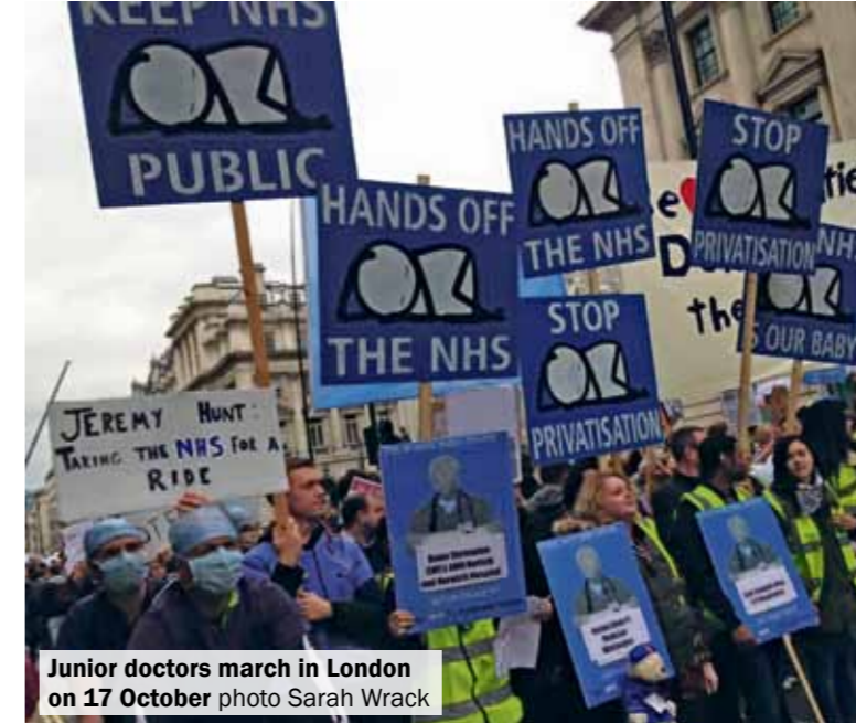
Junior doctors march in London on 17 October

Hunt has called the doctors' plan "extreme". He is the extremist, want-