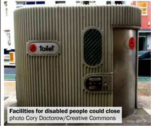
Facilities for disabled people could close