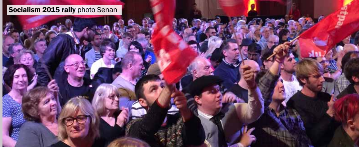
Socialism 2015 rally

In 1995 Tony Blair was elected Labour leader. I admit, I fell for it. He inspired me, so I joined the Labour Party. They were the party of the working class, of the common man