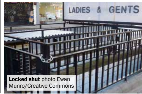
Locked shut