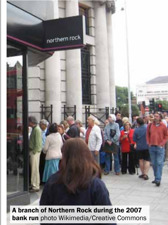
A branch of Northern Rock during the 2007 bank run