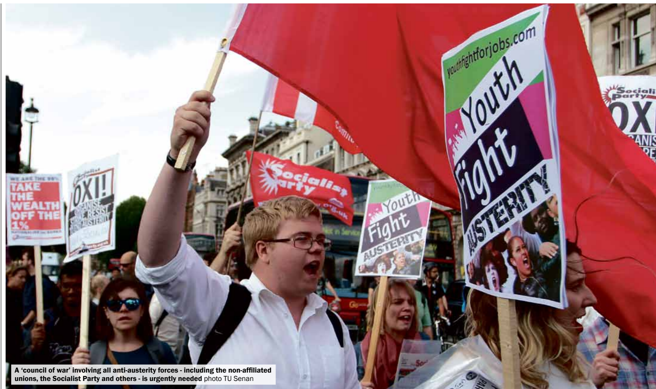
A 'council of war' involving all anti-austerity forces - including the non-affiliated unions, the Socialist Party and others - is urgently needed

To say, as Jeremy did, for example, that he was making it 'crystal-clear' he opposed mandatory reselection of MPs was a mistake. It emboldened the right and can potentially disarm the hundreds of thousands of workers and young