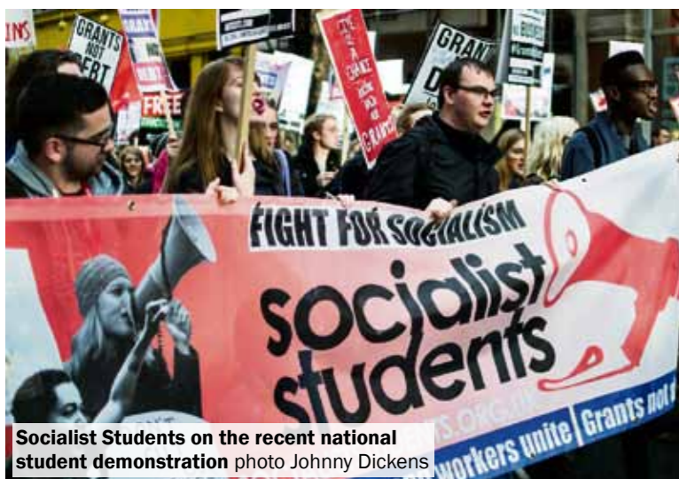
Socialist Students on the recent national student demonstration