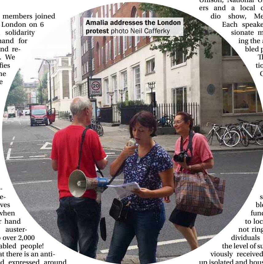
Amalia addresses the London protest

at the Sage Gateshead for our 'Rights Not Games' protest. Those attending were a diverse group uniting together to raise awareness in support of disabled rights and against continuing benefits cuts that disabled people are facing under this Conservative government and previous governments.