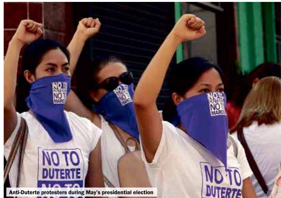
Anti-Duterte protesters during May's presidential election

What is the Communist Party of the Philippines's (Maoist) position on Duterte? In what way can he claim a 'left' label? The CPP is by no means united on the Duterte question. It has released official statements critical of Du-