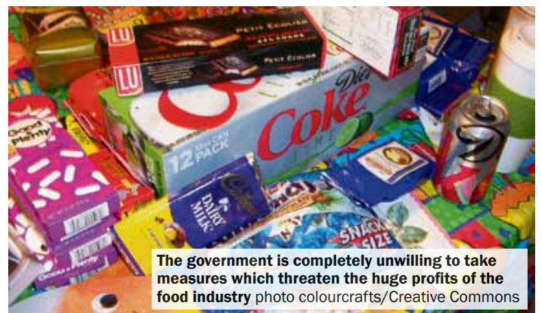
The government is completely unwilling to take measures which threaten the huge profits of the food industry

on local government-run leisure centres, many of which have closed or been contracted out with higher prices charged. Working long hours, or multiple jobs, in order to make ends meet because of stagnating wages makes accessing such facilities even more difficult.