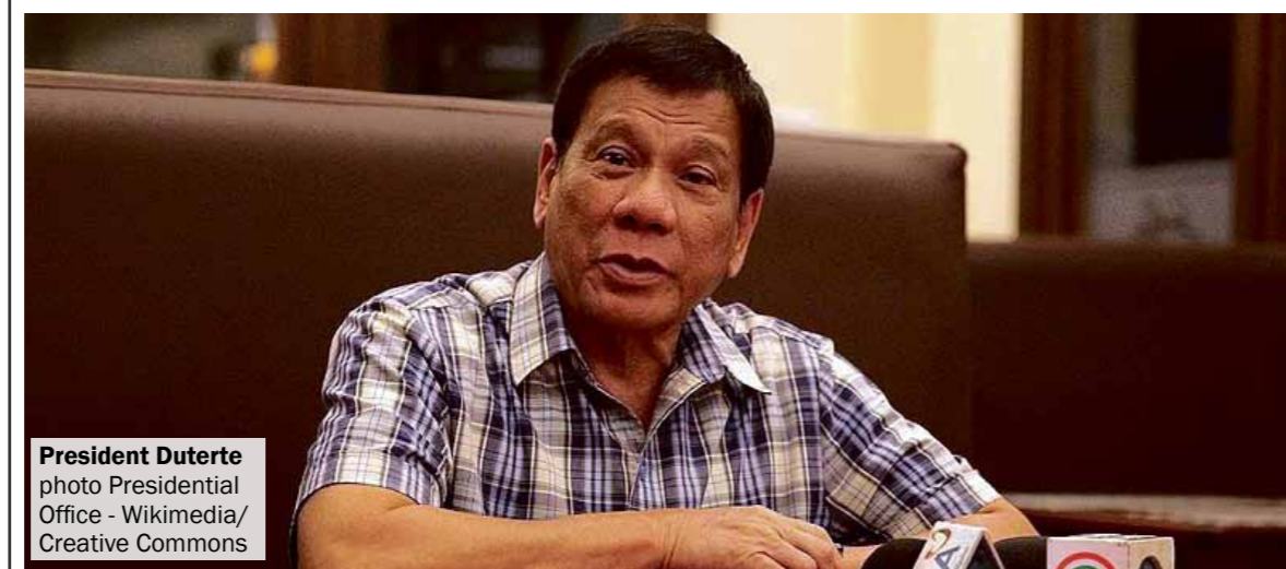
President Duterte