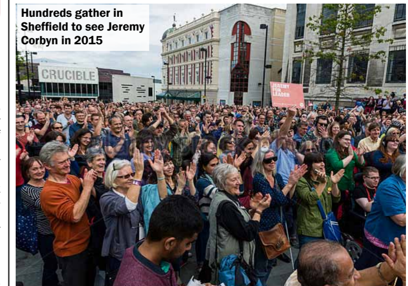
Hundreds gather in Sheffield to see Jeremy Corbyn in 2015