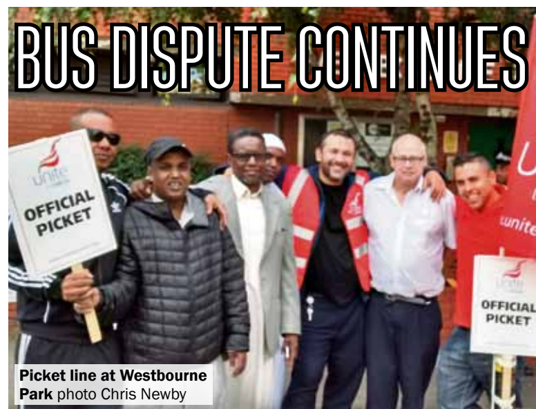
Picket line at Westbourne Park