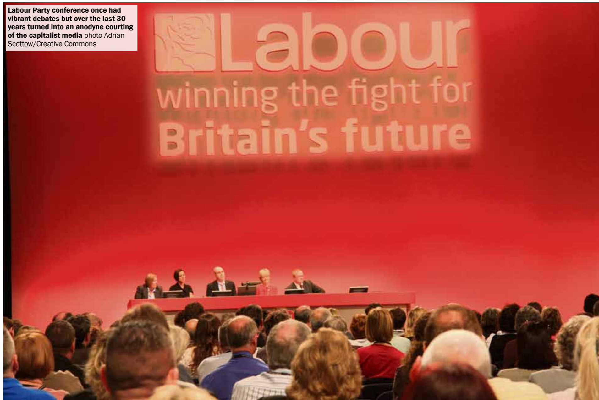
Labour Party conference once had vibrant debates but over the last 30 years turned into an anodyne courting of the capitalist media

be composited into just eight - losing along the way many of their clauses, and eliminating all resolutions on topics not selected.