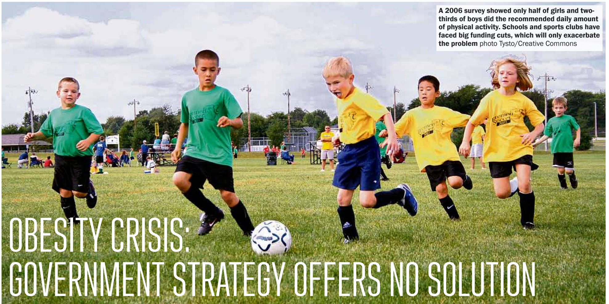
A 2006 survey showed only half of girls and two-thirds of boys did the recommended daily amount of physical activity. Schools and sports clubs have faced big funding cuts, which will only exacerbate the problem