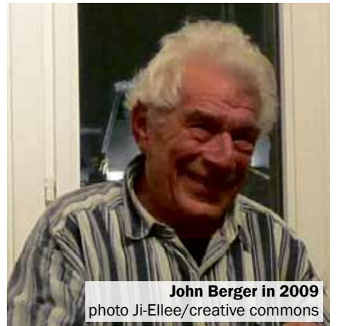
John Berger in 2009

Living for decades in a remote area of the French Alps, Berger wrote sensitively about the marginalisation of rural workers in an age of industrial capitalism, on the disastrous consequences of neoliberalism, and on the