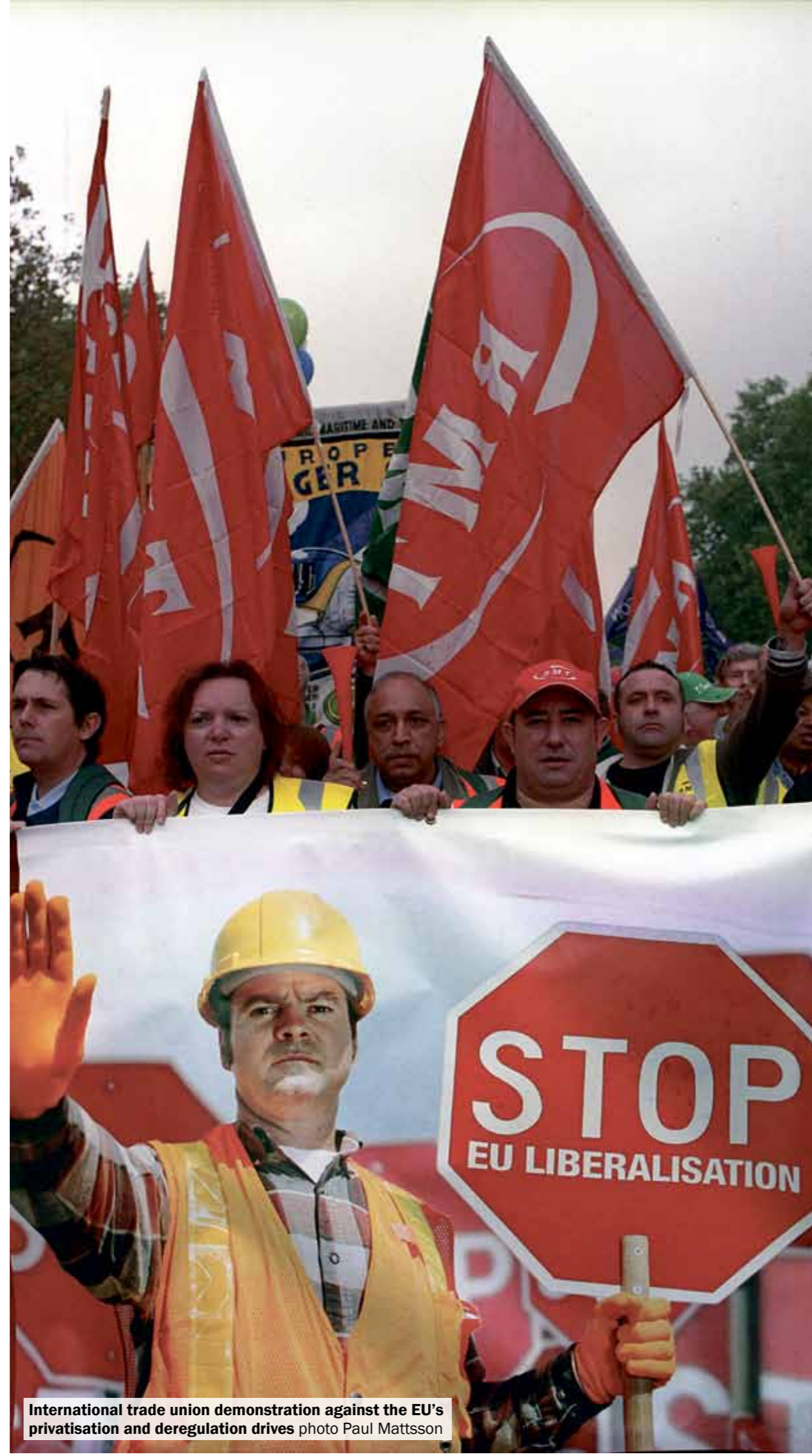
International trade union demonstration against the EU's privatisation and deregulation drives

But May is leading a government which will, from April, implement more anti-worker trade union laws. Britain already has some of the most