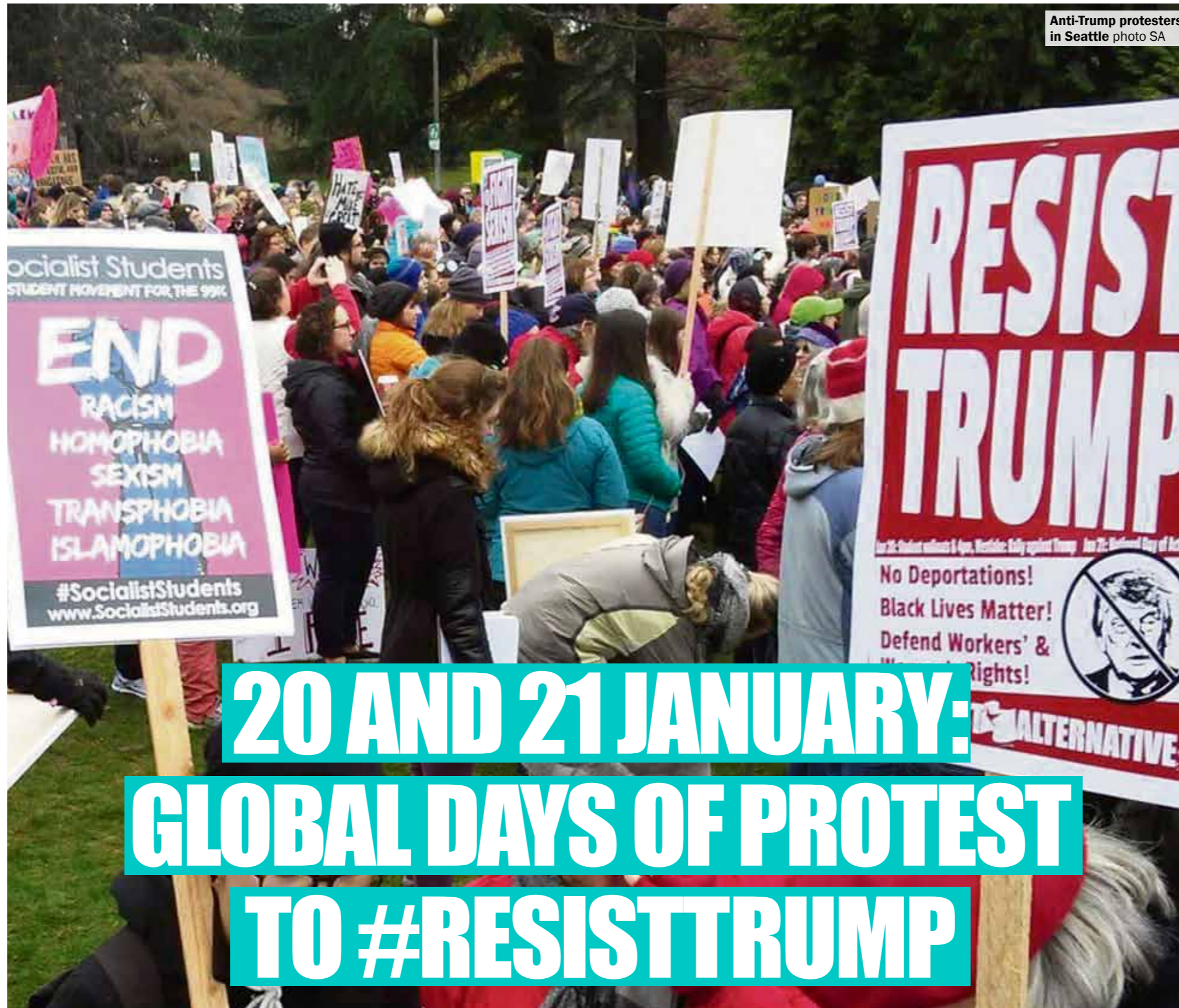
Anti-Trump protesters in Seattle

We believe that the fight against the right must be part of building an independent movement of working people to fundamentally transform society along socialist lines.