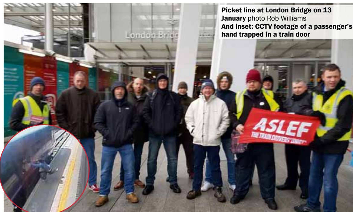
Picket line at London Bridge on 13 January And inset: CCTV footage of a passenger's hand trapped in a train door