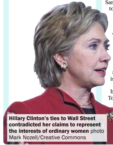
Hillary Clinton's ties to Wall Street contradicted her claims to represent the interests of ordinary women

But this is not a new or coincidental problem. The Democrats' loyalty to big business keeps them from squarely fighting the profit-driven policies that consistently drive poverty deeper,