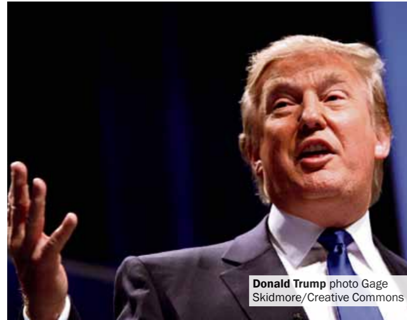
Donald Trump

At the time, the ruling class feared a deeper radicalisation - or even revolution - could take place if they didn't make concessions.