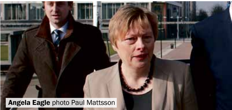
Angela Eagle

Eagle and her cronies have now been exposed and completely discredited. Another real scandal here is that there has been no mention of this within the local or national press. Back in June 2016 they were all falling over themselves to blame Corbyn's supporters.