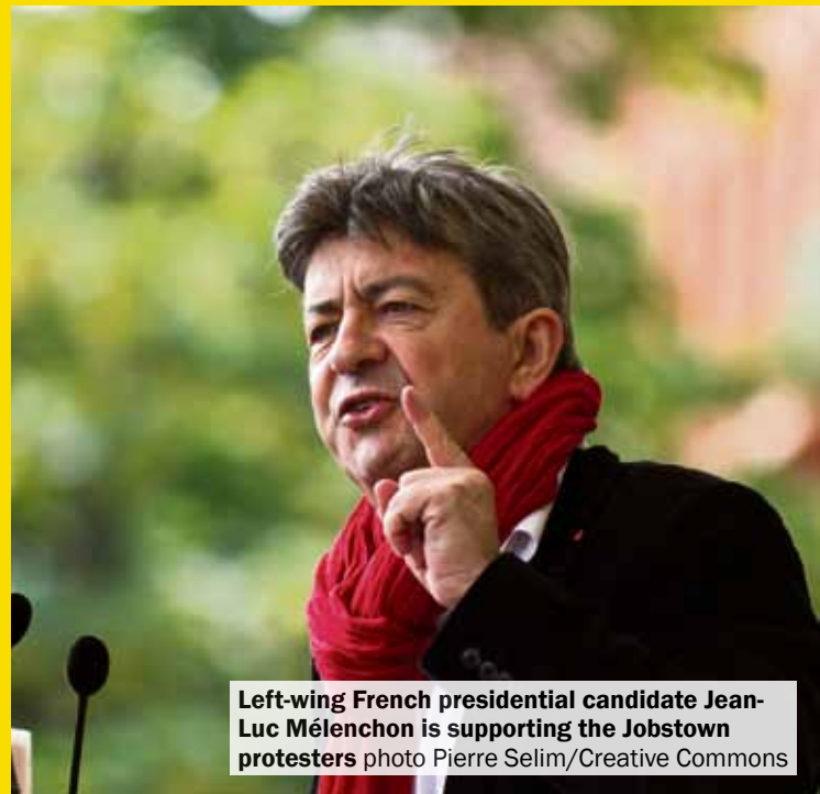
Left-wing French presidential candidate Jean-Luc Mélenchon is supporting the Jobstown protesters

To add your signature to the international solidarity declaration and to help the Committee for a Workers’ International campaign, go to socialistworld.net