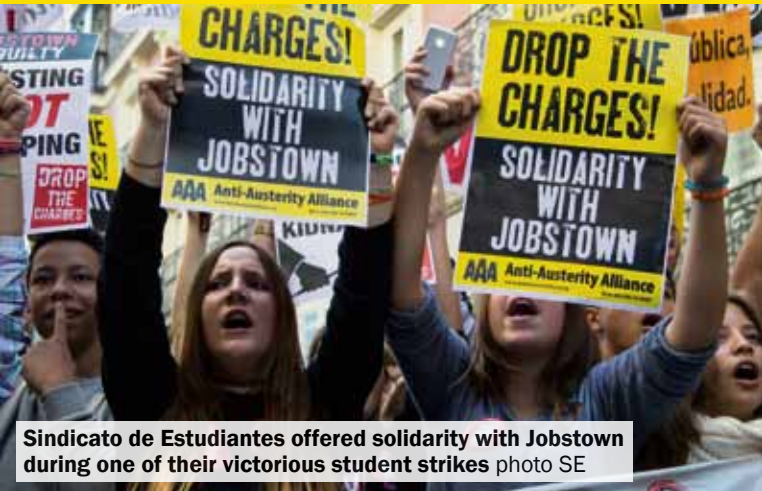
Sindicato de Estudiantes offered solidarity with Jobstown during one of their victorious student strikes

Right from the off there was broad opposition to the charges. However it was the tactic of mass non-payment that was key in