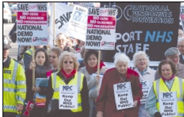
Pensioners say, Keep Our NHS Public!

A motion was proposed, supported by the Socialist Party councillors, the Liberal Democrats, the Tories, and five Green councillors, that the cuts should at least be postponed and subject to proper debate. These were not 'efficiency savings' but cuts with an impact on Lewisham services, for example, on Children and Young People's provisions. But they