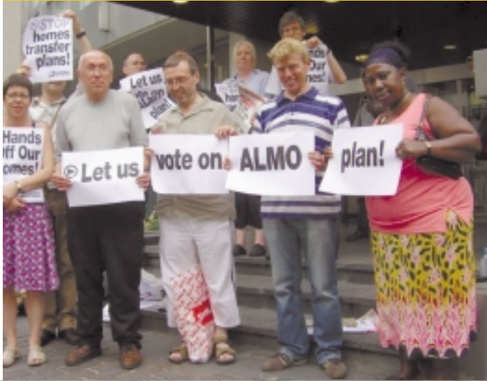
Fighting for 'decent standard' council homes Pages 6, 9, 15, 18, 20, 21, 23 & 26