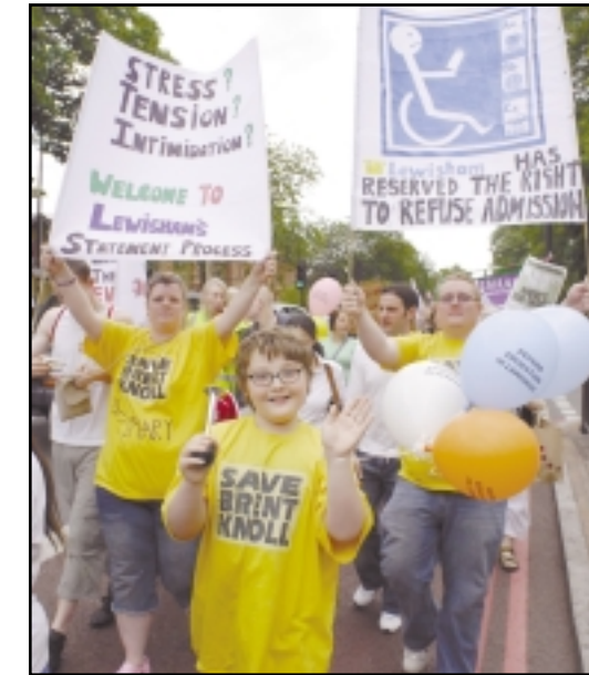
The liveliest contingent on May's Defend Education in Lewisham march was from the Brent Knoll special school. Students and parents told the demonstration how important the school was for children who suffered from a lack of support in mainstream schools. As one parent said "This isn't about catering for our children's needs. This is about money!".

MOST WORRYINGLY there was also evidence that, once again, New Labour's 'private profit from public services' agenda was driving all this. A report to the mayor earlier in the year had stated that changes to special needs provision were a "requirement of the