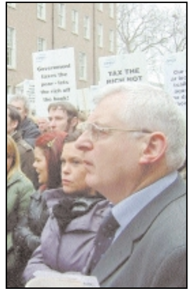
Socialist Party MEP Joe Higgins. The Socialist Party has gained support in Ireland while the Greens in government have implemented massive cuts.

In a 'hung council', with no one party having an overall majority, the Greens have sided with New Labour, or abstained to help give them a majority, on a number of key votes. These included votes for cuts in council services (see page 12); against the re-zoning of London Bridge during the East London Line shutdown (page 15); opposing elections to the Lewisham Homes board (page 10); not supporting a parents' ballot on the Monson school takeover (page 20); and insisting on the decant of pupils from Lewisham Bridge primary (page 28).