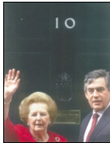
Tories and New Labour: more in common than you'd think