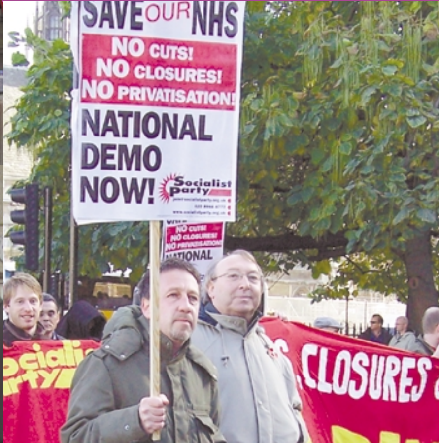
Keep Our NHS Public! Pages 8, 11, 24 & 30