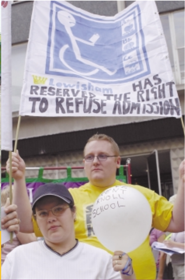
Defending education in Lewisham Pages 4, 9, 16, 17, 18, 20, 23, 28 & 29