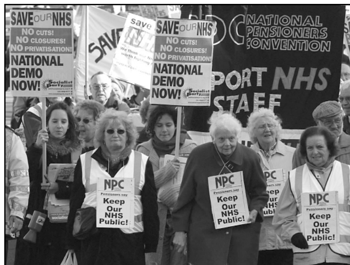
Marching to keep the NHS public - but New Labour councillors wouldn't back the pensioners' campaign (see opposite page)

In reality these plans are about cutting public spending and preparing for an ever greater involvement of private companies in the NHS. The NHS 'market reforms', making hospitals and different parts of the health service 'compete' with each other, are wasting billions of pounds on administration - and, from April, competitive advertising! But they will make it easier for American-style private health companies to step in to the most profitable parts. And that's what A Picture of Health is all about.