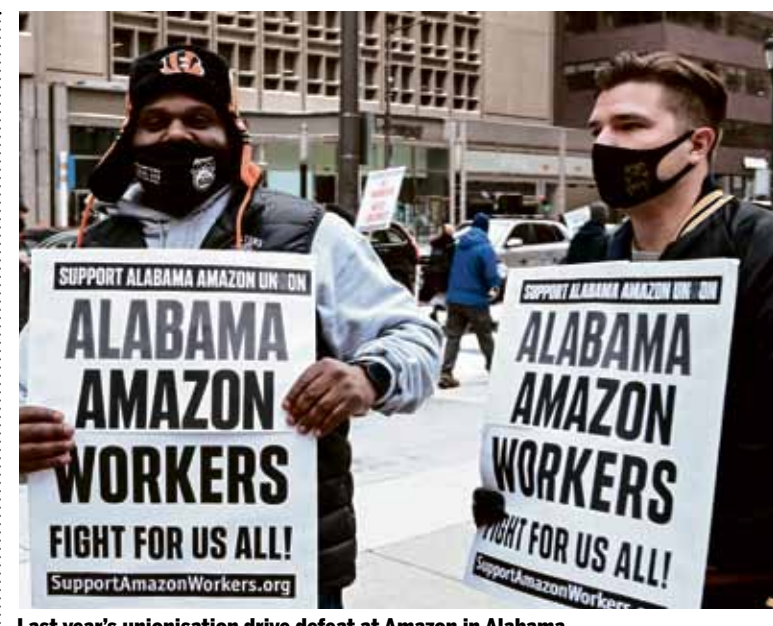
Last year's unionisation drive defeat at Amazon in Alabama did not deter victory for the union in New York

Chamber of Commerce and the National Retail Federation, are clearly angered by the result. Instead of recognising that the move to unionise flows from poor working conditions and abusive management, they sourly blamed the result on "undue"