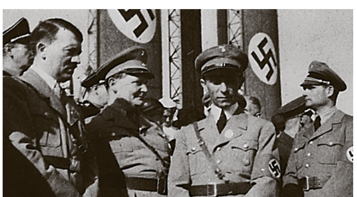
In just two years of occupying Ukraine, the Nazis slaughtered over 100,000 people