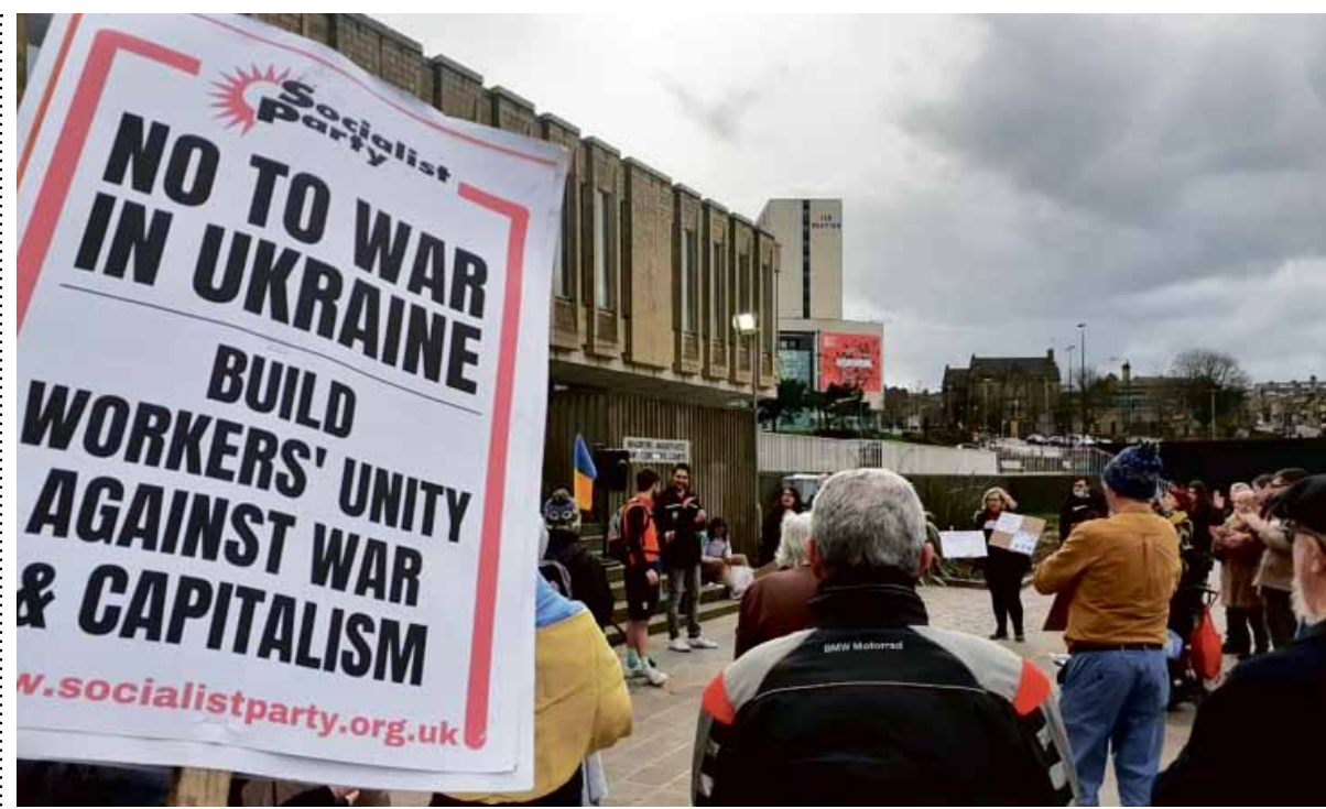
The statement calls for workers' unity to cut across divisions on ethnic and national lines

fascist groups, on either side of this conflict, seeking to take advantage of the war to build their own organisation and activity by further provoking national and ethnic tensions.