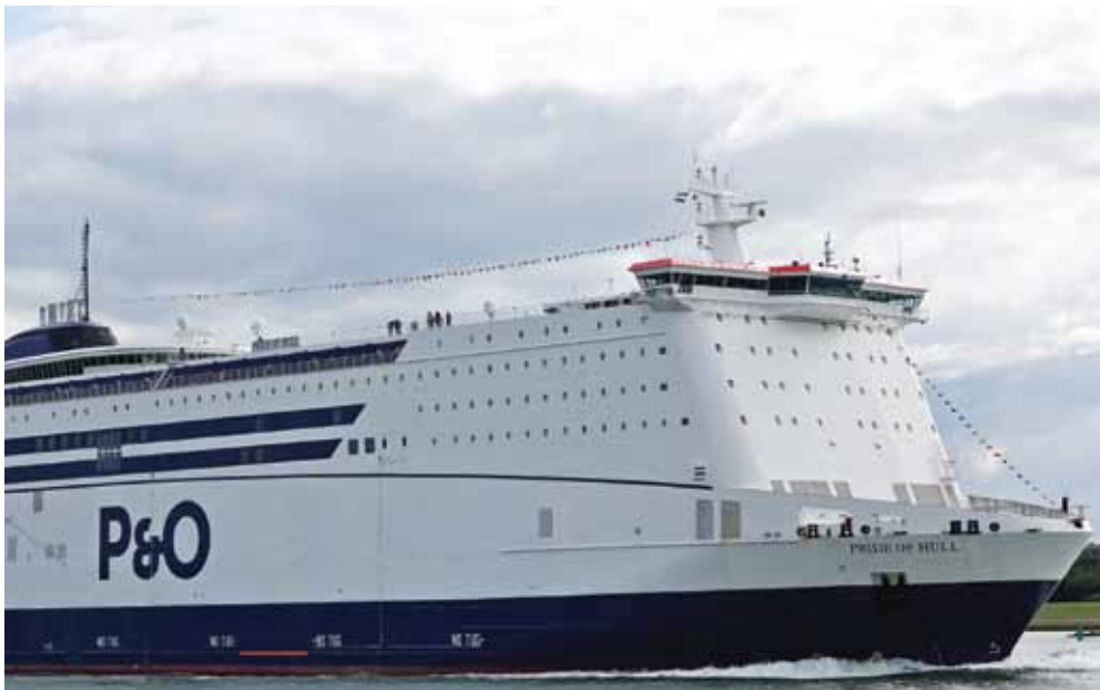
In Hull, the crew of the Pride of Hull lifted the gangway of their vessel, preventing security guards and police from boarding, before later leaving the ship of their own accord

national shop stewards network NSSN bulletin: shopstewards.net