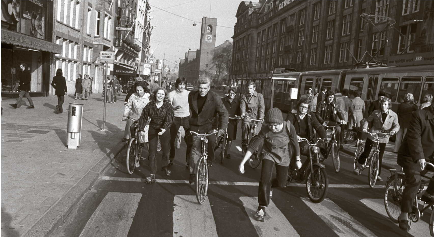
Above, people in Amsterdam, Netherlands, take to the streets on bikes and roller skates following the 1973 oil export embargo by OPEC, which targeted Western governments that had supported Israel in the ‘Yom Kippur’ war with Egypt

“““ Inflation in the UK had risen from 1% in 1960 to over 9% in 1971. The oil shock added to a process that was already baked into the capitalist economies