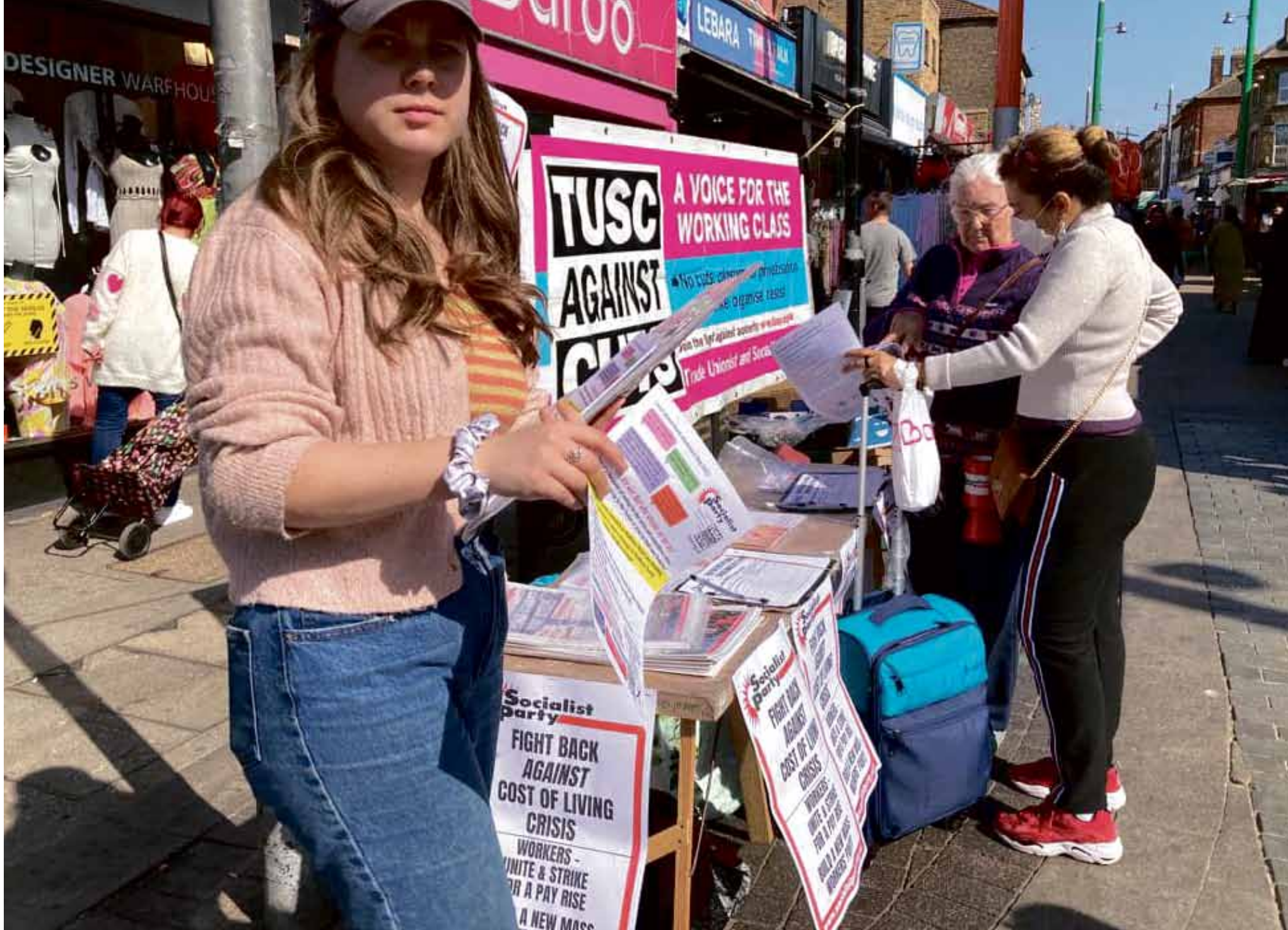
Socialist Party members, along with other activists, are campaigning in May's local elections for socialist policies to end capitalist cuts and to tackle the cost-of-living crisis

Those reserves could immediately be used to invest in services that our communities need now.