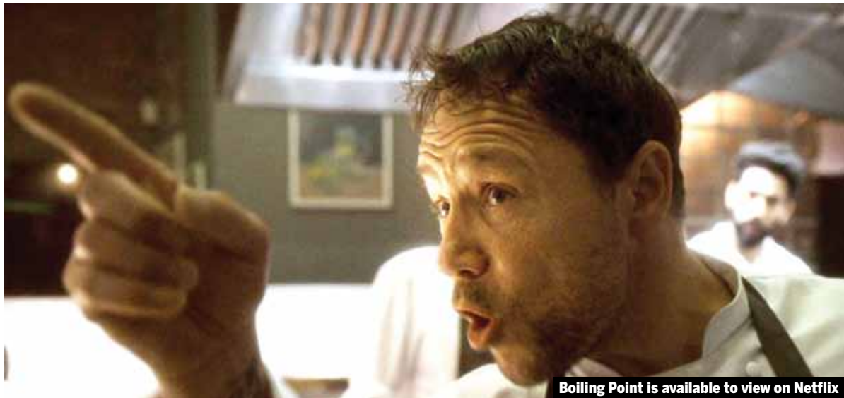
Boiling Point is available to view on Netflix