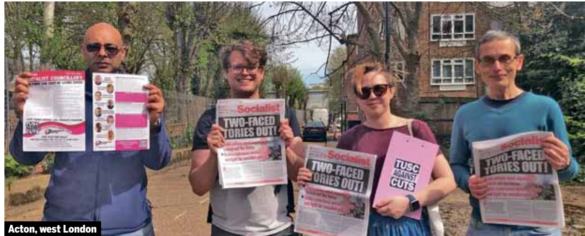
Acton, west London