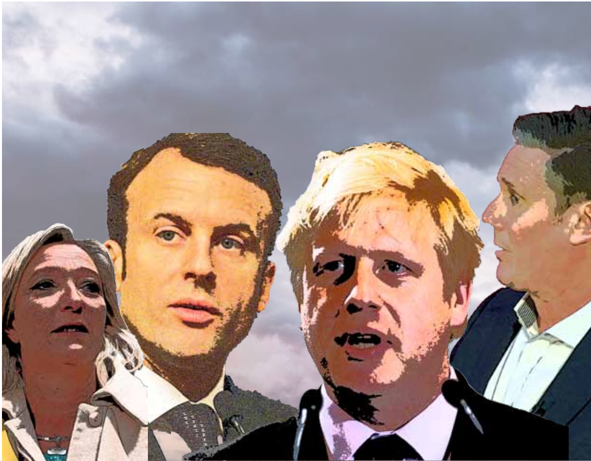
Establishment politicians in disarray in Britain and France

The result was a magnificent 7.7 million votes for that left challenge, 22% of those who turned out, and just six percentage points below the vote of current president and first round leader Emmanuel Macron. Mélenchon topped the poll in many major cities, including Toulouse, Montpellier, Lille, Le Havre and Nantes. Nationally he was the most popular candidate for 18 to 34-year-olds, winning over 32% of their votes.