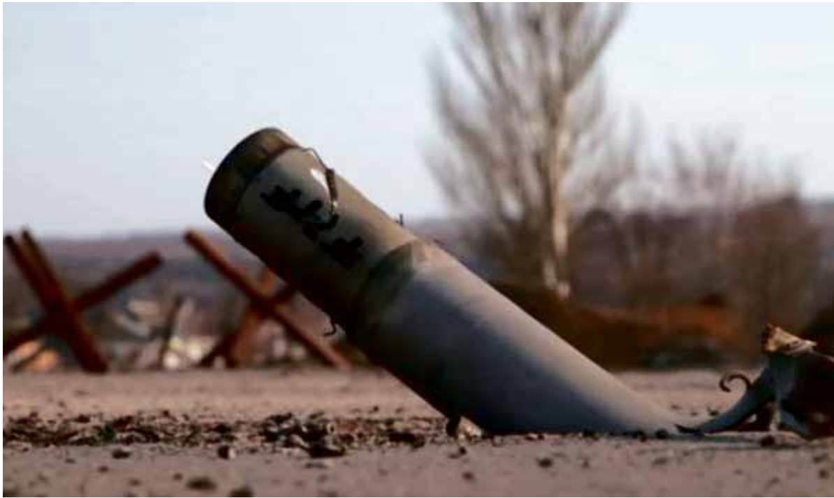
Weeks of bombing by Putin’s invasion forces has devastated Ukraine’s residential areas and infrastructure

It is now more than two months since the tame Russian parliament voted for Luhansk and Donbas regions in Ukraine to be recognised as ‘independent republics’ within Russia, and since president Putin’s tanks and troops began to roll into Ukraine. Following its failure to take Kyiv at the start of the invasion, Russian military forces have now regrouped and have launched a full-scale offensive to carve out the entire Donbas and Luhansk regions from Ukraine’s territory. Humanitarian corridors for civilians attempting to flee besieged cities are repeatedly agreed, then blocked. Putin seems intent on having a major success in what he calls Russia’s ‘Special Military Operation’ that he can announce on 9 May - the national holiday that commemorates victory over Hitler’s fascism in 1945. Ukraine’s president Volodymyr Zelensky stated on 16 April that 3,000 Ukrainian soldiers had died, while more than 19,000 invading troops had perished. 11 million Ukrainians have become refugees - 4.5 million of them fleeing abroad.