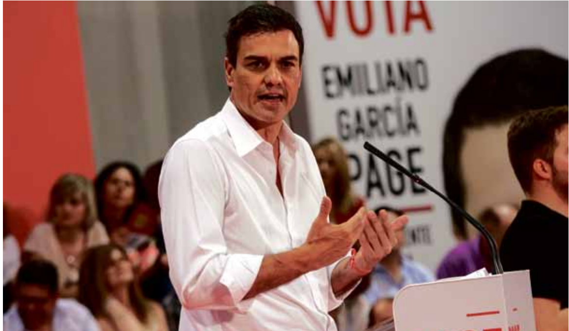
PSOE leadership has gone out of its way to dampen outbreaks of mass struggle against the Spanish state in the recent period

women's oppression which are being newly revealed and brought to light. For example, a lot of capitalist institutions - including the government and the justice system - are in a state of crisis. Their reactionary character is being exposed. Recently there have been several court cases involving rape and violence against women in which reactionary judgements were made. These have included judges blaming the victims. This has highlighted that women's oppression is not 'natural' or 'inevitable'. It is governments who make reactionary laws, who implement cuts which often hit working-class women hardest. It is the Francoist justice system which routinely blames women for their own experiences of rape and sexual violence. One of our first and most significant actions was on 8 March this year, International Women's Day. This day marked a real explosion against the reactionary Partido Popular (PP) government. This strike was a shout against all of the right-wing politicians - against the sexist justice system as well. But the 8 March general strike was not the only action.