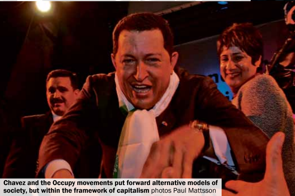
Chavez and the Occupy movements put forward alternative models of society, but within the framework of capitalism