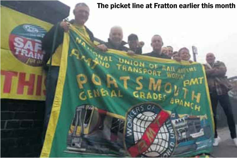
The picket line at Fratton earlier this month