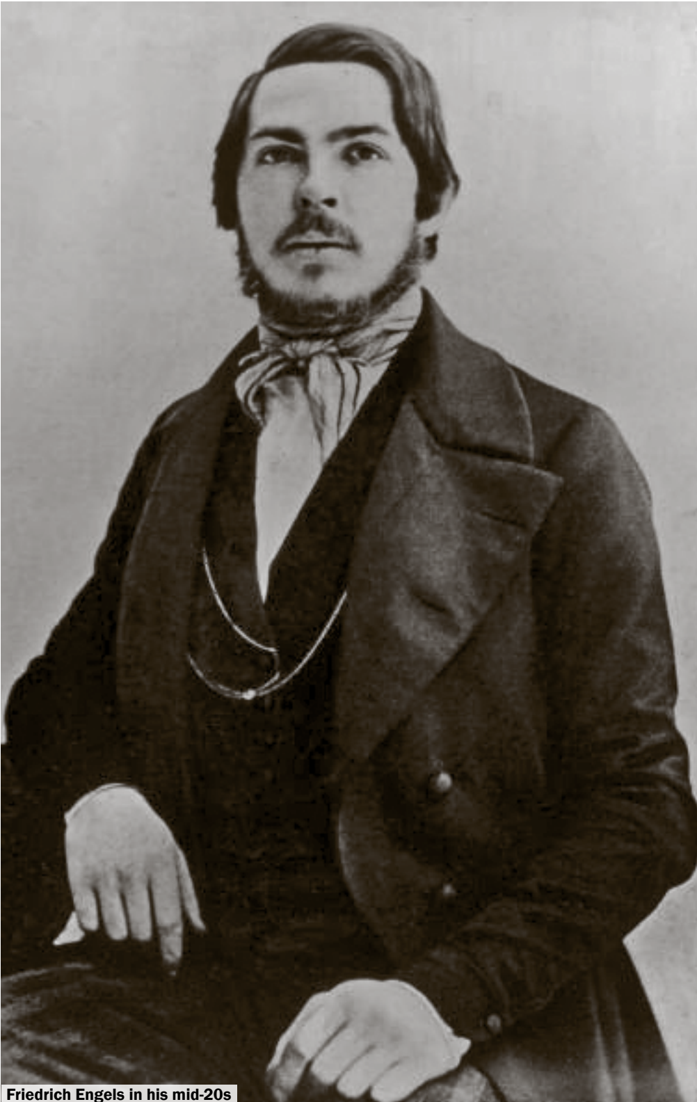
Friedrich Engels in his mid-20s