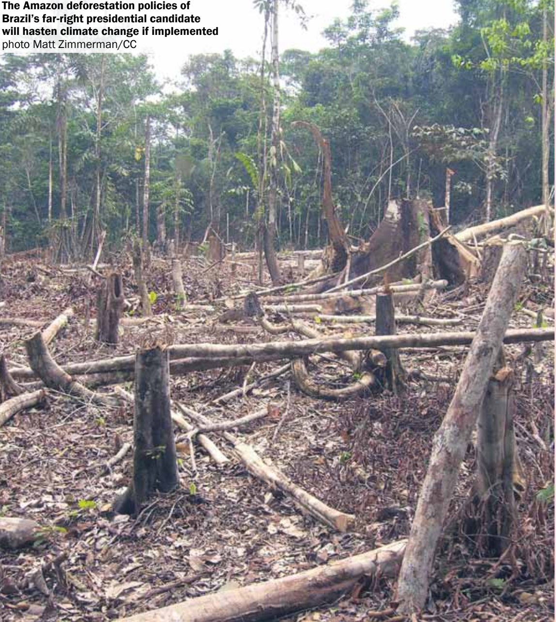
The Amazon deforestation policies of Brazil's far-right presidential candidate will hasten climate change if implemented

to make unions unafraid to challenge misconduct and fight bosses who exploit us. Join the Socialist Party to help transform our workplaces and renationalise our NHS.