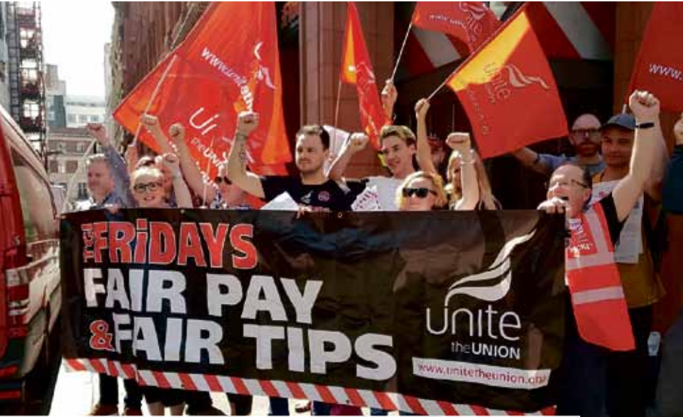
Exploited workers on precarious contracts, like those at TGI Fridays, are taking up the methods of struggle of the working class

However, despite representing a leap forward in offering an alternative society to capitalism, they remained imprisoned within the relatively