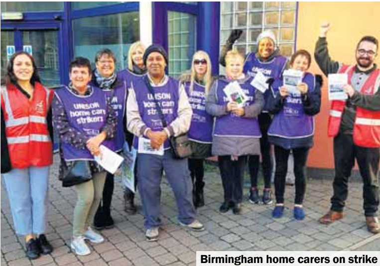
Birmingham home carers on strike