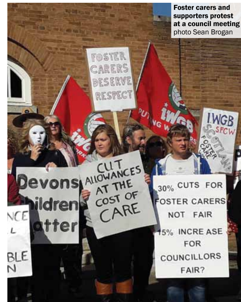
Foster carers and supporters protest at a council meeting