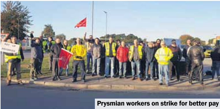
Prysmian workers on strike for better pay