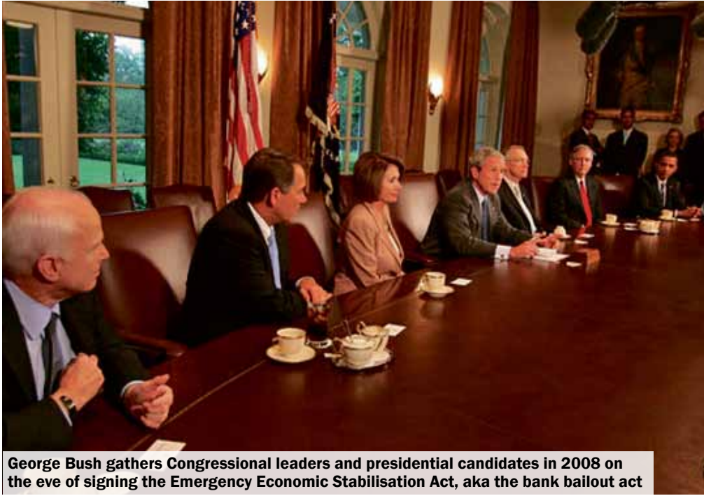
George Bush gathers Congressional leaders and presidential candidates in 2008 on the eve of signing the Emergency Economic Stabilisation Act, aka the bank bailout act

The programme of Marxism will be taken up internationally, arming the new generation with the political weapons that can finally dispatch the dictatorship of the market into the dustbin for ever.