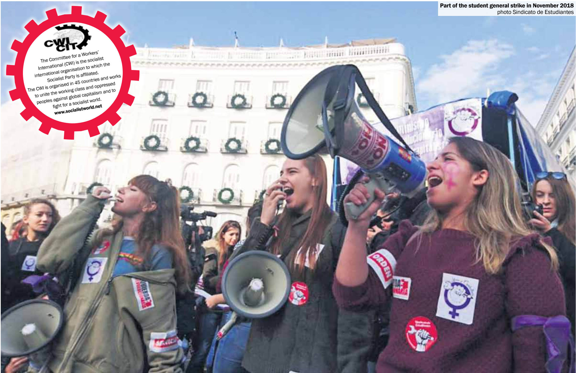
Part of the student general strike in November 2018

The escalation of class struggle - and the shift to the left of broad