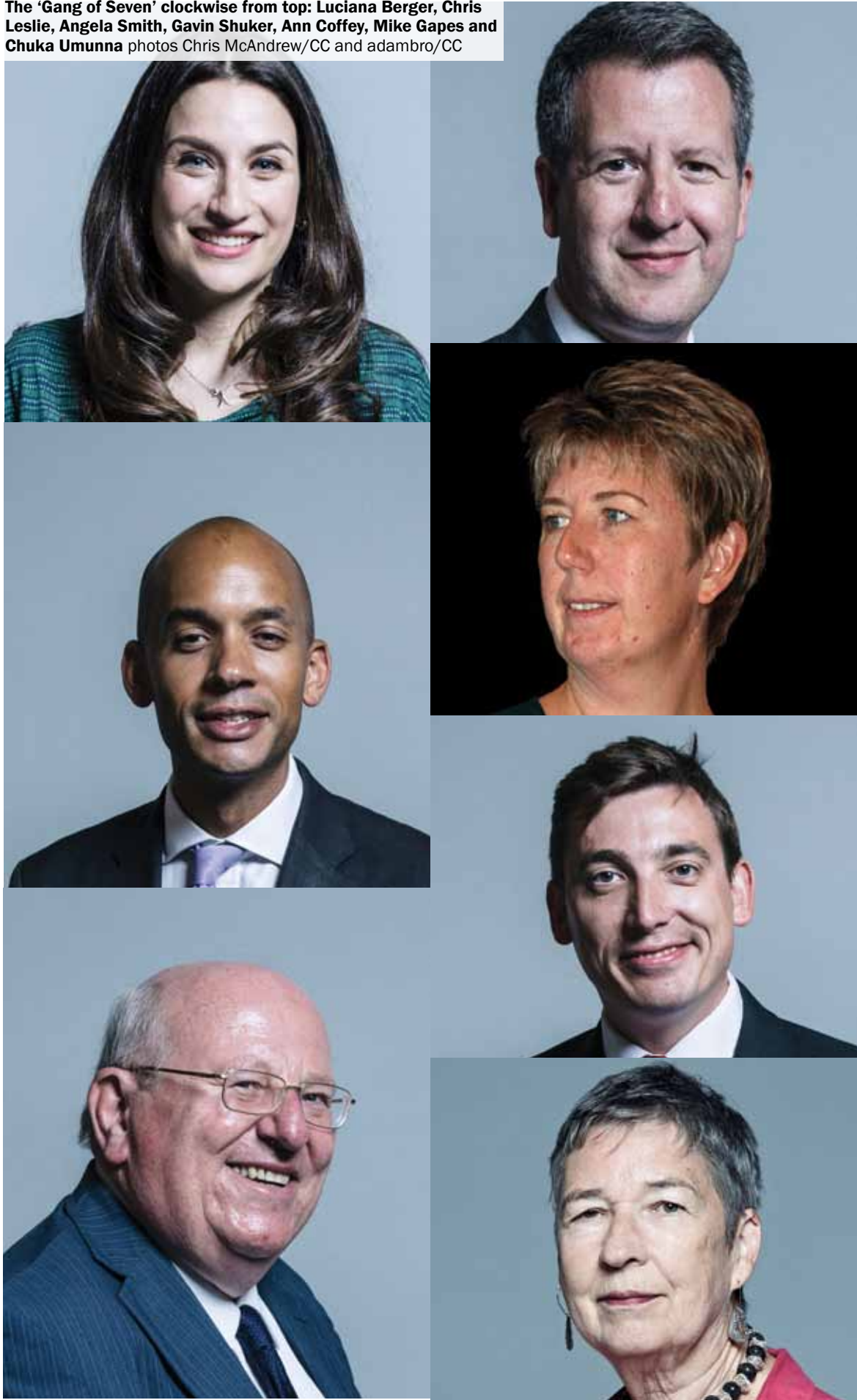
The ‘Gang of Seven’ clockwise from top: Luciana Berger, Chris Leslie, Angela Smith, Gavin Shuker, Ann Coffey, Mike Gapes and Chuka Umunna

“” The Labour leadership must now go on the offensive. As well as urgently mobilising the unions and working-class people to kick out the Tories, they must also mobilise to take on the Blairites