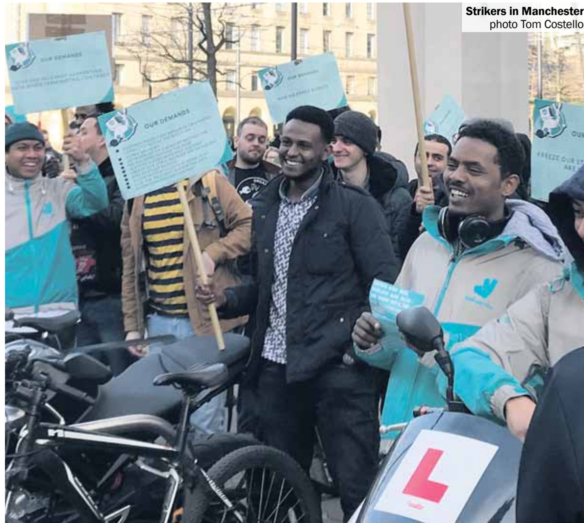
Strikers in Manchester