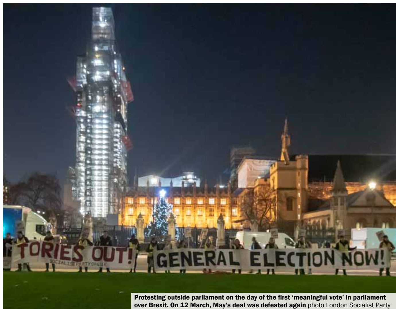
Protesting outside parliament on the day of the first 'meaningful vote' in parliament over Brexit. On 12 March, May's deal was defeated again

These votes were not binding, but no plan has yet been passed and May's government has been sinking more and more deeply into crisis. When Attorney General Geoffrey Cox didn't assist May's deal by giving a legal assurance against the UK becoming stuck in the EU Customs Union, there were frantic attempts to get his