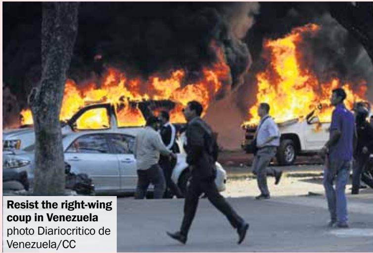
Resist the right-wing coup in Venezuela

We reserve the right to shorten and edit letters. Don't forget to give your name, address and phone number. Confidentiality will be respected if requested.