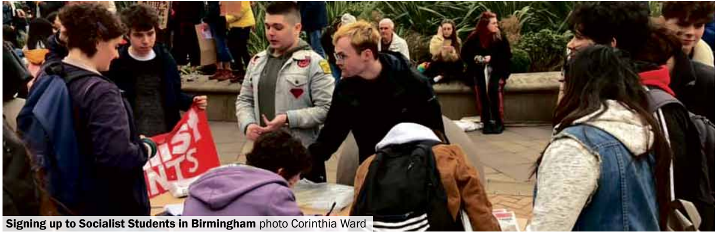
Signing up to Socialist Students in Birmingham