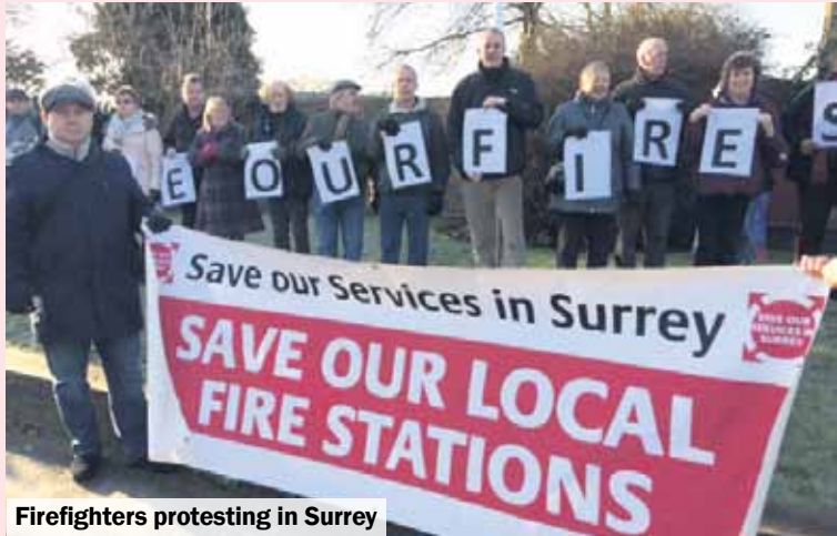
Firefighters protesting in Surrey