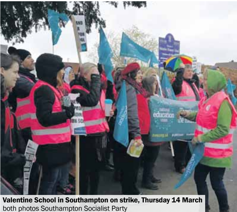
Valentine School in Southampton on strike, Thursday 14 March

But individual schools should not be left to fight alone. We need a national strategy, linked with trade union action against austerity in every