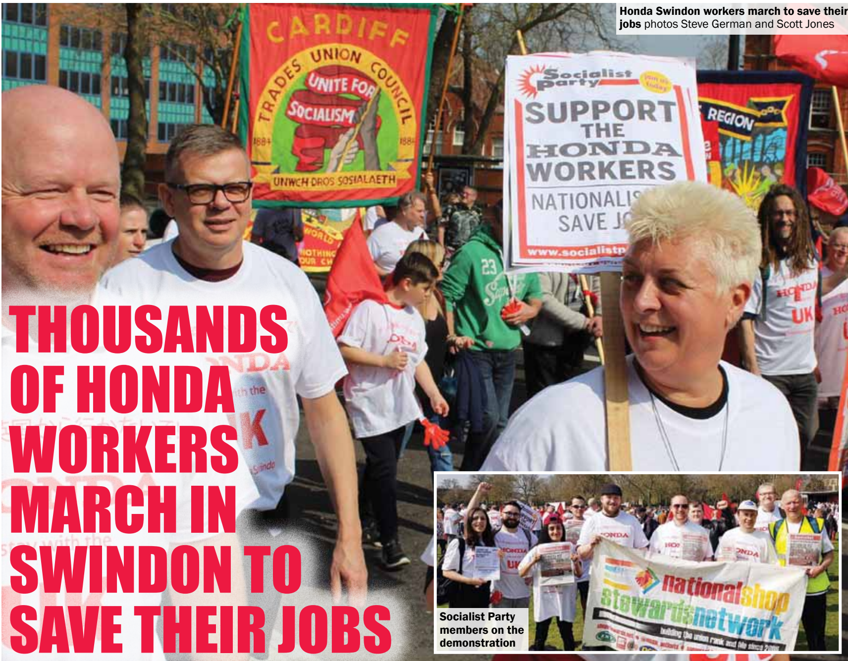
Honda Swindon workers march to save their jobs