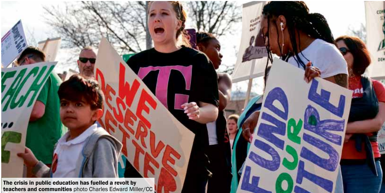
The crisis in public education has fuelled a revolt by teachers and communities