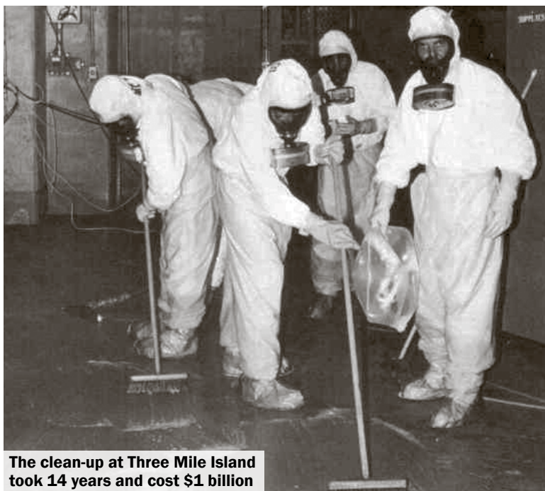
The clean-up at Three Mile Island took 14 years and cost $1 billion

Austerity-ridden capitalism is unable to make the investment needed to rapidly and safely phase out nuclear power, far less the global plan needed to tackle global climate change. For that, socialist change is needed.