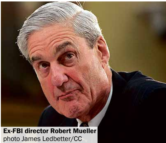
Ex-FBI director Robert Mueller

again rejected by a clear majority in the midterm elections) off the hook? It's not just their focus on Mueller's investigation as 'the way' to harm Trump. The Democrats also failed to take advantage of the government shutdown which led to Trump's highest disapproval ratings, by not challenging his narrative of an "invasion" at the southern border and refusing to mobilise ordinary people in the streets. The corporate media sought to give Nancy Pelosi (Democrat and Speaker of the House of Representatives) credit for bringing the shutdown to an end. But it was actually the action of air traffic controllers and flight attendants which threatened to lead to a full-scale shutdown of the airports which brought Trump to heel within hours. The bottom line is that the Democrats, even if they formally oppose reactionary policies, refuse to mobilise ordinary people to fight back. The establishment also resists any significant reforms that would affect the corporate bottom line. They answer to their corporate