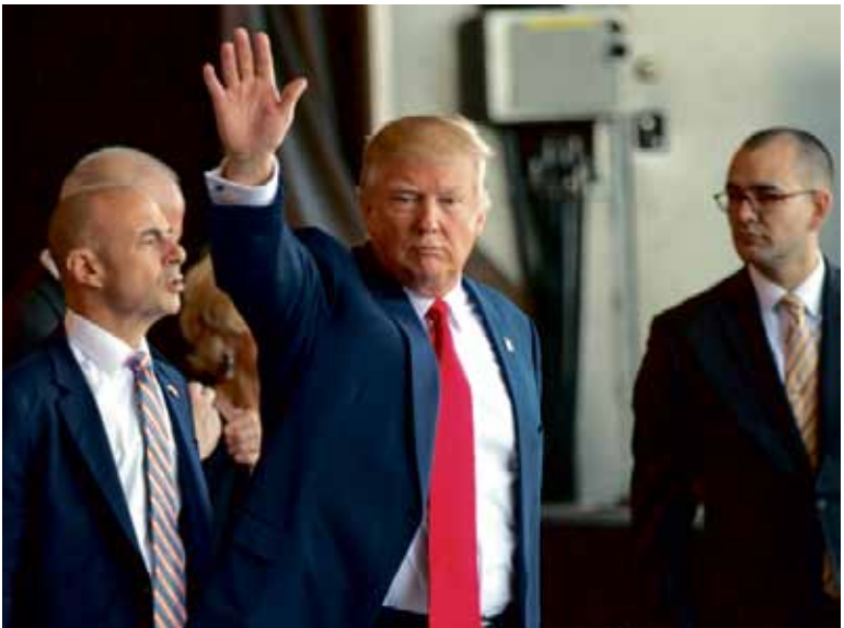
Trump attending the roll-out of a new Boeing 737 in 2017