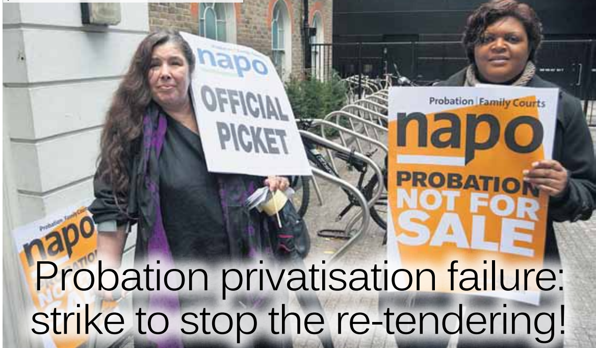
Napo members striking against privatisation

What's your view? email: editors@socialistparty.org.uk