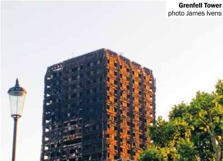
Grenfell Tower

On the day of publication, the Grenfell United group tweeted: "Whatever the government promise