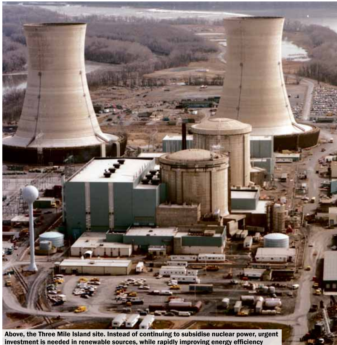
Above, the Three Mile Island site. Instead of continuing to subsidise nuclear power, urgent investment is needed in renewable sources, while rapidly improving energy efficiency

What's certain is that the Three Mile Island accident dealt a severe blow to the idea that nuclear fission could provide safe, clean energy. The US government was forced to introduce more stringent construction and safety regulations. This put a further squeeze on the profits that could be made from building hugely expensive nuclear power stations.