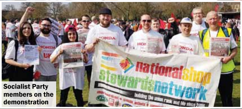
Socialist Party members on the demonstration