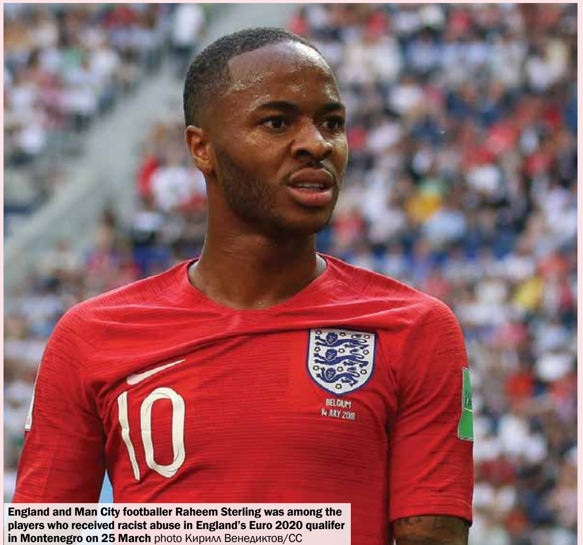
England and Man City footballer Raheem Sterling was among the players who received racist abuse in England's Euro 2020 qualifier in Montenegro on 25 March