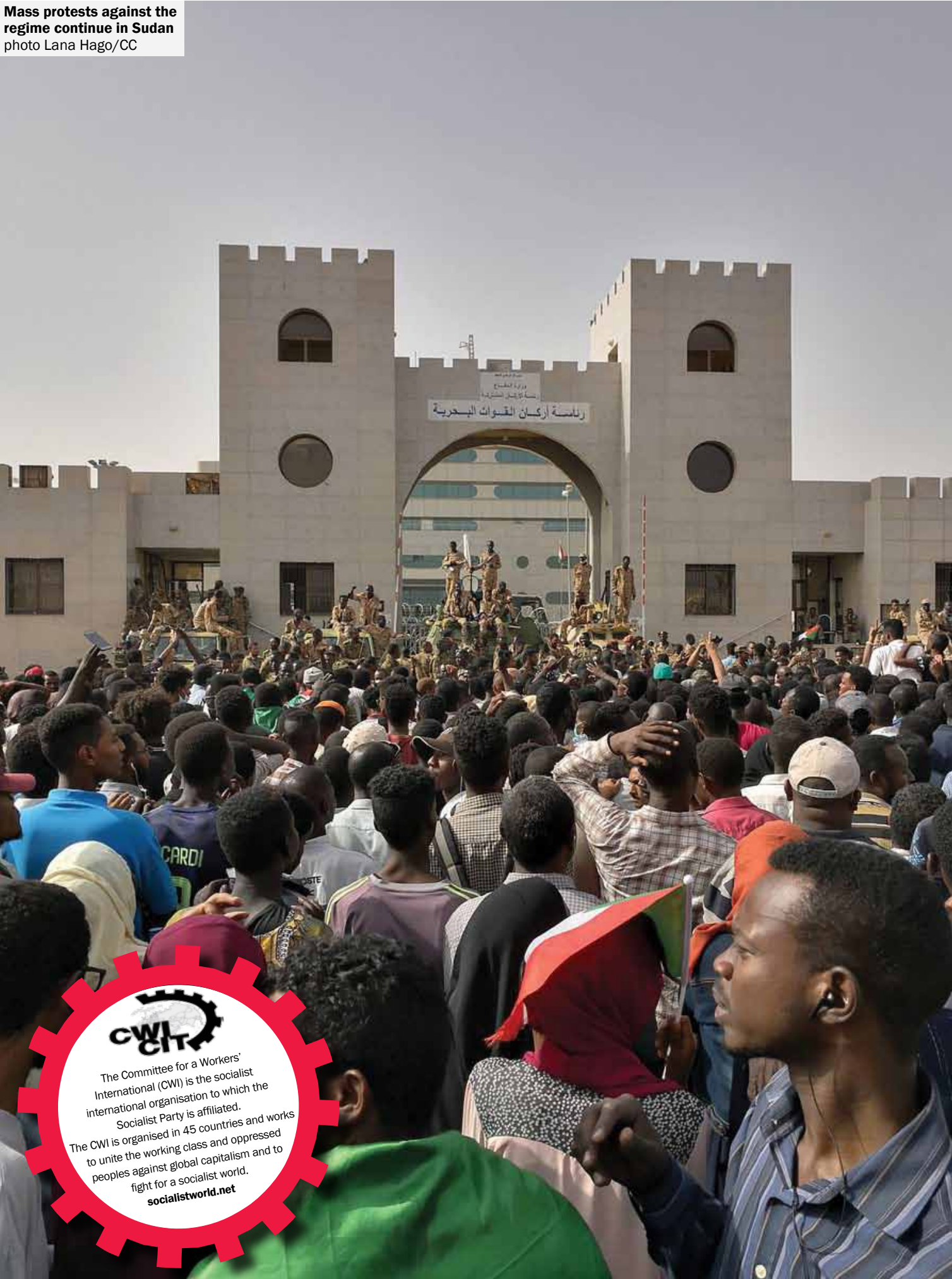
Mass protests against the regime continue in Sudan

Sudan faces a major economic crisis. The immediate trigger of this uprising was the removal of state subsidies on flour, leading to a tripling of bread prices. This was at the diktat of the IMF. Sudan has $55 billion of external debts. There will be pressure to pay back $8 billion out-