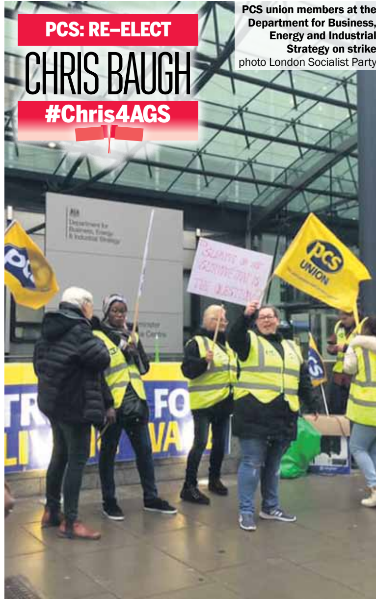
PCS union members at the Department for Business, Energy and Industrial Strategy on strike

50% of all members have to vote for the union to legally launch a campaign of industrial action. Branches all over the country have already met the 50% threshold.