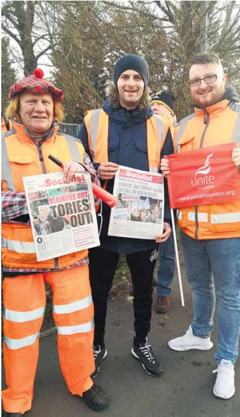
Bin workers on strike in Birmingham earlier this year

"Time after time, we have asked the council to implement the scheme, but it has continuously declined to. And that's why we're holding this strike ballot, to show that employers can't ride roughshod over freely entered into agreements to the detriment to our members."