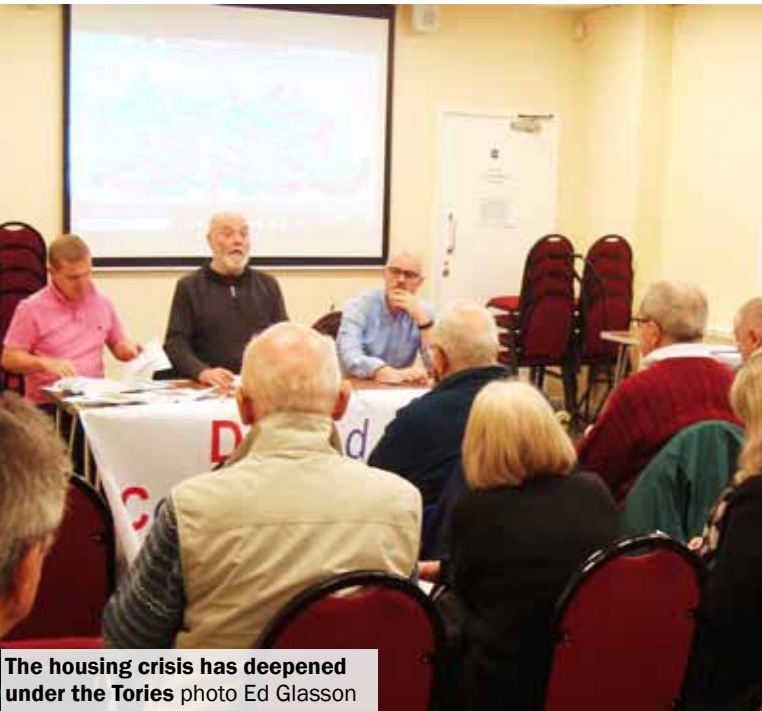
The housing crisis has deepened under the Tories