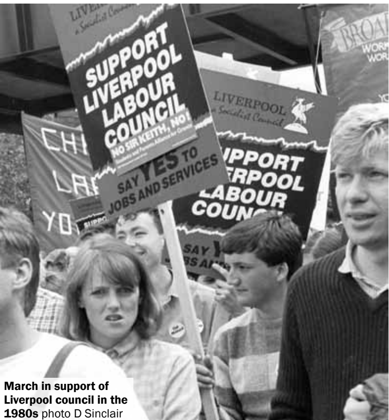
March in support of Liverpool council in the 1980s

lors (of which a minority were Militant supporters) adopted the slogan "better to break the law than to break the poor".