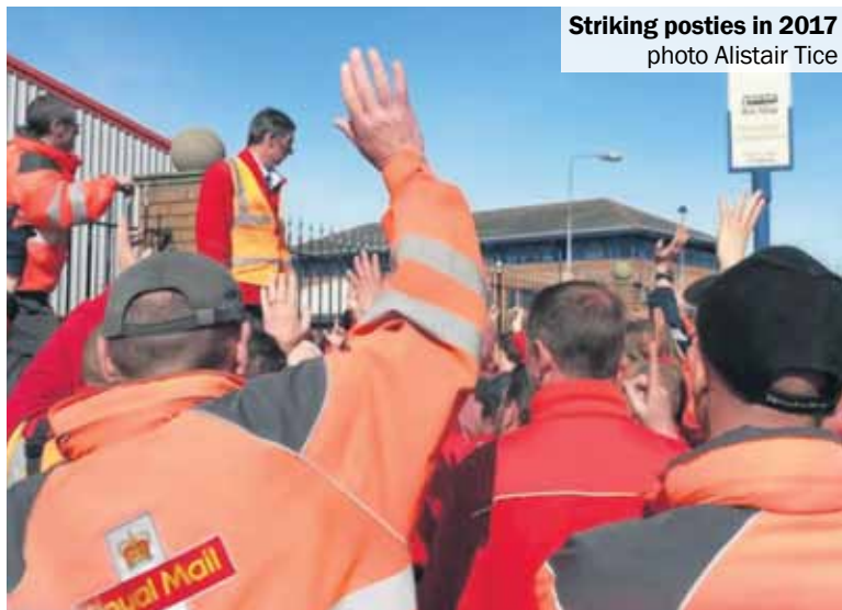
Striking posties in 2017