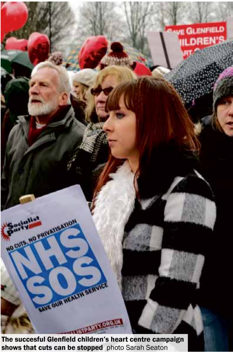
The succesful Glenfield children's heart centre campaign shows that cuts can be stopped

"I think we have proved by our record as the Socialist Party in campaigns like the successful save Glenfield children's heart centre - of which I was the chair - that if you mobilise people, if you get thousands of people on the streets, if you get people involved in action, then that is a powerful force for change.