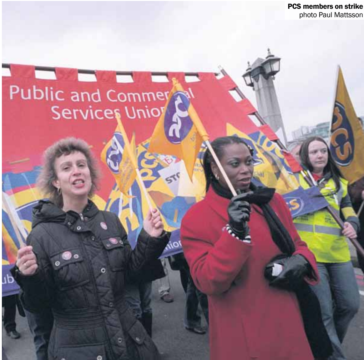
PCS members on strike

Threshold or no threshold - the fight goes on!