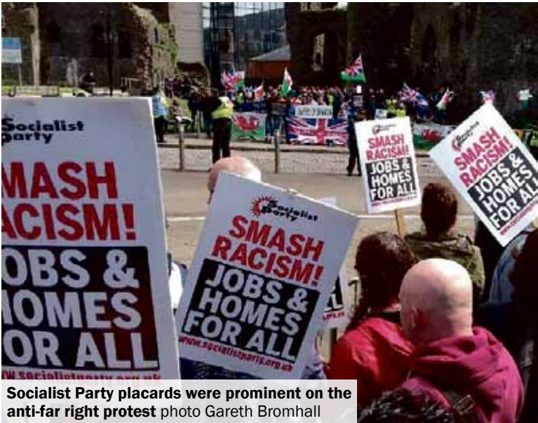
Socialist Party placards were prominent on the anti-far right protest

A rally by far-right For Britain leader Anne Marie Waters, an openly racist islamophobe and political ally of Tommy Robinson, was held in Swansea on 27 April.