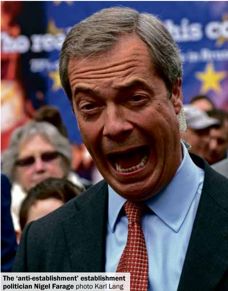
The 'anti-establishment' establishment politician Nigel Farage

For unity of workers across Europe - no to racism - don't let the bosses divide us. General election now!"