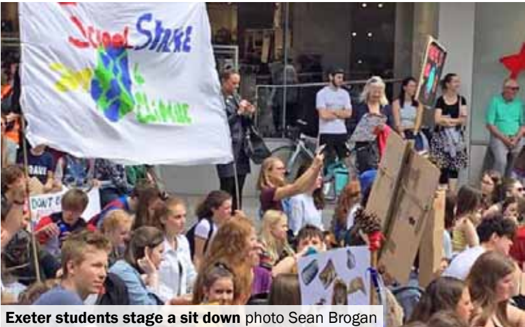
Exeter students stage a sit down

This shows that people are eager to see Pride as more than just a rainbow celebration of being LGBTQ+. Pride should be used to fight back against oppression and as a platform to promote socialist policies.