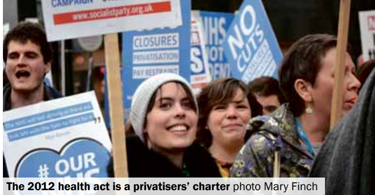
The 2012 health act is a privatisers' charter

The Clinical Commissioning Group (CCG) has closed nearly every community hospital in Devon. In its so-called 'consultation' the CCG chose to show our hospital in the worst light - having seen maintenance deliberately run down