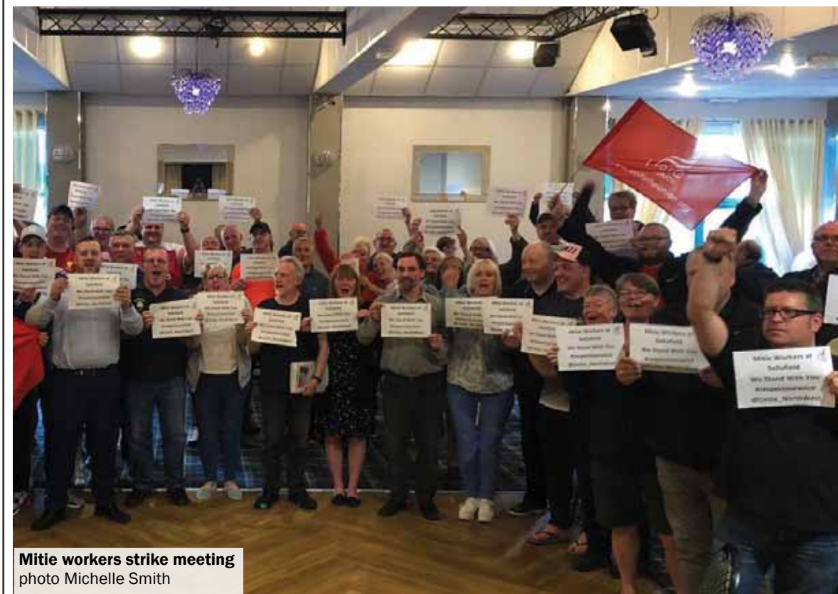
Mitie workers strike meeting

This was echoed at their recent strike meeting where the Sellafield Unite branch gave support and the convenor said: "Your strike has set a new benchmark for us - this is the best organised strike I've seen here in 40 years."