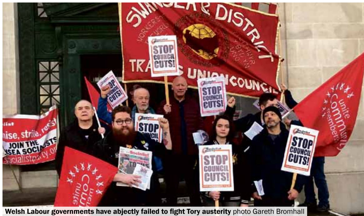
Welsh Labour governments have abjectly failed to fight Tory austerity