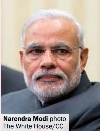
Narendra Modi

Modi's bigoted scapegoating and strongman methods. In the vacuum right populism can make gains. The traditional left - Stalinists, Maoists and social democrats - has all but disappeared. Years of 'lesser evil' support for 'progressive' capitalists have discredited them and obscured any elements of a socialist alternative. A powerful, mass, working-class and poor, people's party, with a fighting, socialist programme based on an independent class alternative, is yet more urgent. ■ Read the full analysis at socialistworld.net