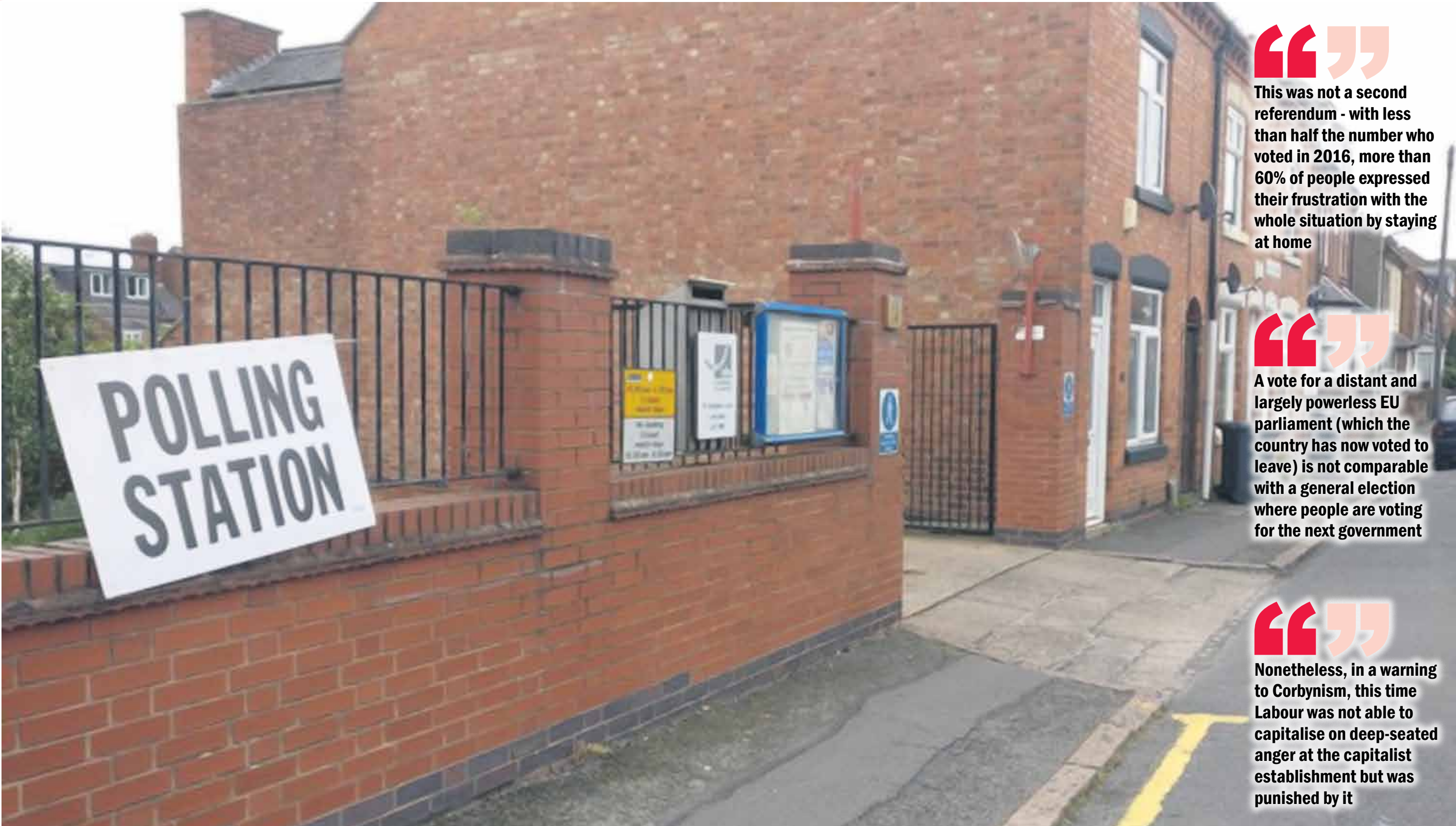
Mass abstention was the biggest feature of the EU elections