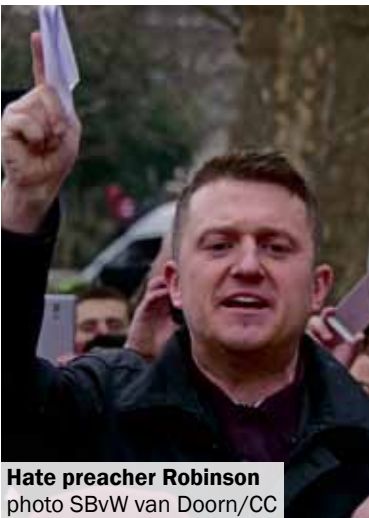
Hate preacher Robinson