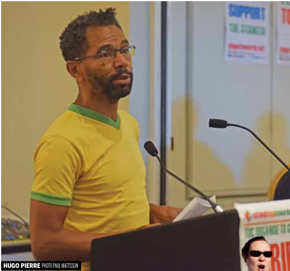
HUGO PIERRE

Workers’ control in the workplace is one of the sessions at socialism2020.net Online forum 20-23 November