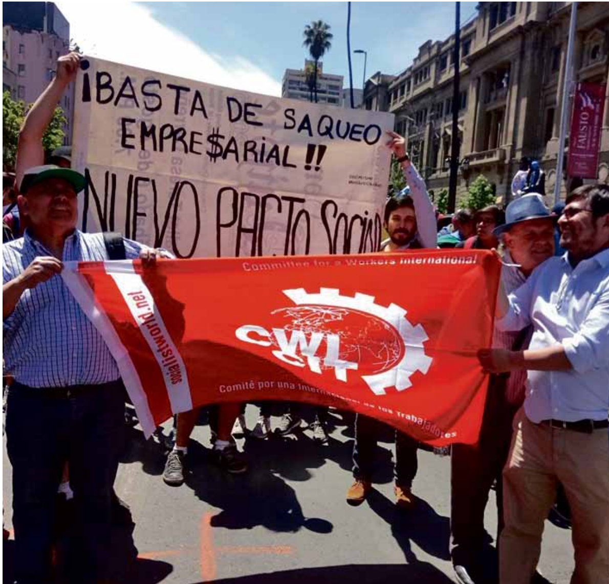
CWI Chile members on an anti-Piñera government protest last year

vote during the referendum. One proposal was for a mixed convention of elected representatives of the political institutions and other 'citizens'. The second, which was overwhelmingly endorsed, is a Constitutional Convention of 150 representatives, elected directly, which would then draft a new constitution to be put to another referendum in 2022.