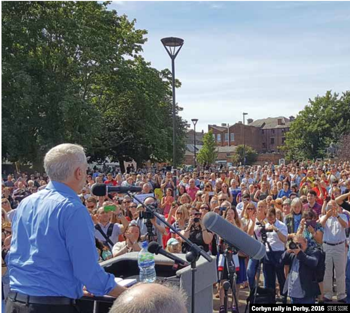
Corbyn rally in Derby, 2016 STEVE SCORE

The last five years have shown beyond any doubt that this strategy is doomed to failure. Under Corbyn, Labour was not transformed into a workers' party, but remained 'two