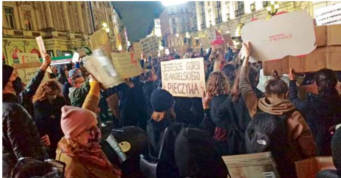
There have been large international protests (London demo above) in solidarity with pro-choice protesters in Poland

Tens of thousands of women have taken to the streets of Poland in an uprising against living in a "female hell". The Constitutional Court has effectively banned abortion, by ruling