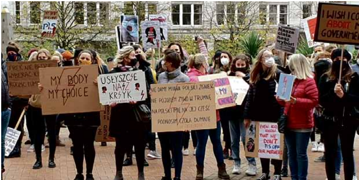
Part of the large solidarity protest in Birmingham