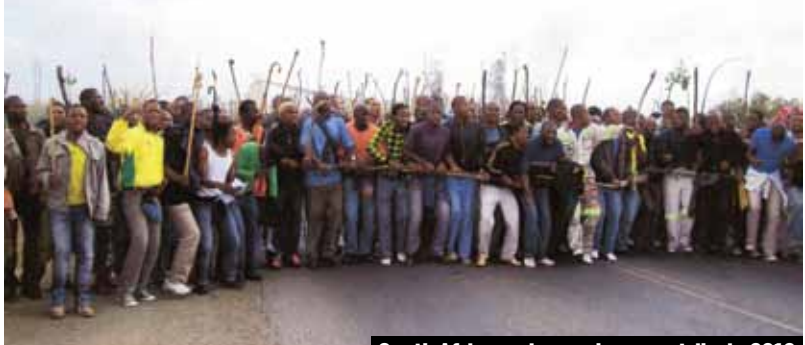
South African mine workers on strike in 2012

That's why the world is overripe for a socialist transformation of society. one that will make sure that production is no longer held back by private ownership. Instead it will be taken into public ownership, run under democratic working-class control and