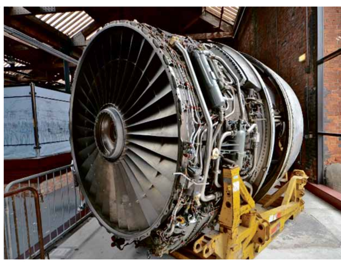
The RB211 engine, whose spiralling development costs bankrupted the aerospace giant

On 22 January the board concluded that the RB211 development could not be met, and on the 26 January decided that, subject to