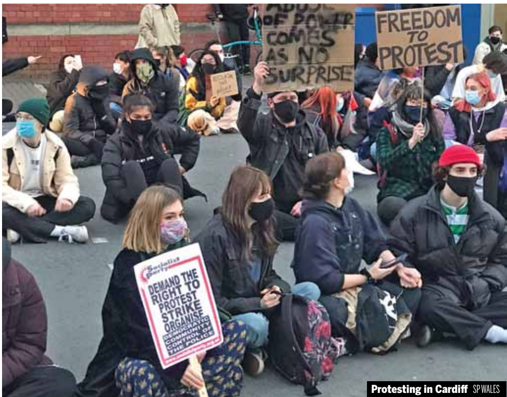
Protesting in Cardiff SP/WALES

The right to protest is not a given in a society based on the exploitation of the majority by a tiny minority