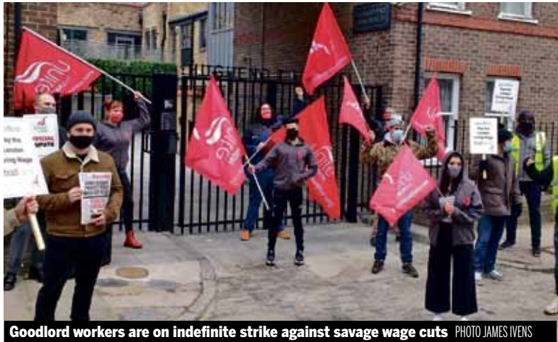
Goodlord workers are on indefinite strike against savage wage cuts

Get all the latest union news nationalshop stewardsnetwork NSSN bulletin: shopstewards.net