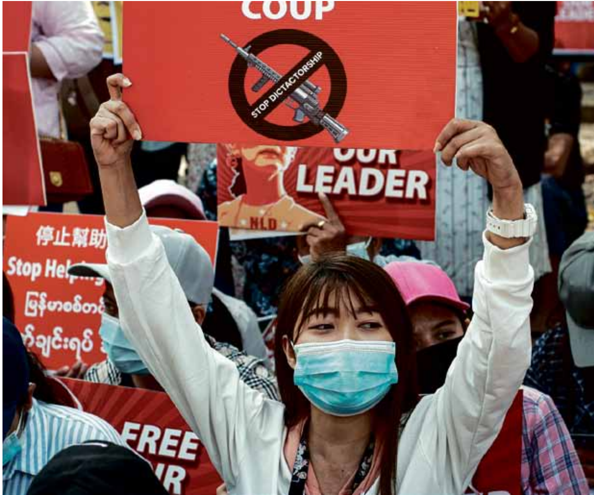
Establishing a revolutionary constituent assembly is vital to take the struggle forward

She and her party have never delivered on improving rights or conditions for the majority of the population during the years they