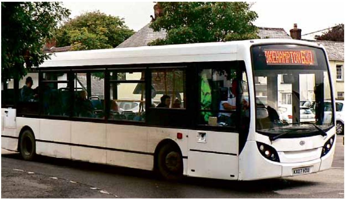
3,000 bus services have been axed over the last decade due to a 40% cut in council funding

"The National Bus Strategy attempts to address these issues but specifically excludes the best solution which would be to allow local authorities to work together to operate their own services."