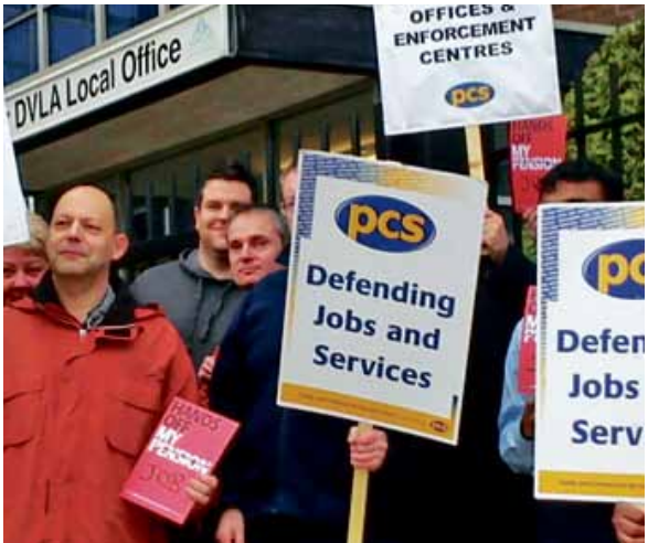
DVLA workers have voted to walkout over Covid safety concerns