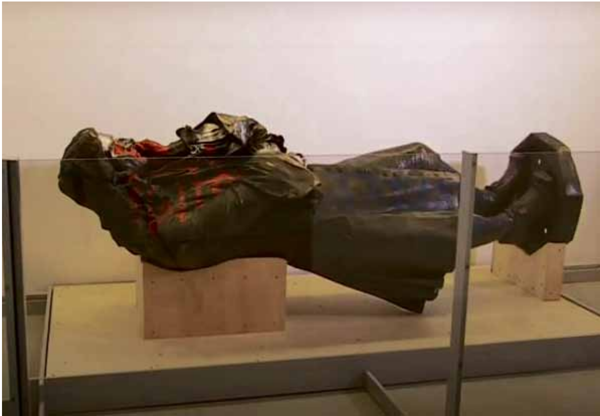
The toppled statue of slaver Edward Colston, now in an exhibition