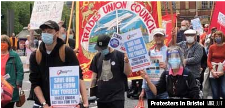
Protesters in Bristol