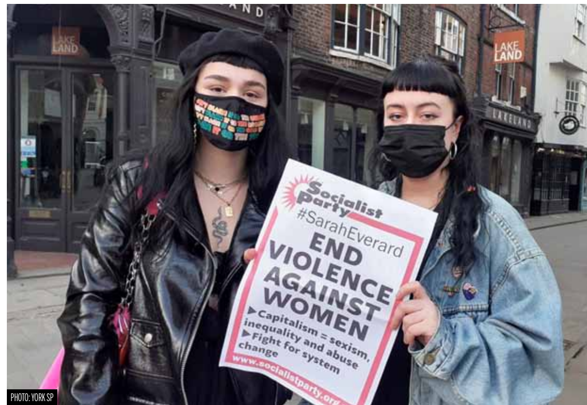
CORINTHIA WARD BIRMINGHAM NORTH SOCIALIST PARTY

The horrific and brutal details surrounding the abduction, rape and murder of Sarah Everard were made known to the public on 29 September as the sentencing against her murderer, Met police officer Wayne Couzens, began. Couzens abused his power as a police officer to falsely arrest Sarah Everard as she walked home, citing she had broken Covid restrictions. The premeditated murder has once again brought into question women's safety and the accountability of the police.