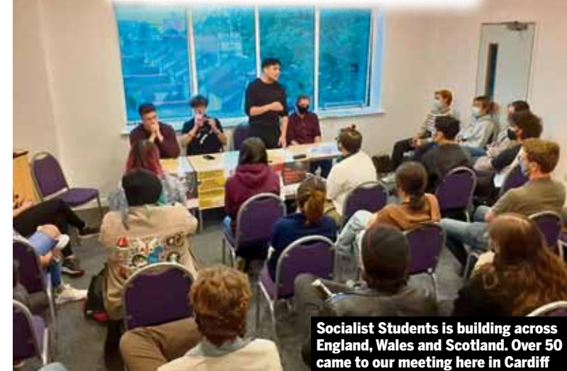
Socialist Students is building across England, Wales and Scotland. Over 50 came to our meeting here in Cardiff

Join the student fightback JOIN socialist students socialiststudents.org.uk/join