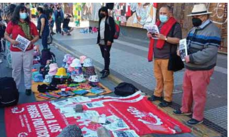
CWI Chile members in Santiago on the second anniversary of the uprising

In the two years since, the famiger strike is to bring to the attention of society what is happening, and to