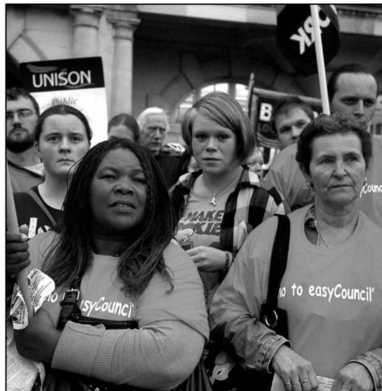
Trade unionists protesting against the 'outsourcing' of jobs and services.

The latest report on BT's call-handling arrangements with the council