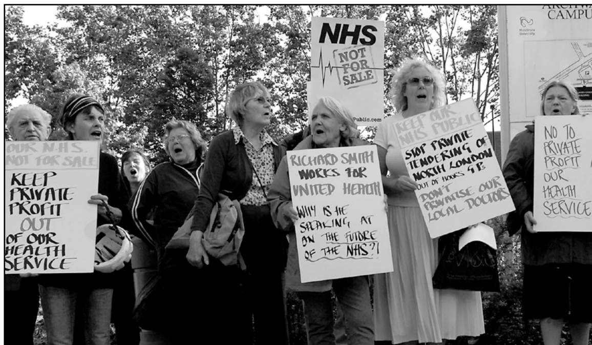
Private hands off our NHS!

People fear that proposed changes are being implemented with scant regard for the 2006 NHS Act, which says: "These NHS organisations are required to make arrangements to involve and consult patients and the public in: planning of the provision of services; the development and consideration of proposals for