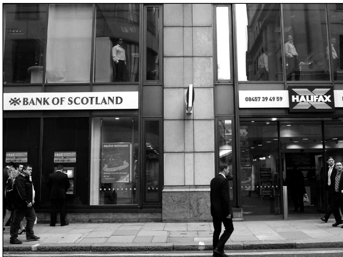
Journalist Peston warns that Britain's banks would be "too big to save" if there was another banking crisis.

Socialists would agree that banking along capitalist lines is very unstable. But we would point to a more fundamental contradiction of the banking system than Peston. For ordinary people banks are about having somewhere safe to put your money or somewhere to get a mortgage or loan. However, the raison d'être of banks is the pursuit of