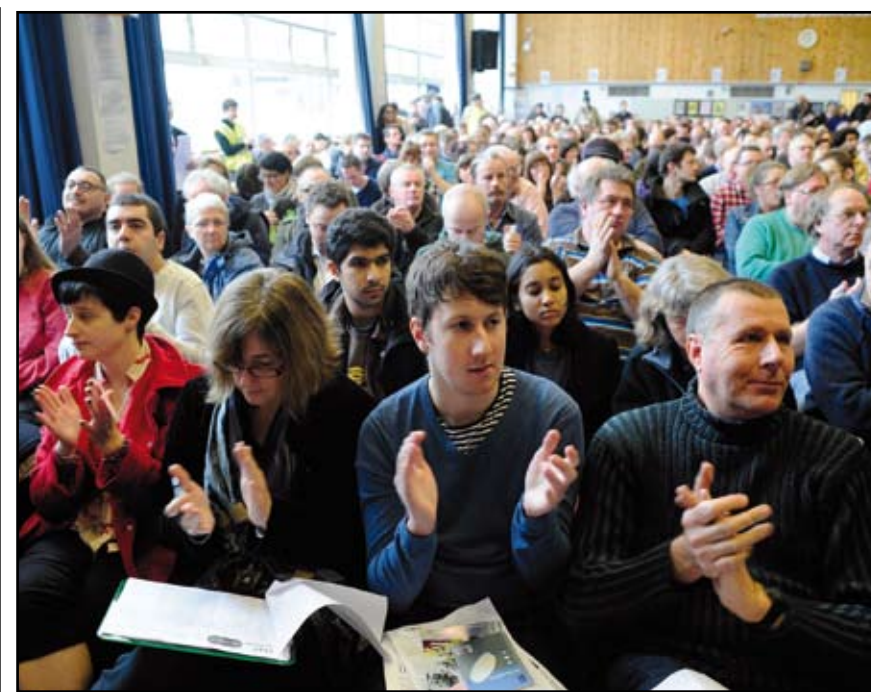
Part of the large audience.