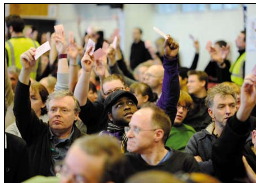
Voting for motion one.

Abbott has called for the government and councils to be "mindful" about the race and gender distribution of job losses rather than making a call for no job losses at all and for Labour councils