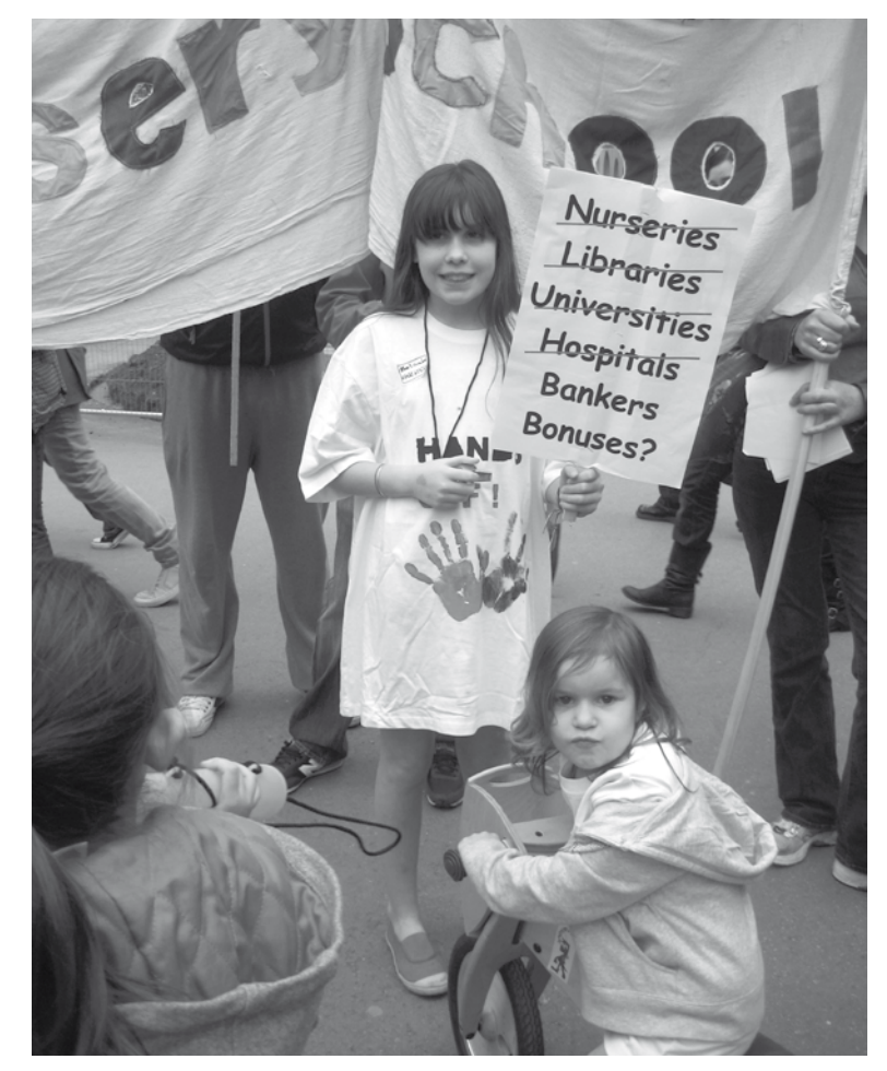
Children get the message across!

Around 30 supporters of the Save Our Children's Services - Westminster campaign marched on the 26 March TUC demonstration. Children from a local nursery used handprints to make t-shirts and placards saying 'hands off our services'. The demo will give a huge boost to hundreds of campaigns like ours everywhere.