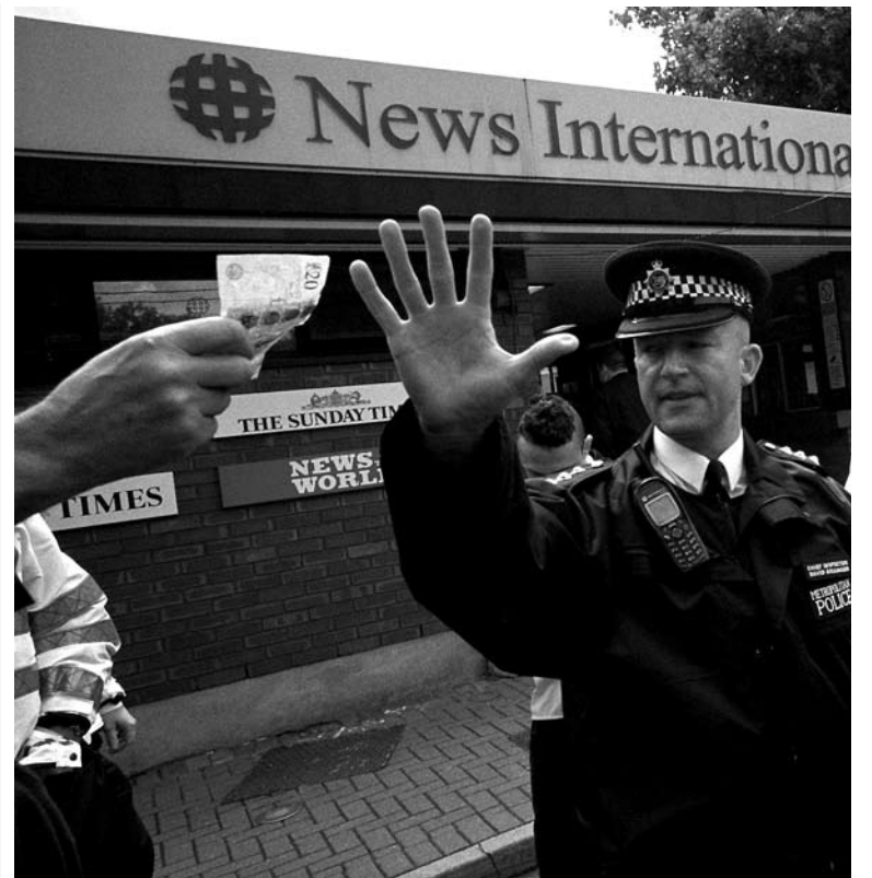
Cover-up and collusion at the Met?