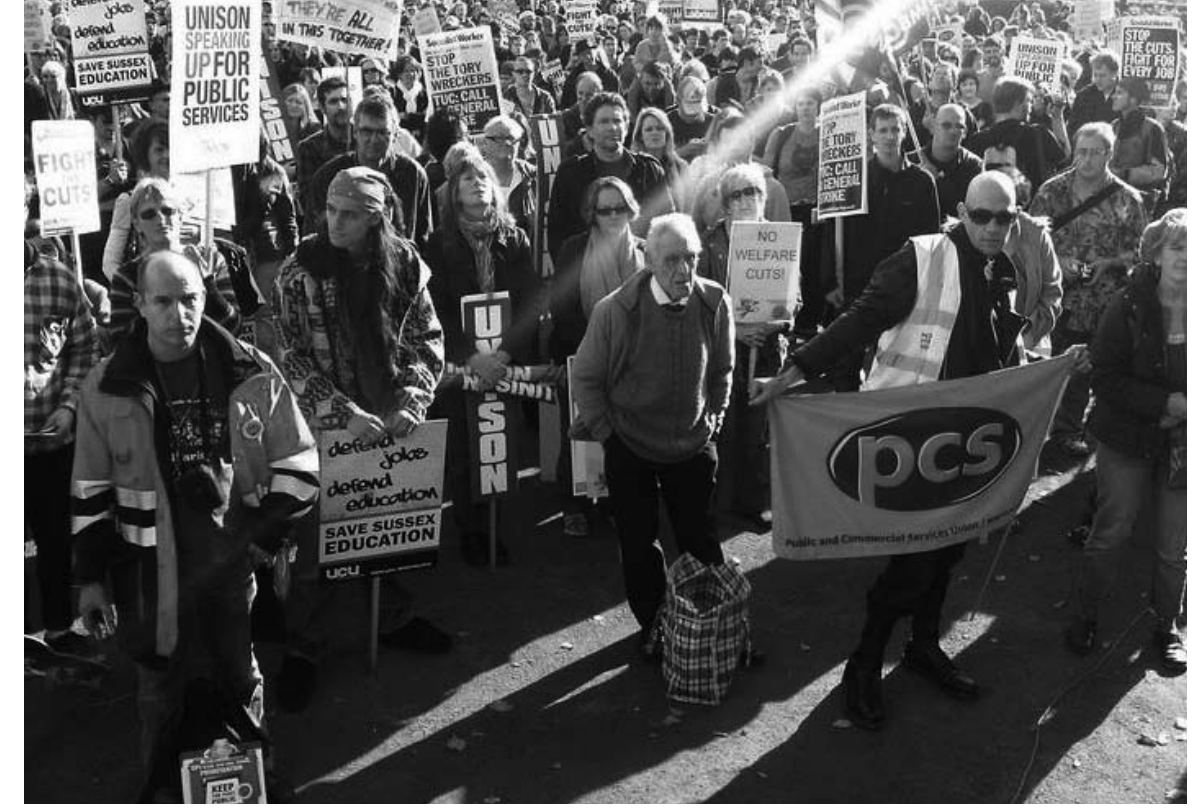
Thousands of people have protested against cuts in Brighton

The Greens propose raising council tax by 3.5% to "protect as far as