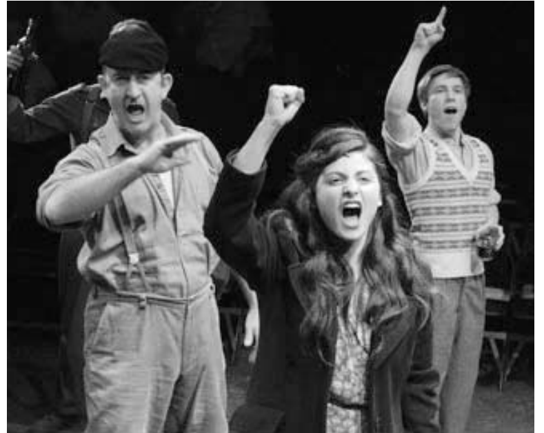
The lively production is a credit to the actors and writers

To music the different political forces are mentioned. The Socialists (PSOE), the Communists, the CNT/FAI anarchists, POUM and Trotskyists are all mentioned but presented