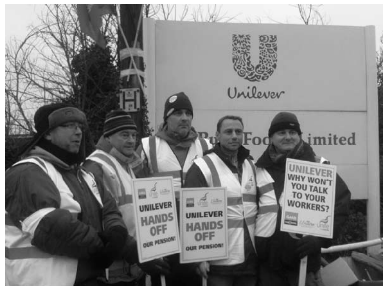
Unilever workers on the picket line

being adopted by the leadership of the civil service union PCS, which includes Socialist Party members, has been important. The Left Unity conference on 7 January played a vital role in keeping united national action on the agenda.