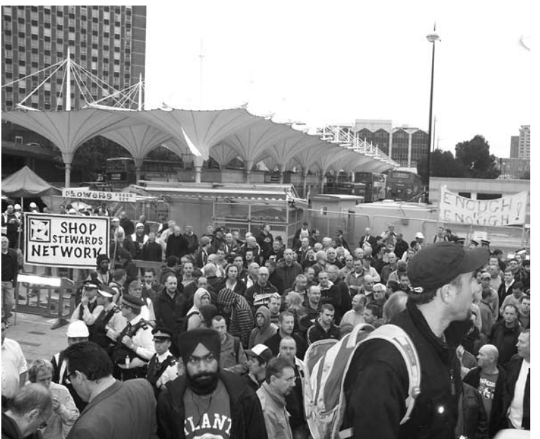
One of the many lively London protests

These protests will continue and they will act as a check on their union Unite and the officials when they enter into the negotiations with the construction companies. The companies want to force concessions out of the union to worsen the JIB but these electricians, pipefitters and plumbers are determined not to offer any concessions and to improve the JIB.