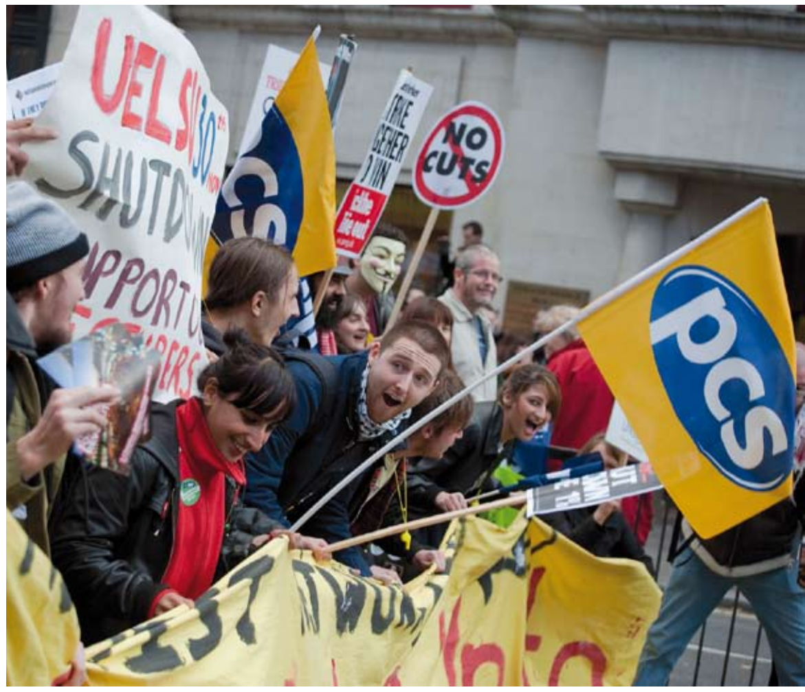
United on the 30 November strike demo in London