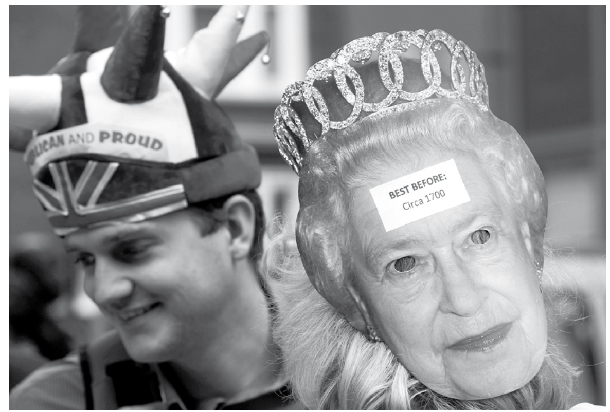
Protest at last year's royal wedding

On the positive side, many will get another bank holiday. If you get paid for it, which some bosses resist and workers may have to fight for, this is welcome. But unlike the two million who went on strike to defend their pensions last November, this day