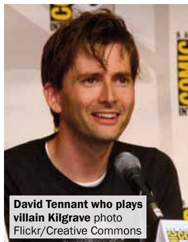
David Tennant who plays villain Kilgrave