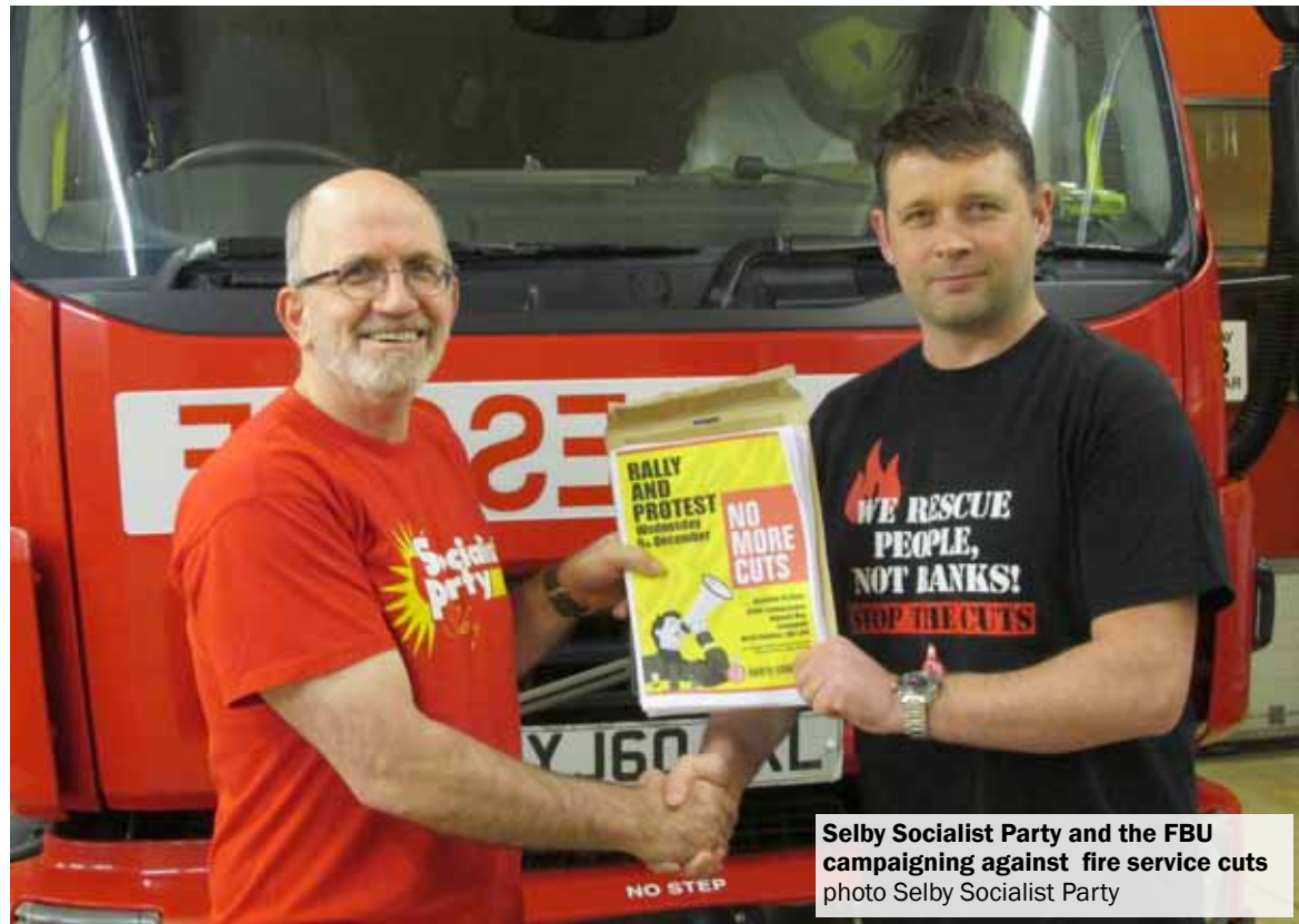
Selby Socialist Party and the FBU campaigning against fire service cuts

A further review of fire service resources in York is due soon and the Socialist Party and the Trade Unionist and Socialist Coalition (TUSC) in North Yorkshire will be continuing our campaign alongside the FBU against the implementation of these savage cuts.