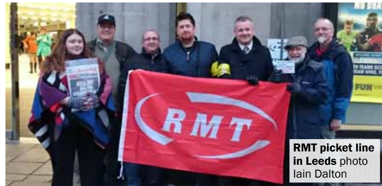
RMT picket line in Leeds

An indefinite train driver overtime ban is also currently in force which exposed the reliance on drivers working overtime and low staffing levels on Christmas Eve when a staff shortage led to cancel