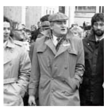
The Liverpool city councillors who led a mass campaign against Thatcher's cuts in the 1980s were surcharged - a power that no longer exists

No Labour councillor can credibly say 'we have no choice' but to implement the cuts. They do.