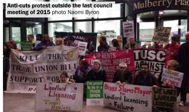
Anti-cuts protest outside the last council meeting of 2015