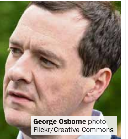
George Osborne

But, say the capitalist 'experts', there is an economic 'recovery' taking place, which in time will put the