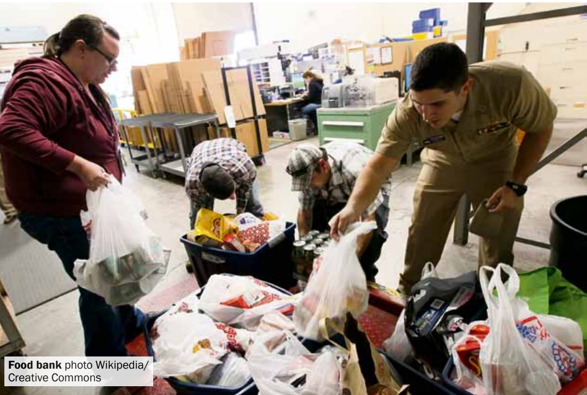
Food bank photo Wikipedia/Creative Commons

1950 to 1975 - of reforms, when capitalism was able to significantly progress, although never able to eliminate the ingrained class contradictions. The capitalists were able to afford a few crumbs from their rich table but now their deep-going economic crisis demands 'sacrifices', counter-reforms, savage cuts - not from those who have but from the poor and the working class.