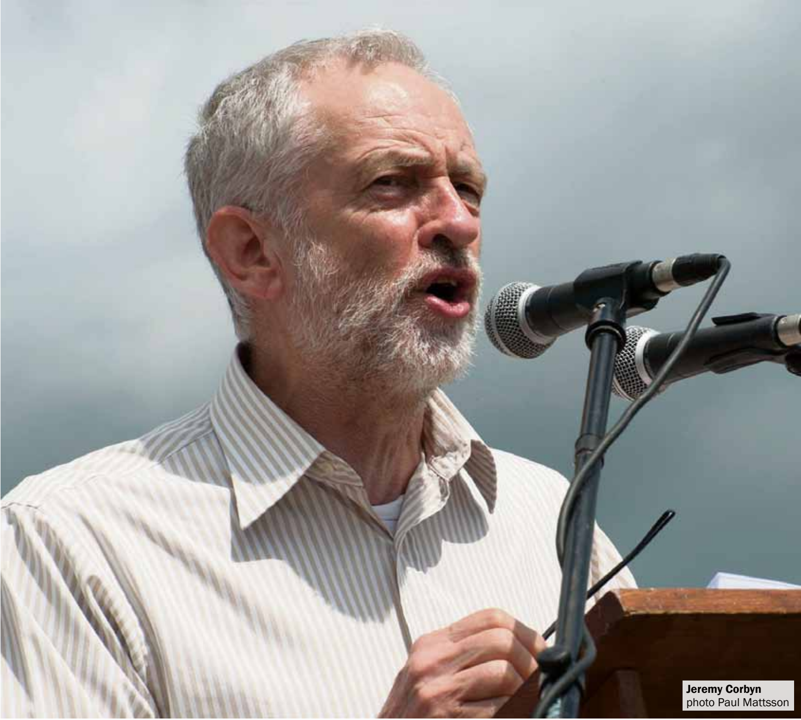
Jeremy Corbyn

However, not just a political but an economic and social revolution is necessary if the lives of the working