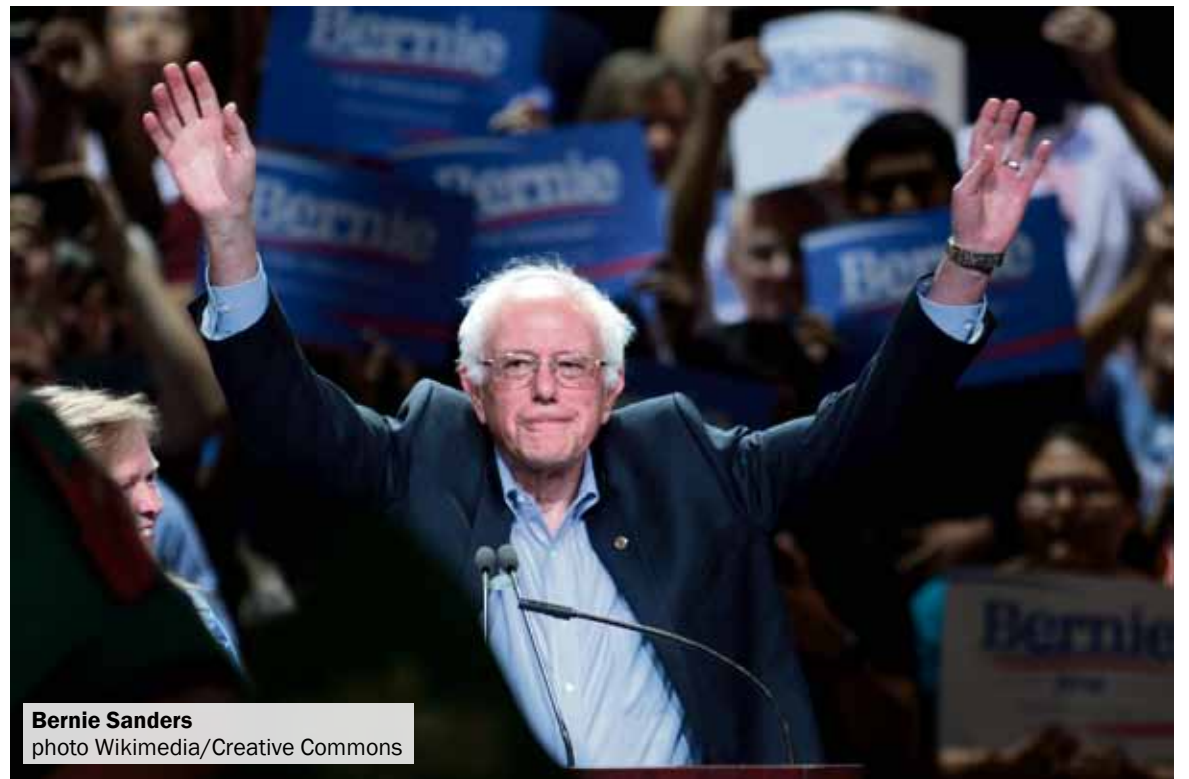
Bernie Sanders

This is in a period that is likely to be one of the stormiest in recent British history, with a clamour from the ranks of the labour movement and the working class for decisive action to re-