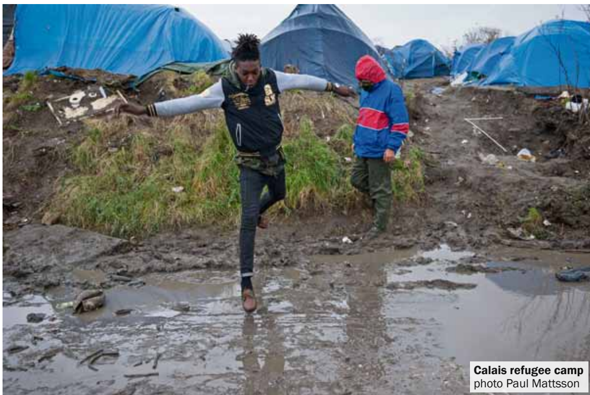
Calais refugee camp

This is still the real traditions of the left and particularly of the new generation who are moving into political struggle because they have seen the stultifying effects on them which capitalism now represents.