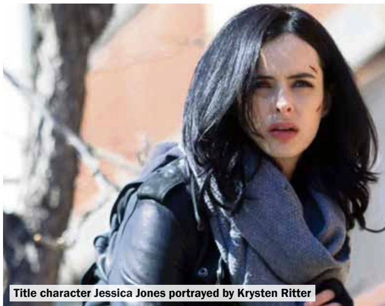
Title character Jessica Jones portrayed by Krysten Ritter

Jessica has super-strength, but eschews the idea of being a superhero. Instead of primary colours and spandex, we are introduced to her character as she goes about the muted, decaying shades of Hell's Kitchen in a hoodie and jeans, earning her living by photographing love