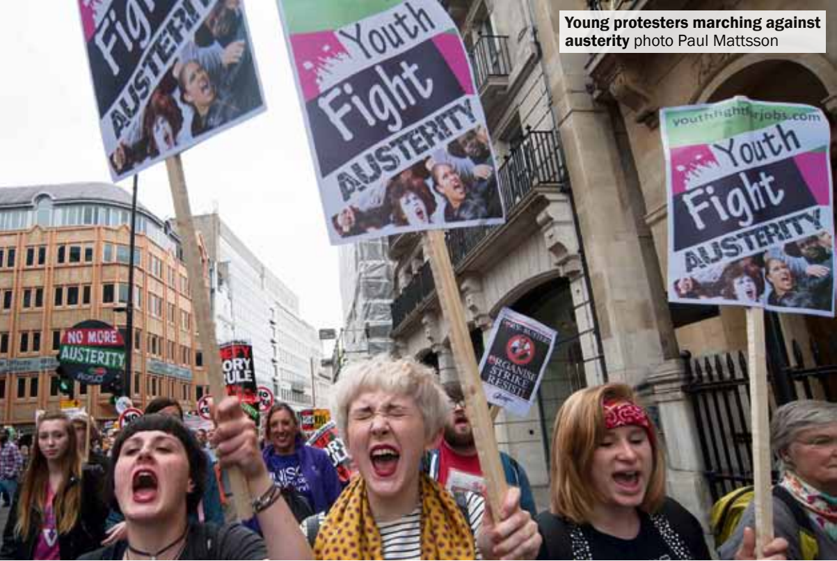
Young protesters marching against austerity

In other words, we have moved away from the period - roughly from