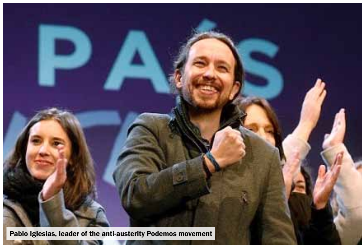
Pablo Iglesias, leader of the anti-austerity Podemos movement

Socialismo Revolucionario reporters (CWI in Spain)