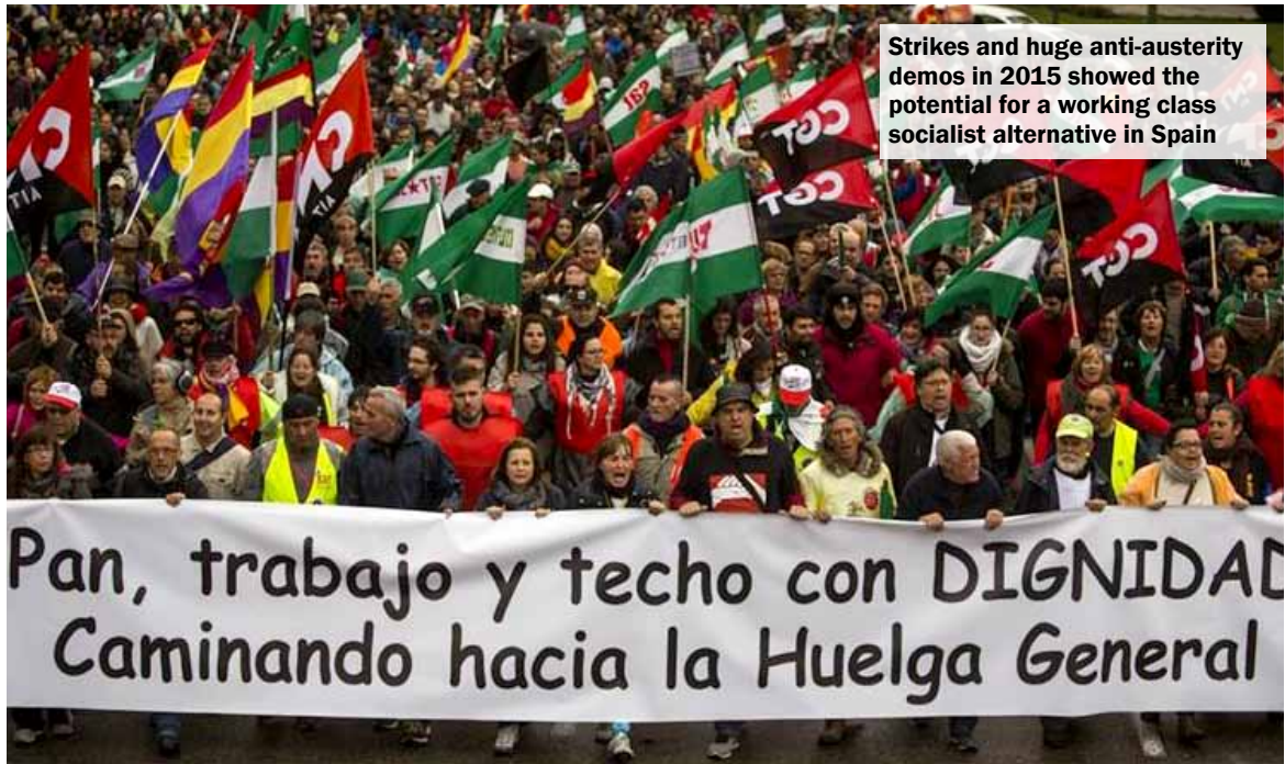
Strikes and huge anti-austerity demos in 2015 showed the potential for a working class socialist alternative in Spain

The most important change in the political situation is of course the entry of Podemos into the national parliament, with over five million votes in its first general election. Skilful performances in TV debates by its leader Pablo Iglesias - as well as the strong intervention of key