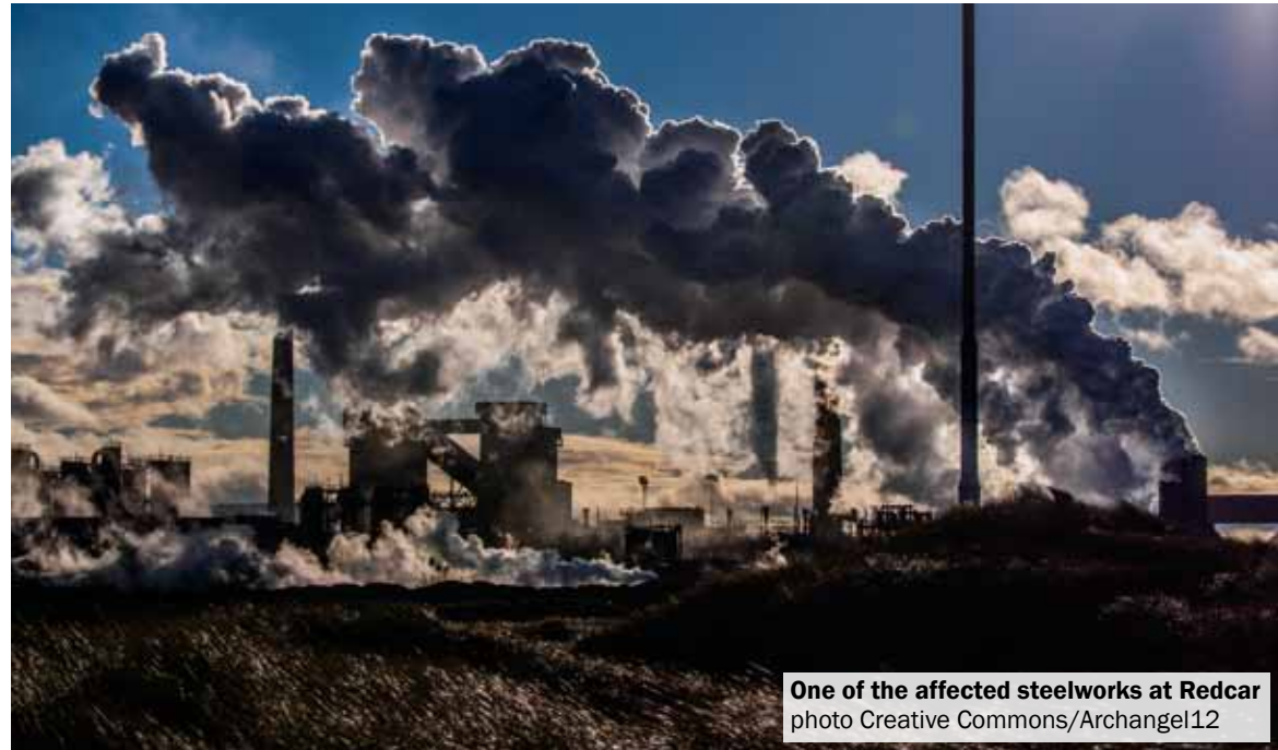
One of the affected steelworks at Redcar

While the immediate threat of redundancy has been removed for some Tata staff, it will not be lost