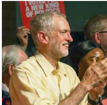
Jeremy Corbyn