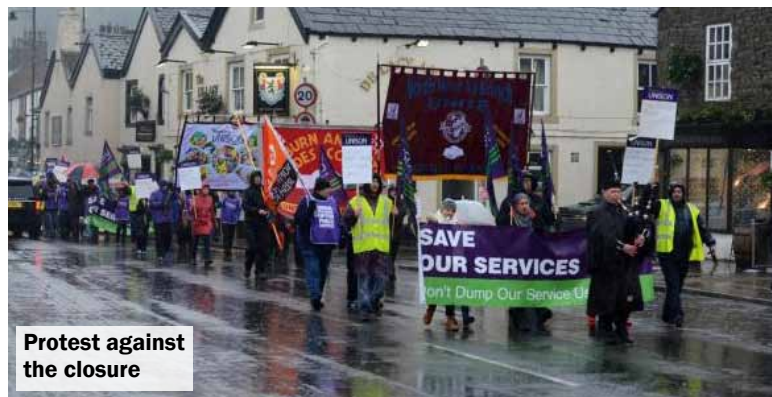
Protest against the closure