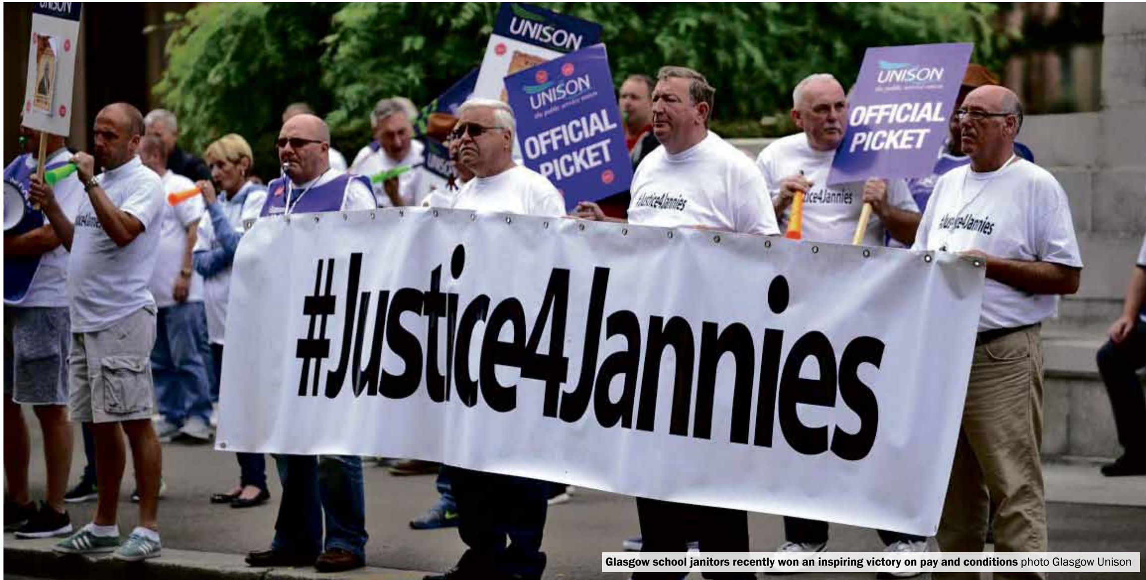
Glasgow school janitors recently won an inspiring victory on pay and conditions

with the RMT trade union, made a socialist, internationalist case for exit from the bosses EU during that referendum.