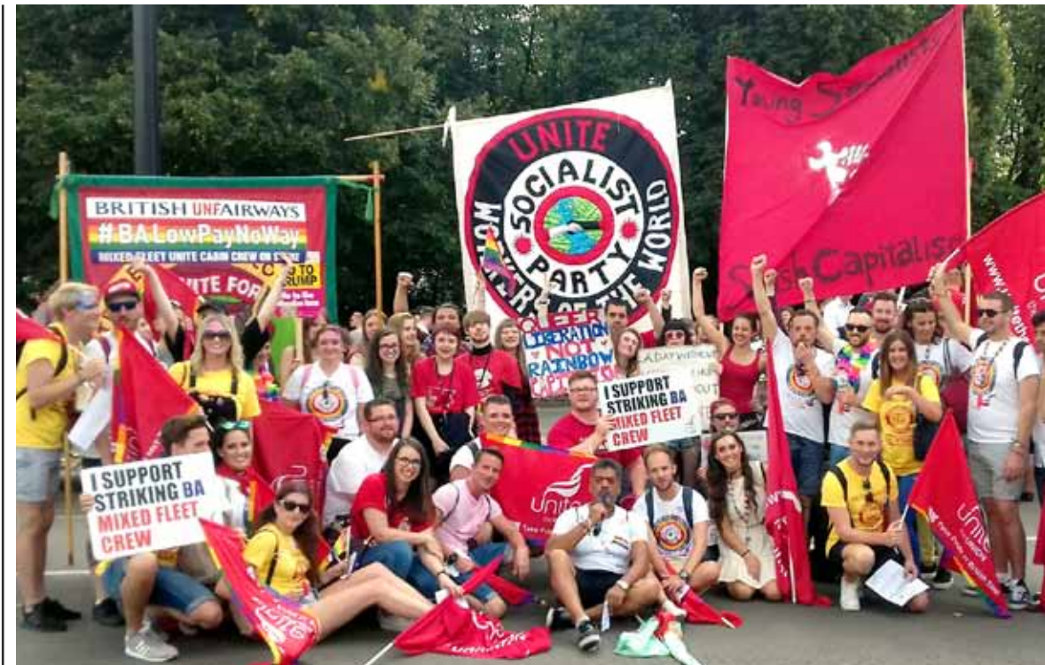
Cardiff Socialist Party and Young Socialists pictured with striking Unite BA mixed fleet workers at Pride Cymru in Cardiff on 26 August. Socialist Party members also joined Pride marches in Doncaster and Southampton on the same day