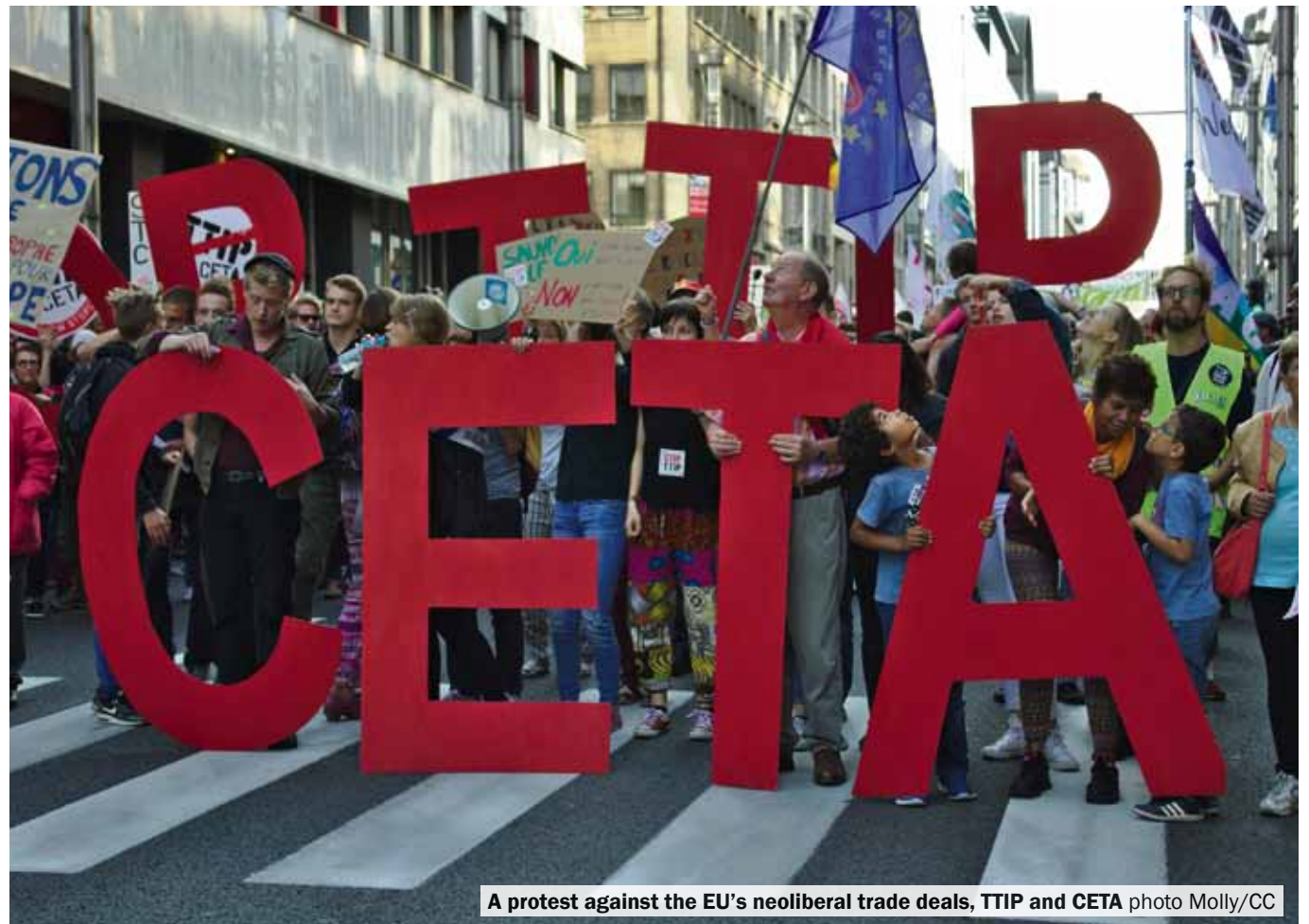
A protest against the EU's neoliberal trade deals, TTIP and CETA

After all, it was only weeks before this announcement that Corbyn said that under a Labour government Brexit would definitely mean leaving the Single Market. And only two months ago Corbyn, filled with confidence after the mass support his programme won in the general election, rightly sacked three front benchers for voting,