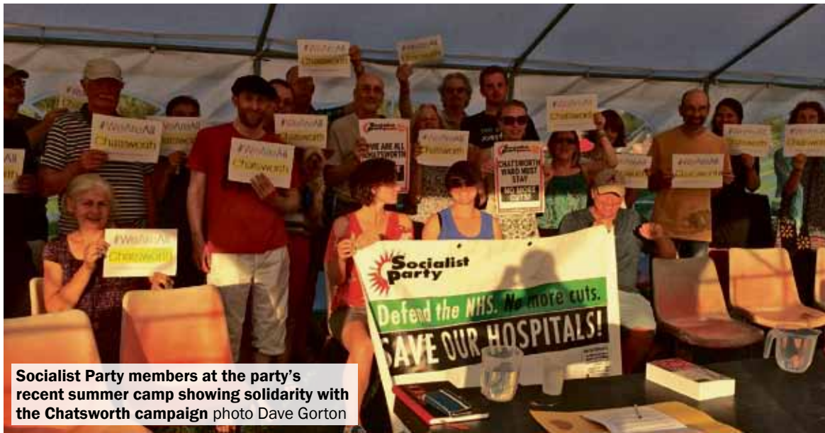
Socialist Party members at the party's recent summer camp showing solidarity with the Chatsworth campaign