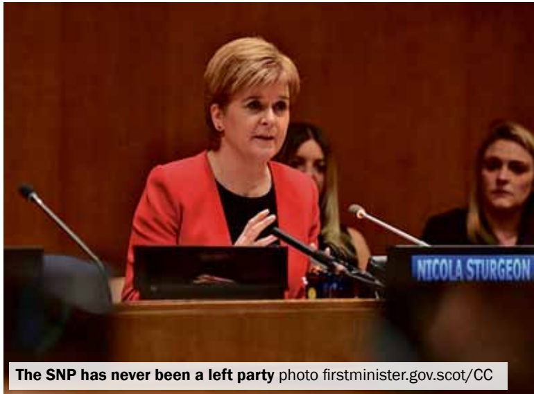
The SNP has never been a left party