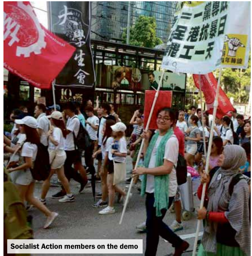
Socialist Action members on the demo

Socialist Action (CWI Hong Kong) reporters