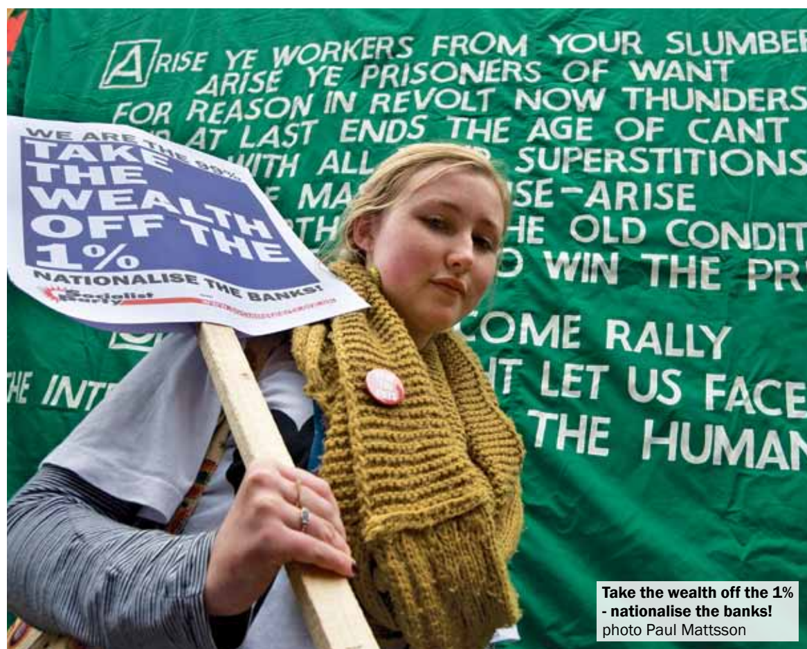
Take the wealth off the 1% - nationalise the banks!

Join the fightback! Join the Socialists!