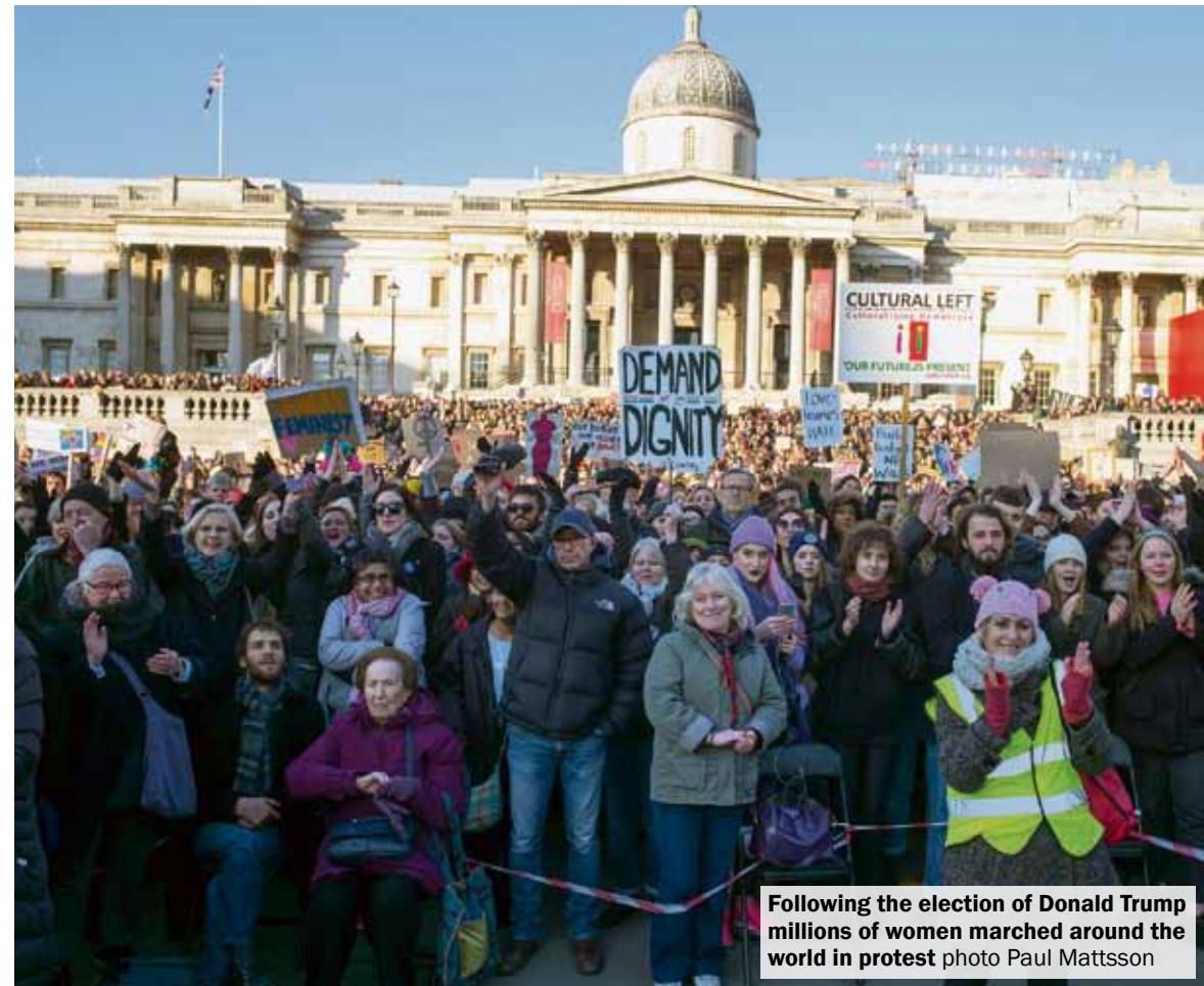
Following the election of Donald Trump millions of women marched around the world in protest